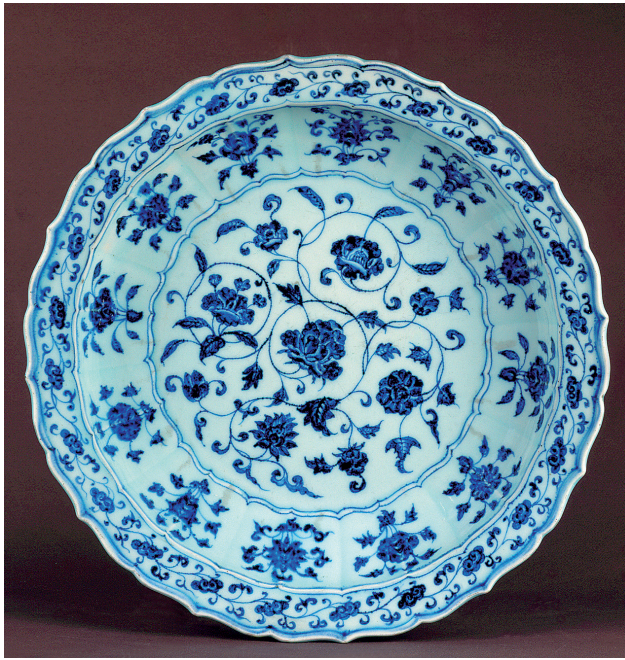
Fig. 14. Porcelain dish decorated under the glaze with cobalt blue vegetal motifs. Made in Jingdezhen town, Jiangxi province, south China in the early 15th century (Ming dynasty), probably in the reign of the Xuande emperor (1398-1435, reigned 1425-1435), diameter 38 cm. Athens, Benaki Museum, inv. no. 2516.

Meticulously decorated blue and white porcelains were popular with Chinese and Middle Eastern collectors and the largest collections survive in the Topkapi Palace in Istanbul and the Ardebil Shrine in Iran.