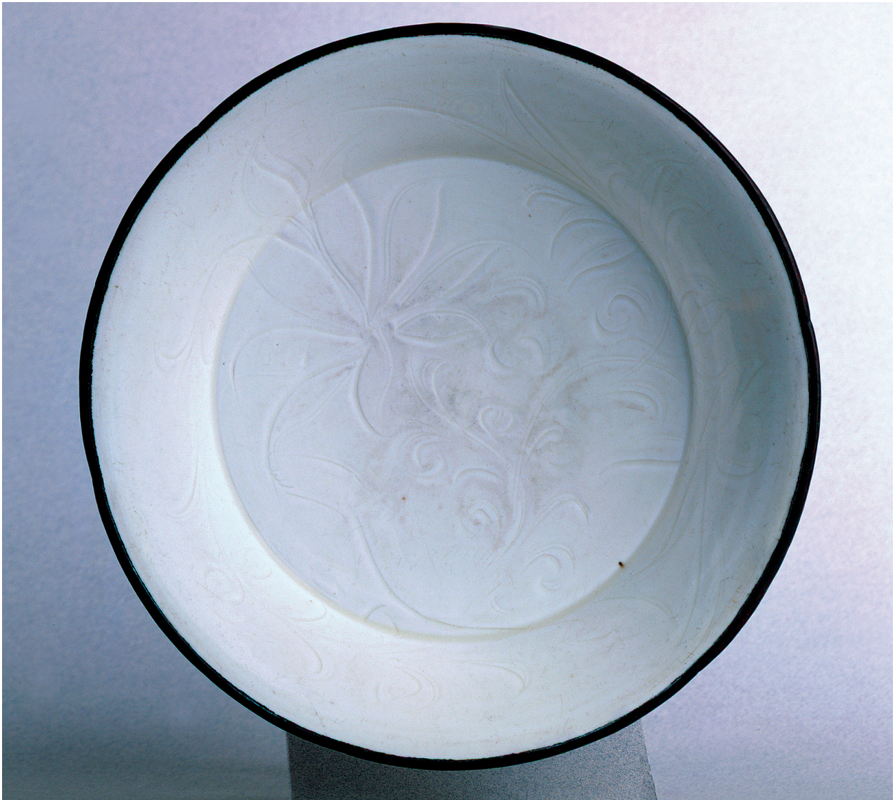
Fig. 13. Glazed stoneware dish with incised and carved decoration. Made in the Ding kilns, Hebei province, Northern China, during the Song dynasty (960-1279), diameter 22 cm. Athens, Benaki Museum, inv. no. 2372.

The decoration on this dish was carved and incised on the stoneware body. The vessel was then dipped in a fine glaze that fired an ivory-white colour. The delicacy of the resulting product anticipated the translucency of porcelain. The output of the Ding kilns was elevated to legendary status within the Chinese collecting tradition that Sir Percival David emulated.