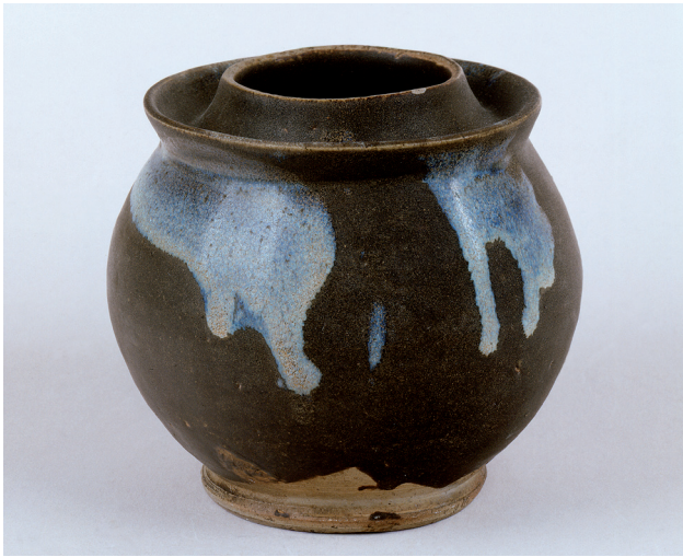
Fig. 10. Glazed stoneware vessel with phosphatic splashes. Made in the Henan province, central China, during the Tang dynasty (618-906), height 12 cm.