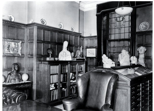
Fig. 12. A room in the George Eumorfopoulos residence at 7 Chelsea Embankment, Chelsea, London. Photograph taken in autumn-winter 1934.

The eclectic mix of European and Oriental antiques in this photograph exemplifies Eumorfopoulos' catholic tastes.