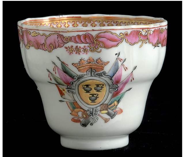
Fig. 4. Porcelain cup with overglaze enamel decoration of cartouches and C-scrolls around the rim and an armorial device. Made in Jingdezhen town, Jiangxi province, south China, during the reign of the Qianlong emperor (1711-1799, reigned 1735-1796), height 7 cm.

This censer bears Arabic inscriptions within a purely Chinese decorative scheme on a Chinese-shaped vessel. It was probably commissioned by Middle Eastern clients or Muslims living in China. Arabic calligraphy is commonly found on palace orders for the court of the Zhengde emperor (1491-1521, reigned 1505-1521), a Muslim sympathizer and possible convert to Islam.