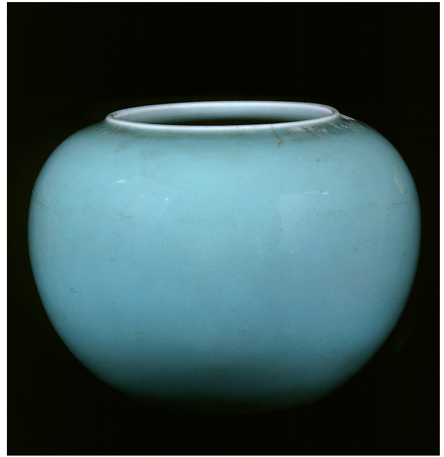
Fig. 15. Porcelain water pot covered in a pale blue glaze. Made in Jingdezhen town, Jiangxi province, south China, during the early 18th century, probably in the reign of the Yongzheng emperor (1678-1735, reigned 1722-1735), height 13 cm. Athens, Benaki Museum, inv. no. 2661.

Meticulously decorated blue and white porcelains were popular with Chinese and Middle Eastern collectors and the largest collections survive in the Topkapi Palace in Istanbul and the Ardebil Shrine in Iran.