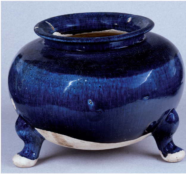
Fig. 8. Glazed earthenware tripod vessel. Made in the Henan province, central China, during the Tang dynasty (618-906), height 16.5 cm. Athens, Benaki Museum, inv. no. 2242.

Despite the simplicity of its shape and monochrome decoration, this vessel is generously covered in a cobalt-rich glaze. Cobalt, a mineral pigment that fired a deep blue colour, was imported during the Tang dynasty from Central Asia and was expensive. Consequently, it was only used for the best quality wares. The individual accompanied by such luxurious burial gifts must have enjoyed an elevated status.