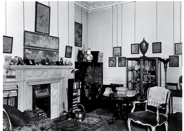
Fig. 11. A room in the George Eumorfopoulos residence at 7 Chelsea Embankment, Chelsea, London. Photograph taken in autumn-winter 1934.

The predominance of ceramics among other arts and the long European tradition of collecting porcelain encouraged Eumorfopoulos to create a teaching collection initially of 104 pots. They encompassed the breadth of Chinese ceramic traditions from the Bronze Age to the eighteenth century and were first loaned to the Fitzwilliam Museum in Cambridge. They later formed the nucleus of his donation to the Greek nation, 341 items that reached Piraeus on 4th May 1929. He had approached Antonis Benakis (1873-1954) to act as intermediary and arrange an exhibition venue. Benakis suggested their inclusion in the museum he founded in memory of his father Emmanuel (1843-1929) in 1930. After Eumorfopoulos had sold the bulk of his collection to the British Museum and the Victoria and Albert in 1934 because of the economic recession, he presented another 452 pieces to the Benaki (May 1936). He also commissioned, shipped and paid for the mahogany display cases. Finally, he arranged for Leigh