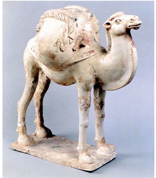
Fig. 7. Glazed terracotta figurine of a camel. Made in the Henan or Shaanxi provinces, central China, during the Sui (581-618) or early Tang (618-906) dynasties, height 35.5 cm, length 33.5 cm. Athens, Benaki Museum, inv. no. 2186.

This bottle was originally fitted with a metal device to enable its use as a water pipe ( hookah ). The shape copies hookahs produced in Mughal India during the 17th century and it was probably made for export to this part of the world. However, the decoration is purely Chinese in technique and subject matter.