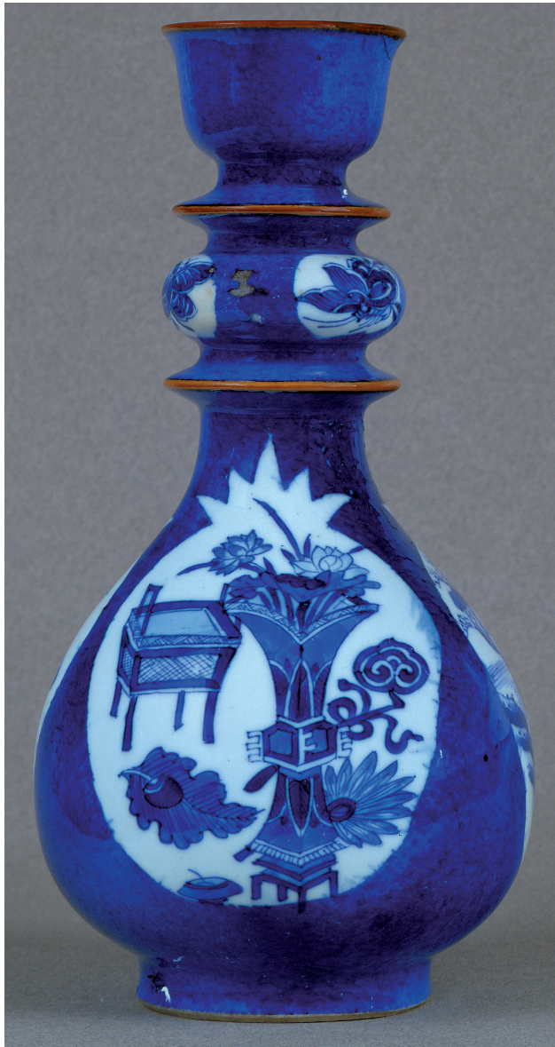
Fig. 6. Porcelain hookah base with underglaze cobalt blue painted decoration. Made in Jingdezhen town, Jiangxi province, south China during the reign of the Kangxi emperor (1654-1722, reigned 1661-1722), height 38 cm.