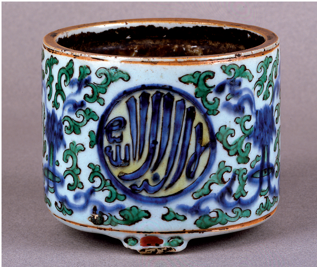
Fig. 2. Porcelain cup with moulded animal and vegetal decoration. Made in the region of Dehua, Fujian province, southeast China, during the 17th century.

Fitted with a gilt metal handle, lip and foot in Europe during the 18th century, height 8.5 cm. Athens, Benaki Museum, inv. no. 2577.