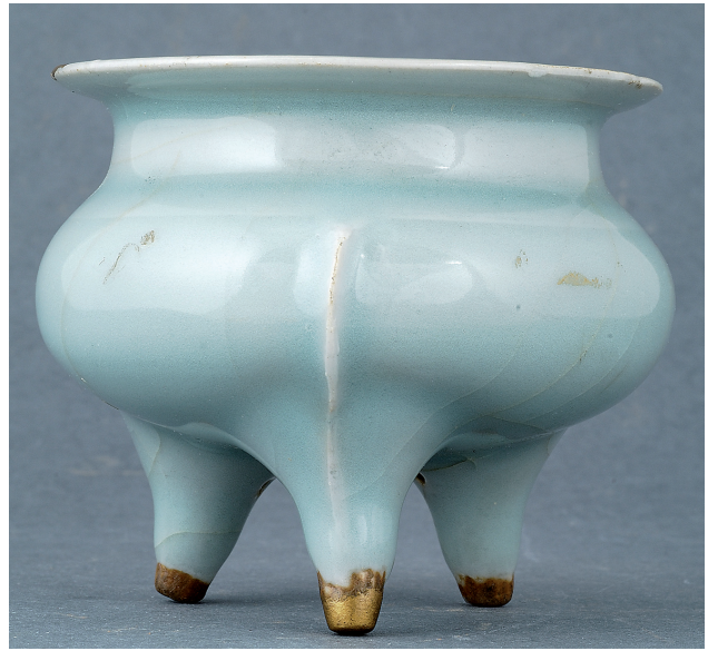
Fig. 9. Glazed stoneware tripod censer. Made in the Longquan kilns, Zhejiang province, southeast China, during the Song dynasty (960-1279), height 7.5 cm.

Despite the simplicity of its shape and monochrome decoration, this vessel is generously covered in a cobalt-rich glaze. Cobalt, a mineral pigment that fired a deep blue colour, was imported during the Tang dynasty from Central Asia and was expensive. Consequently, it was only used for the best quality wares. The individual accompanied by such luxurious burial gifts must have enjoyed an elevated status.