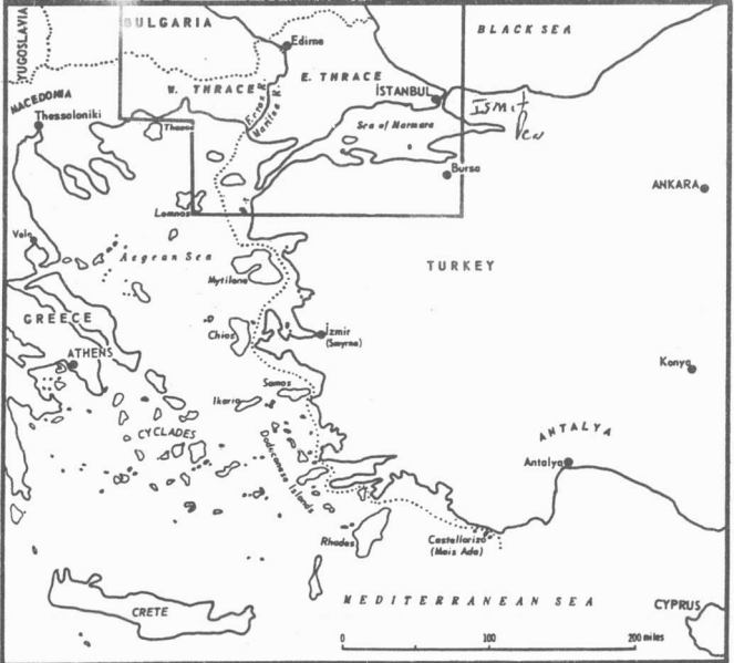
Map 2. The Aegean Islands