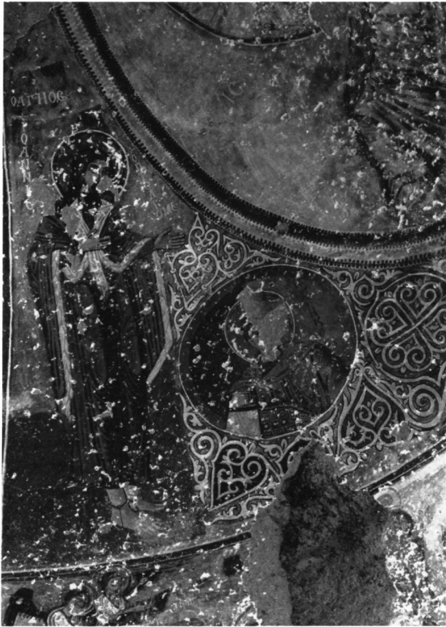
Fig. 4. Tagar. John the Baptist and Cyricus.