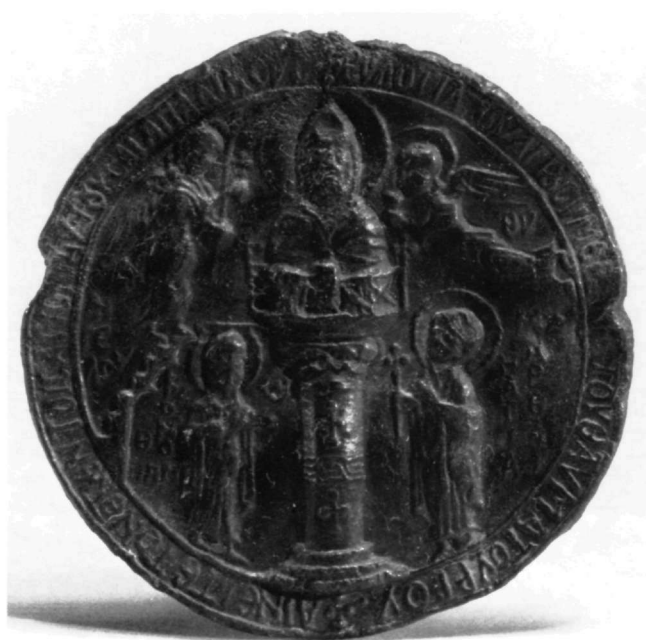
Fig. 6. Simeon Stylites the Younger. Pilgrimage token (The Cleveland Museum of Art, Norman O. Stone and Ella A. Stone Memorial Fund, 72.52).

(ca. 389-459) 23 , who ran away from home at an early age, and subjected himself to extremes of physical self-denial and mortification of the body, culminating in the more than 30 years he spent on a column at Qal'at Sim'an. His example, and his miracles, which include healing lepers and paralytics and curing barren women, attracted thousands of pilgrims to his monastery. Simeon was sensitive to the potential for impurity implied by the presence of women, who were not allowed into his immediate vicinity 24 . According to the Greek version of his vita, he easily detected a woman who disguised herself as a soldier in order to try to approach him 25 . This restriction even applied to Simeon's mother during her lifetime. When after 20 years, she finally learned of her son's whereabouts, she journeyed to the monastery. She begged to see him face to face once again, but he did not permit it. She wished at least to be blessed by his own hands, but when she began to climb the ladder placed against his column she fell precipitously to the ground. Simeon assured her that they would see one another in this world, but he suggested she rest a while and then he would see her. The mother sat down in the vestibule, and suddenly she died. Simeon had her body brought into the enclosure and placed before his column. Simeon, weeping, prayed to God to receive her soul in peace. While he prayed, his mother revived mo-