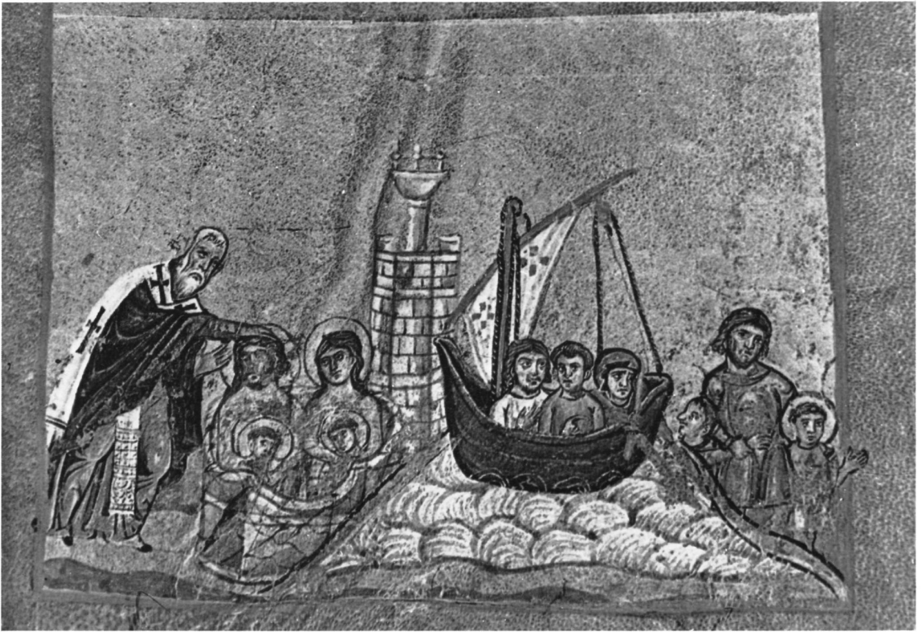
Fig. 9. Mount Athos, Esphigmenou MS 14 , f. 52r. Baptism of Eustace and his Family, Capture of Theopiste.

was built around his column 29 . Cures were effected in a variety of ways, both at the monastery and at a distance from it. The supplicant was often healed through the application of various substances ( eulogia ) blessed by the saint, particularly holy dust from the mountain, as Gary Vikan 30 has shown. In addition, some pilgrims seeking miraculous cures were brought directly into the presence of the saint. They gained access by climbing a monolithic staircase, the remains of which are still preserved on the south side of the column, and then mounting a ladder which extended to the platform on top of the column 31 . Unlike Simeon the Elder, the younger Simeon did not avoid physical contact with women. They had the same access to him as men, and he sometimes healed them by laying his hands on the afflicted parts of their bodies 32 .