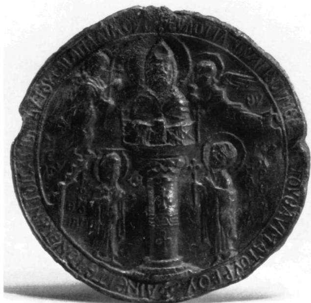
Fig. 6. Simeon Stylites the Younger. Pilgrimage token (The Cleveland Museum of Art, Norman O. Stone and Ella A. Stone Memorial Fund, 72.52).

(ca. 389-459) 23 , who ran away from home at an early age, and subjected himself to extremes of physical self-denial and mortification of the body, culminating in the more than 30 years he spent on a column at Qal'at Sim'an. His example, and his miracles, which include healing lepers and paralytics and curing barren women, attracted thousands of pilgrims to his monastery. Simeon was sensitive to the potential for impurity implied by the presence of women, who were not allowed into his immediate vicinity 24 . According to the Greek version of his vita, he easily detected a woman who disguised herself as a soldier in order to try to approach him 25 . This restriction even applied to Simeon's mother during her lifetime. When after 20 years, she finally learned of her son's whereabouts, she journeyed to the monastery. She begged to see him face to face once again, but he did not permit it. She wished at least to be blessed by his own hands, but when she began to climb the ladder placed against his column she fell precipitously to the ground. Simeon assured her that they would see one another in this world, but he suggested she rest a while and then he would see her. The mother sat down in the vestibule, and suddenly she died. Simeon had her body brought into the enclosure and placed before his column. Simeon, weeping, prayed to God to receive her soul in peace. While he prayed, his mother revived mo-