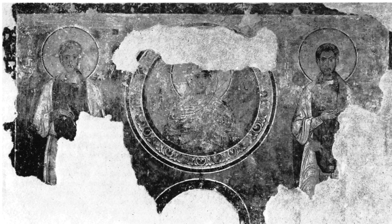
Fig. 8. Episkopi, Eurytania. Cosmas and Damian with Theodota. Athens, Byzantine Museum.

28. P. van den Ven, La vie ancienne de S. Syméon Stylite le Jeune (521-592), Brussels 1962 (hereafter La vie ancienne ). J. Lafontaine-Dosogne, Itinéraires archéologiques dans la région d'Antioche. Recherches sur le monastère et sur l'iconographie de S. Syméon Stylite le Jeune , Brussels 1967 (hereafter Itinéraires archéologiques ).