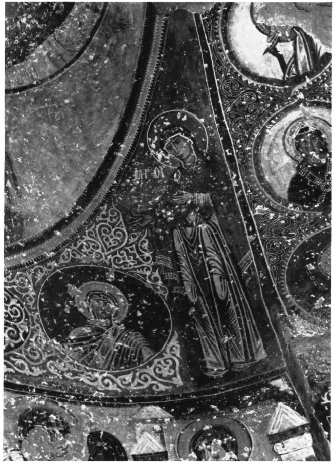
Fig. 5. Tagar. Julitta and Virgin Mary.

Painting in Asia Minor, New York 1967 (hereafter Byzantine Wall Painting ), plan XXXV, pls. 355-62, 364.