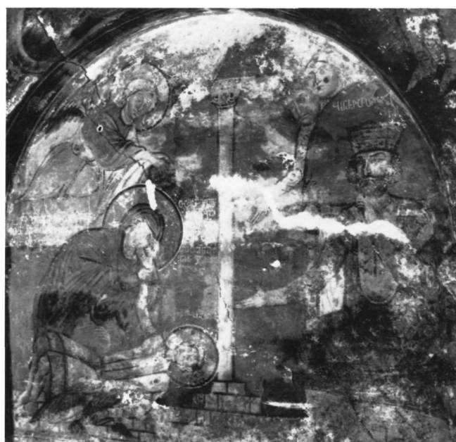
Fig. 2. Lagurka. Martyrdom of Cyricus and Lamentation of Julitta (after Beridze et al., Treasures of Georgia, p. 75).