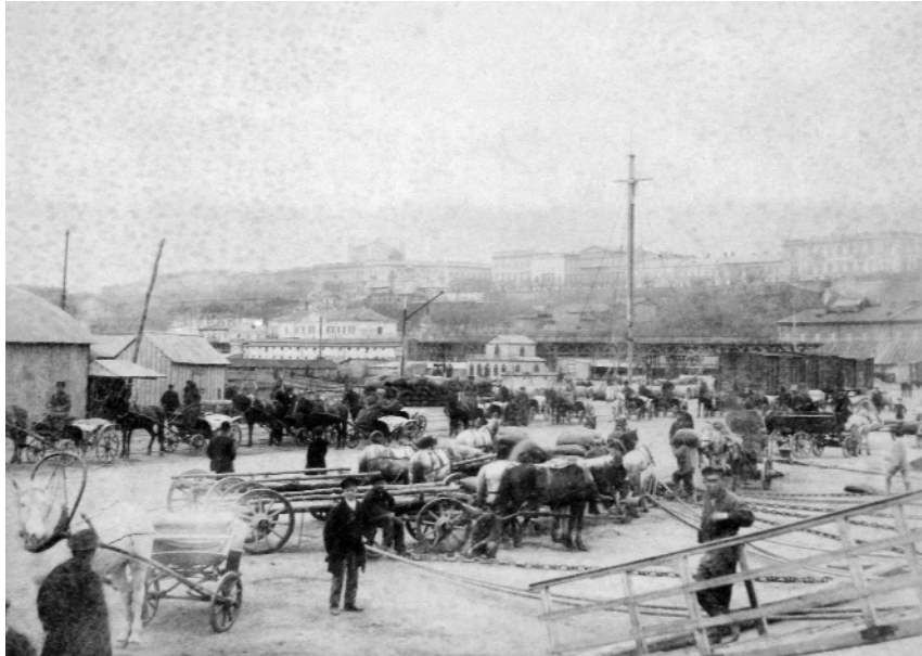
Grain transported to the Odessa port.