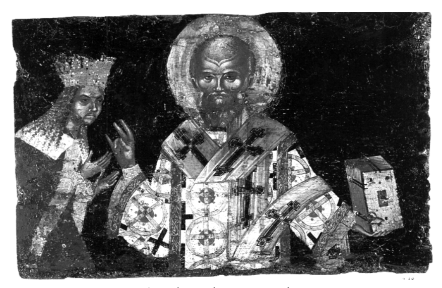
St Niphon and Neagoe Basarab. Dionysiou monastery, Mount Athos, first quarter of the 16th century.

dedicated to St Niphon.<sup>35</sup> In essence, these are specimens of a non-verbal production which, together with the textual materials under discussion here, were designed to supplement and finalise a highly invested project ultimately aiming at the ritual relief and recuperation of the wounded legitimacy of Basarab's monarchical power, which had been achieved in rather shady circumstances involving usurpation and bloodshed.<sup>36</sup> The Christian prince's personal and political identities were fully reconfigured by being filtered through his strongly accentuated, almost familial relationship with the sanctified prelate, who had been persecuted by a prominent member of the clan from which Neagoe had usurped the right to power.<sup>37</sup> In the right light, even