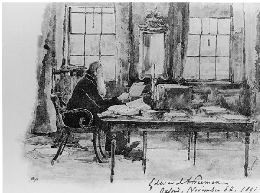
Fig. 2. E. A. Freeman in his study at Oriel College, Oxford, November 1891.