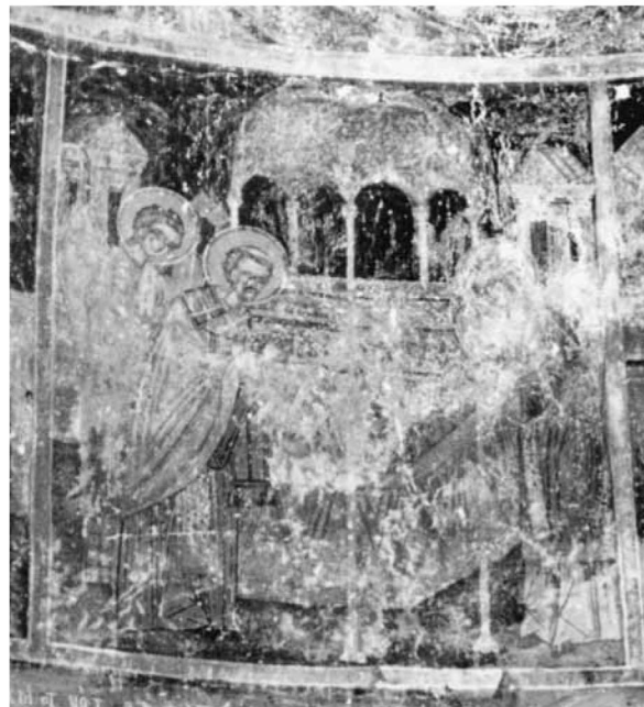
2. The Liturgy of St. John Chrysostom. The church of Archangels Michael and Gabriel (1720 - 1725), Moschopolis.