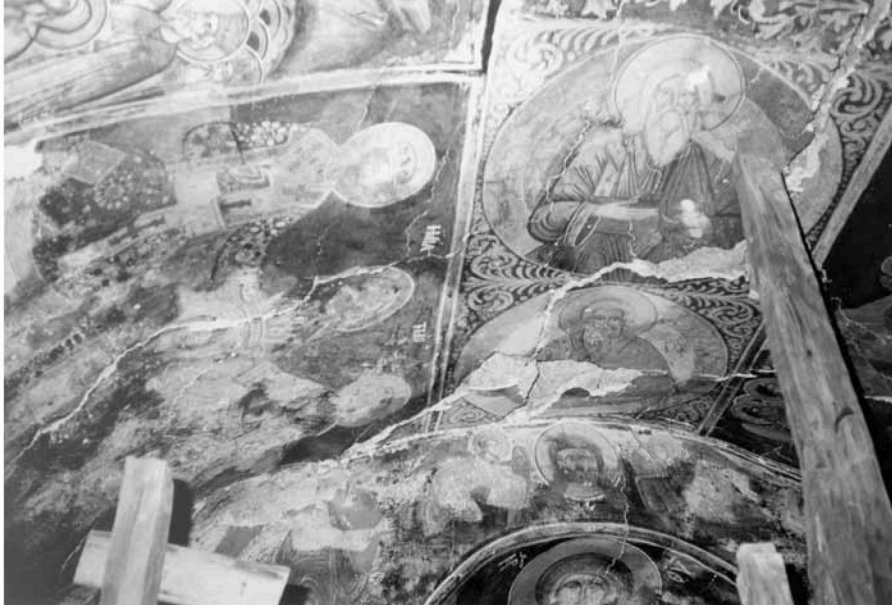
5. The Three-Faced Christ and The Crowning of the Holy Virgin. The chapel of SS. Cosmas and Damian (1750), Vithkuqi.