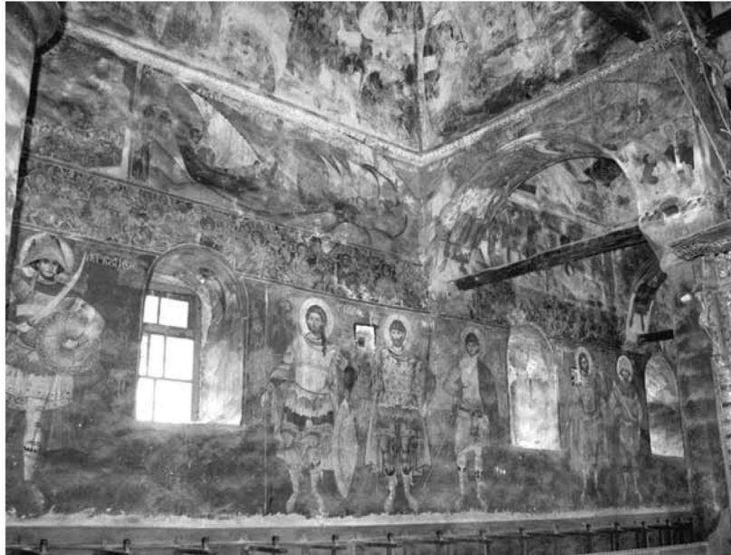
14. Saints and Scenes from St. Nicholas Vita. The church of St. Nicholas (1726), Moschopolis.