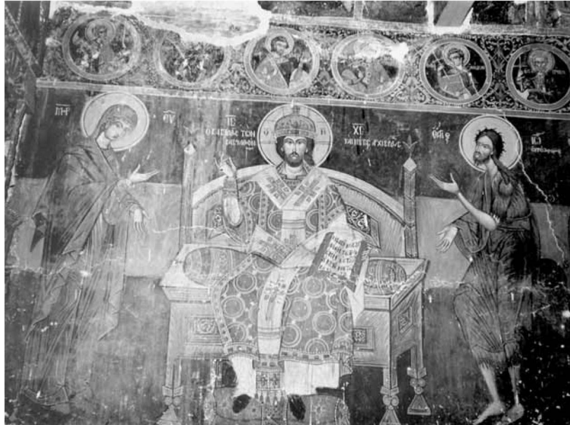
11. King's Deesis . The church of Archangels Michael and Gabriel (1682-1728), Vithkuqi.