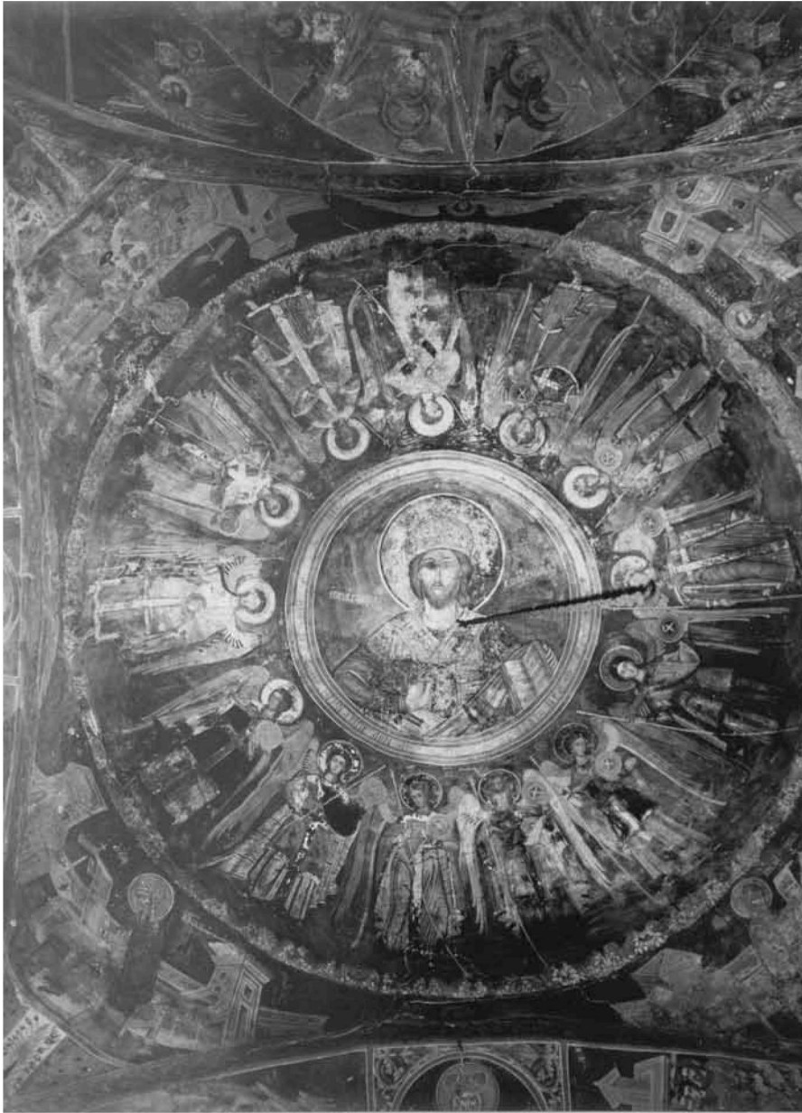
9. Christ King of Kings and High Priest. The church of Archangels Michael and Gabriel (1720-1725), Moschopolis.