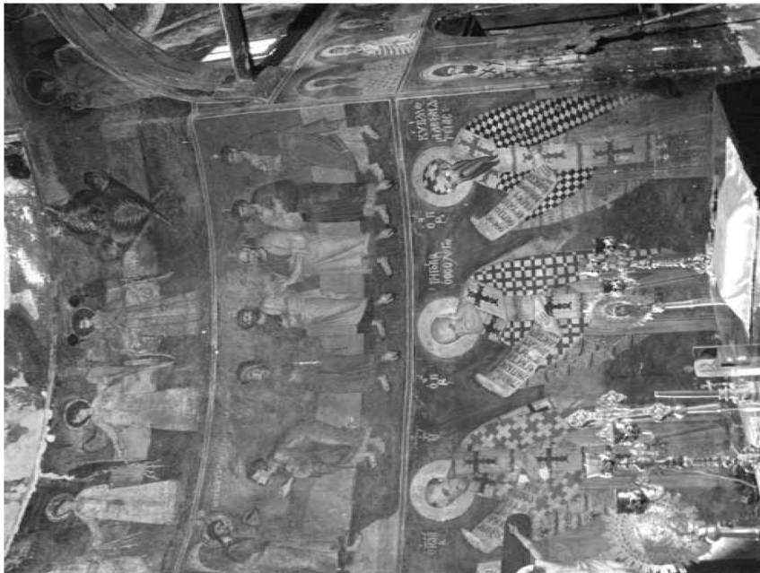
3. The Apse. The church of St. Nicholas (1726), Moschopolis.