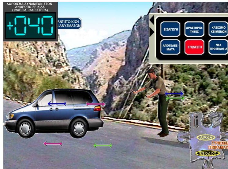
Figure 1. “Interactions between Objects”: the driver starts moving backward while trying to move his car forward (‘run my model’)

revealed that the students' attention, active participation and collaboration were significantly more important compared to traditional teaching (Solomonidou & Kolokotronis, 2004). Also, the comparison of the students' answers to the pre- and the post- test questionnaire showed that the percentages of students' incorrect answers had substantially decreased (from 60% to 90%), and that the initial differences associated with gender, age and area of residence have diminished.