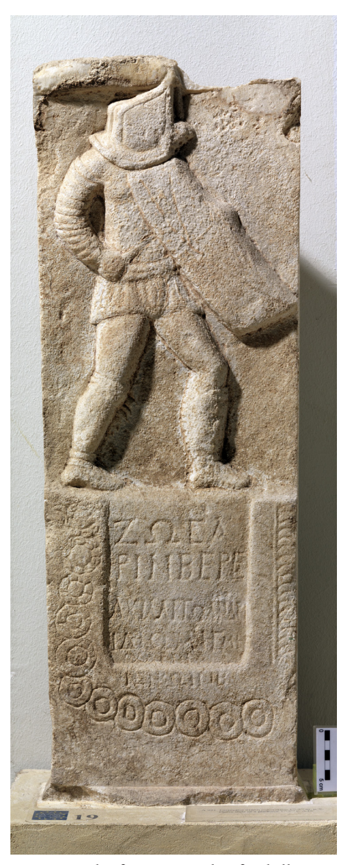
Fig. 1: The funerary stele of Achilles.

Two New Gladiatorial Monuments from Amphipolis