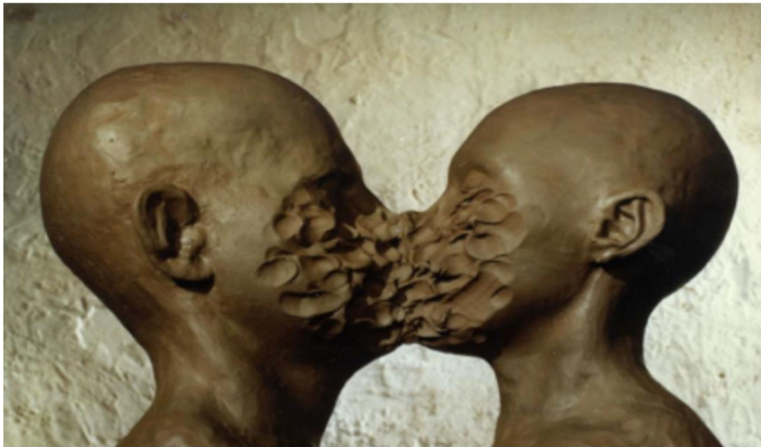
Image 4. Švankmajer, J. (Director). (1989). Darkness, Light, Darkness . [Film]. Krátký film Praha.