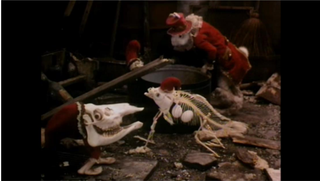
Image 6. Švankmajer, J. (Director). (1988). Something from Alice . [Film]. Krátký film Praha.