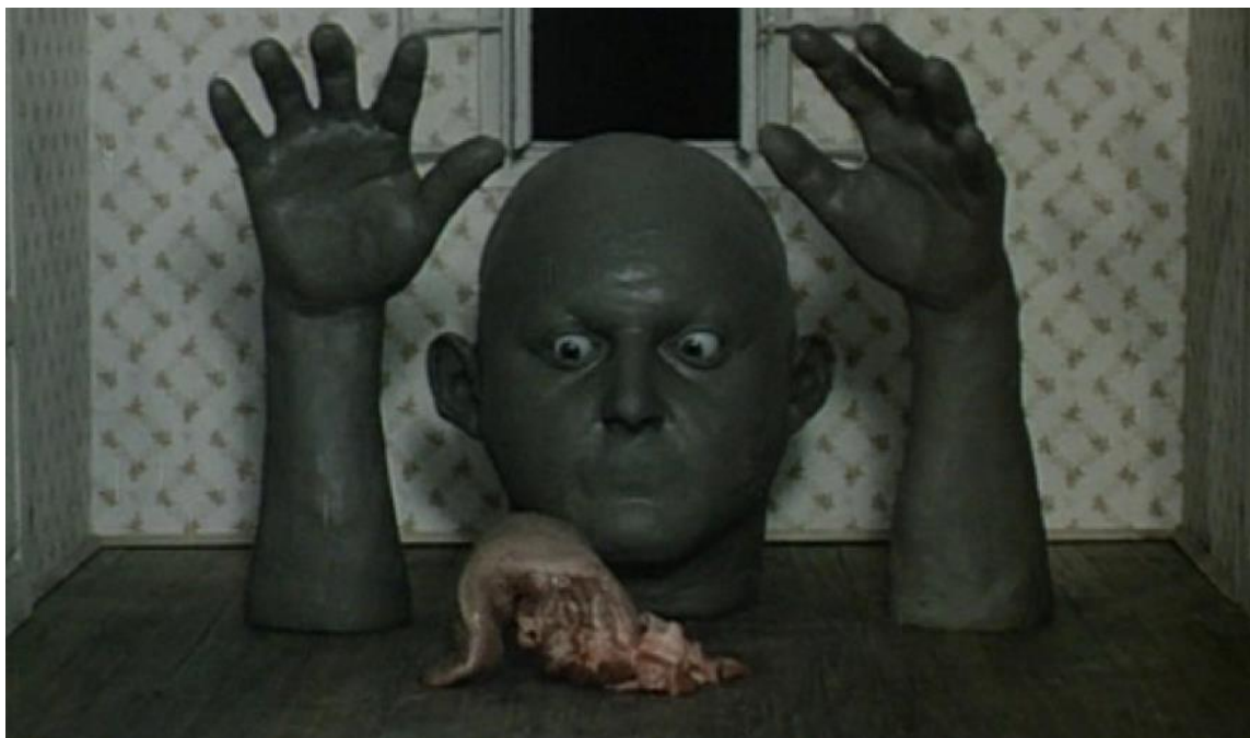
Image 2. Švankmajer, J. (Director). (1983). Dimension of Dialogue . [Film]. Krátký film Praha.

The grotesque puppet in Svankmajer's films is essentially an inanimate object which has been endowed with the ability to embody life. This puppet as a performative object has its own ontological narrative which is not similar to that of a real-life being. To express existence, it has to rely entirely on the energy transferred to its body by the hands of the animator. In accordance with Bakhtin's writings, the puppet's grotesque body lies between the realms of life and death, it is part of both an organic and inorganic world, spiritual and physical, finding itself in a state of never completed metamorphosis. Bones, household objects, old toys, and particularly food come to life in every Svankmajer film creating their own rules when it comes to their deformed anatomy. In Darkness, Light, Darkness (1989) various clay organs, a human denture, a pair of eyes, an animal's brain and limbs gather together into a small room. As other limbs try to join, they attempt to assemble themselves into some frightening and disturbing combinations. Among the clay figures, a real tongue suddenly joins in. The film is about the contrasting textures as much as it is about the unmitigated physicality of putting a cow's tongue in a small theatrical set. The audience understands that is a real tongue being animated on-screen, and there is a feeling of revulsion that comes with it.