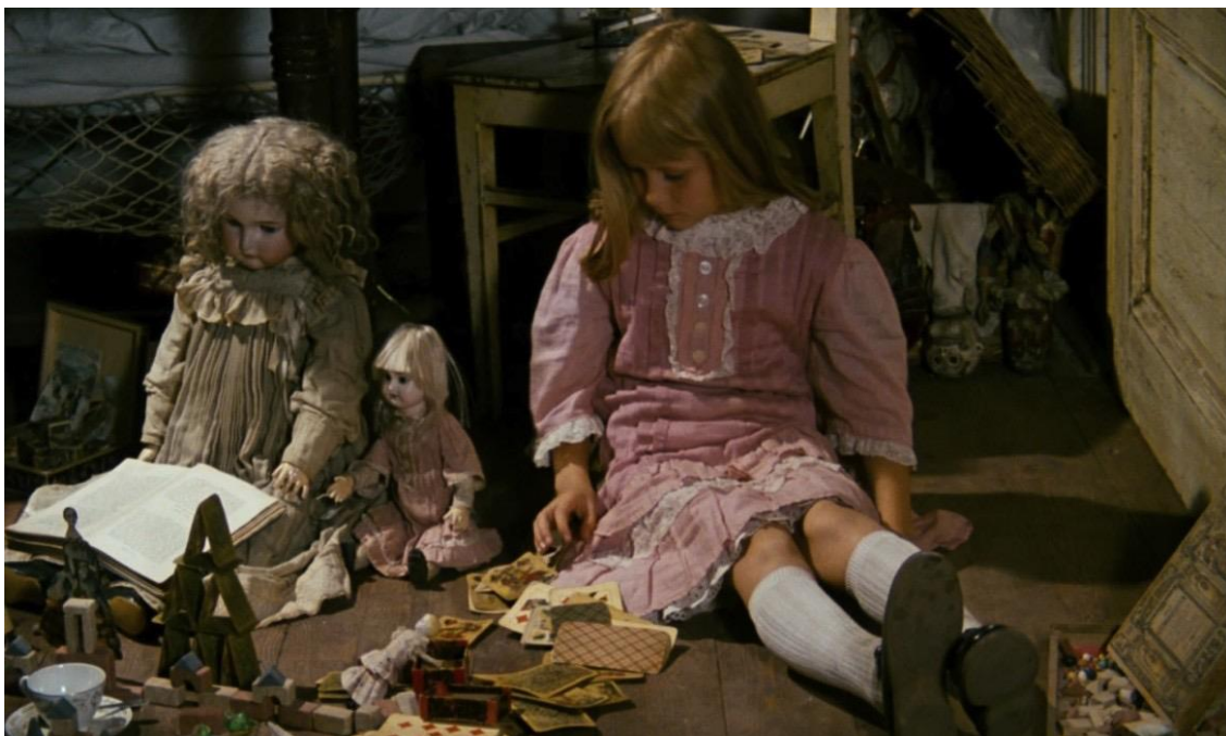
Image 5. Švankmajer, J. (Director). (1988). Something from Alice . [Film]. Krátký film Praha.