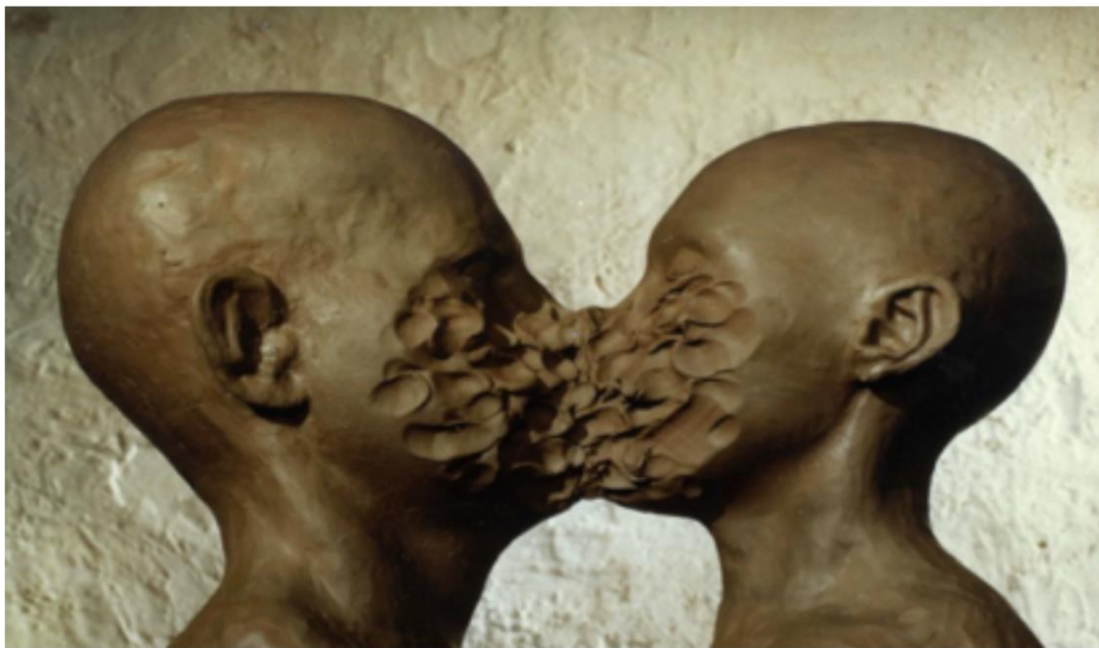
Image 4. Švankmajer, J. (Director). (1989). Darkness, Light, Darkness . [Film]. Krátký film Praha.