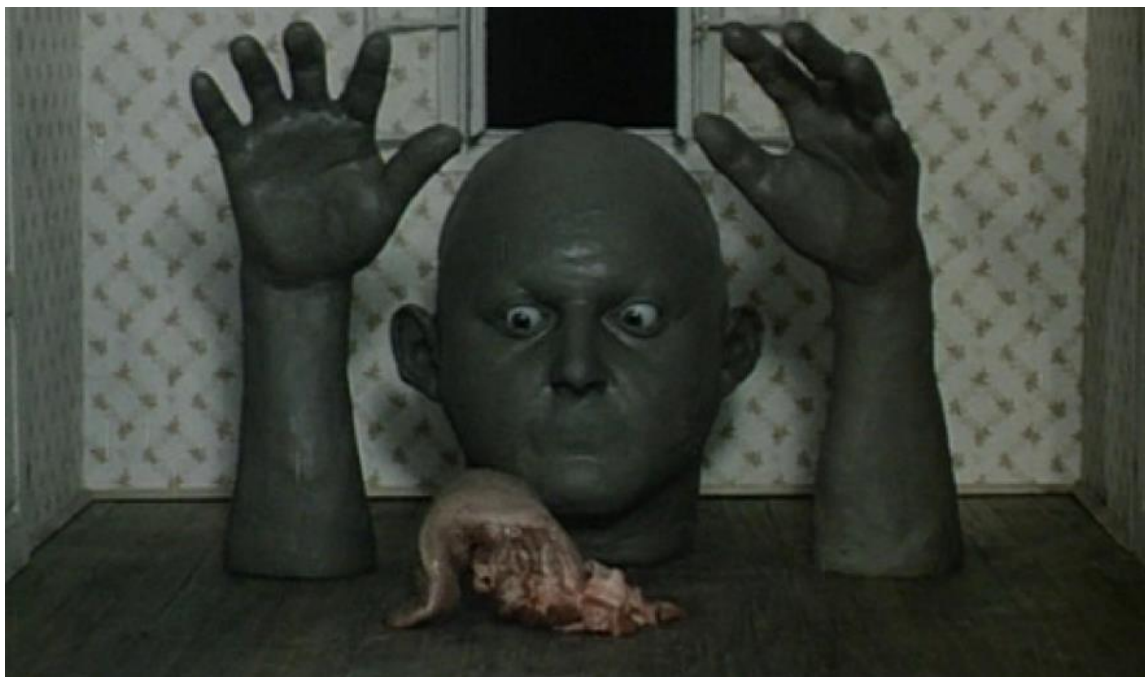
Image 2. Švankmajer, J. (Director). (1983). Dimension of Dialogue . [Film]. Krátký film Praha.

The grotesque puppet in Svankmajer's films is essentially an inanimate object which has been endowed with the ability to embody life. This puppet as a performative object has its own ontological narrative which is not similar to that of a real-life being. To express existence, it has to rely entirely on the energy transferred to its body by the hands of the animator. In accordance with Bakhtin's writings, the puppet's grotesque body lies between the realms of life and death, it is part of both an organic and inorganic world, spiritual and physical, finding itself in a state of never completed metamorphosis. Bones, household objects, old toys, and particularly food come to life in every Svankmajer film creating their own rules when it comes to their deformed anatomy. In Darkness, Light, Darkness (1989) various clay organs, a human denture, a pair of eyes, an animal's brain and limbs gather together into a small room. As other limbs try to join, they attempt to assemble themselves into some frightening and disturbing combinations. Among the clay figures, a real tongue suddenly joins in. The film is about the contrasting textures as much as it is about the unmitigated physicality of putting a cow's tongue in a small theatrical set. The audience understands that is a real tongue being animated on-screen, and there is a feeling of revulsion that comes with it.