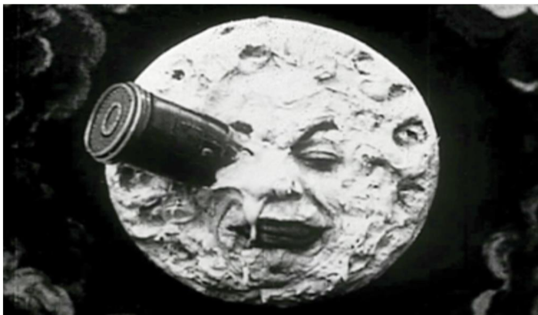
Image 1. Méliés, G. (Director). (1902). A trip to the moon [Film]. Pathe.

Stop motion, as already mentioned, is an animation technique by means of which puppets come to life. One could even argue stop motion animation is a contemporary form of theatrical puppetry, albeit one in which the puppet is liberated from its former constraints and is finally able to move freely through space. However, this freedom is of course merely a visual illusion discovered by accident in 1895 by Alfred Clark. A year later George Méliés used stop motion for the first time to move and give life to inanimate objects, marking 1896 as the birth date of the technique (Gasek, 2012). The manipulation of the cinematographic process transformed reality and granted objects a supernatural dimension. Early examples of grotesque themes are evident in Méliés work, such as A Trip to the Moon (1902). Méliés was one of the first filmmakers to use fusion forms as part of his obscure and surreal narratives.