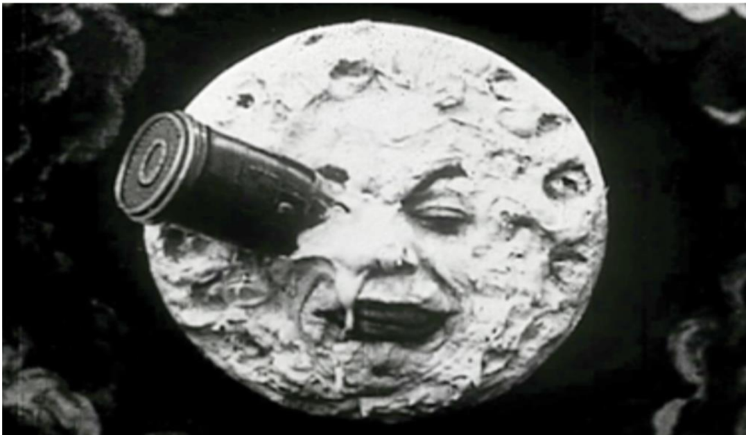
Image 1. Méliés, G. (Director). (1902). A trip to the moon [Film]. Pathe.