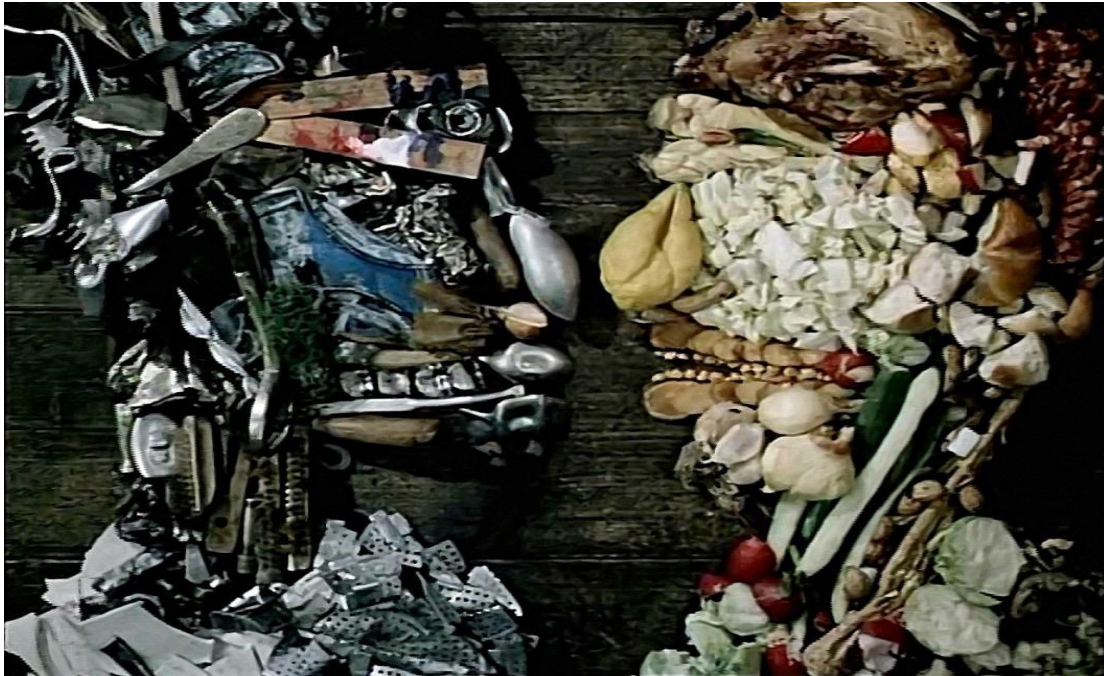
Image 3. Švankmajer, J. (Director). (1989). Darkness, Light, Darkness . [Film]. Krátký film Praha.

One of Svankmajer's greatest short films, Dimensions of Dialogue (1983), emerged out of his fascination with the constellation of fruit and vegetable human figures in Giuseppe Arcimboldo's paintings. In Dimensions of Dialogue , Svankmajer creates his own version of Archimboldo-like puppets which are reshaped through continuous metamorphoses.