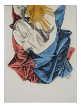
Figure 2. "Ode to the Flag," BenCab Museum, Philippines

During Gandhi's thirty years as the leader of India's freedom struggle, he spent significantly more time educating the practice of nonviolence. He adopted the Buddhist, Hindu, and Jain religious ideal of ahimsa (doing no harm) as a nonviolent weapon for civil protest. He utilized it to oppose control over the region and societal issues like racial prejudice and injustices. Gandhi started massive protests against the colonial administration, coordinated Indian rebellion, and challenged anti-Indian policies in the judiciary. He became a prominent social figure and spread Satyagraha , a concept of nonviolent non-cooperation. Although Aquino was not imprisoned, she successfully led the People Power Revolution, ousting former President Marcos' two-decade dictatorship.