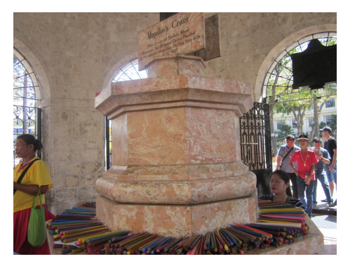
Figure 1. Magellan's Cross, 1521, Cebu

On the other hand, llocanos primarily reside within the llocos Region in the northwestern seaboard of Luzon. They speak Iloko or Iloco language. Ilocos attracts devotional tours for the faithful to basilicas such as St. Nicholas of Tolentino Parish Church, which existed for almost 440 years. On the other hand, llonggos refers to the people living in Iloilo province. Iloilo was also one of the most prominent episcopal during the Spanish colonial period.