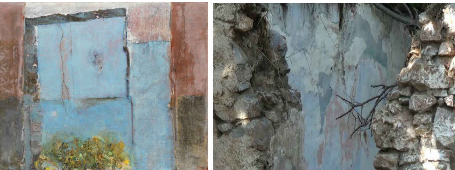
Figure 2: You'll Open the Windows to the Light, 2017, mixed media, 130x150cm

Greece is currently experiencing a phase of great turmoil, a period of severe economic recession, but which is also deeply social and political. A period that has added a new dimension to the way we see ourselves and redefine our identity, individual or national. And this is expressed in the work of several artists. Her artworks captures the modern Greek re-