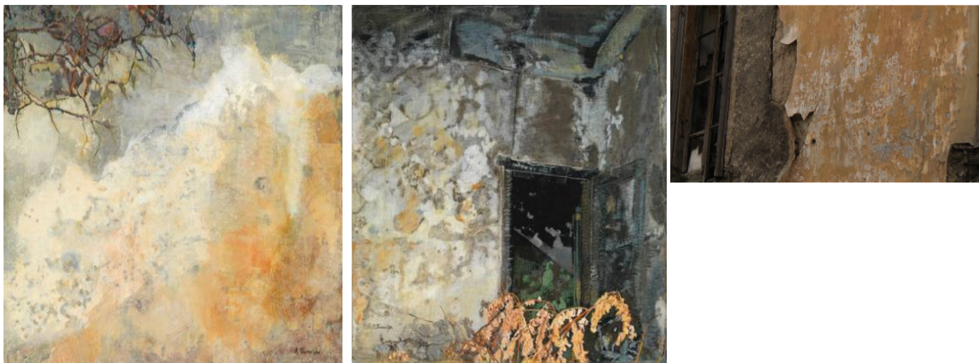
Figure 6, 7: Off the wall II, 2014, mixed media, 80x80cm, Recall II, 2014, mixed media, 80x70cm

hind the walls of a courtyard, half-hidden behind the branches of a lush acacia. These two-story mansions, built mostly during the 1920's, are surrounded by a walled garden, having an iron gate facing the street, now sealed with thick chains. These beautifully crafted gates, crowned with ivy, with their neoclassical spirals and romantic rosettes once filled all of Athens in hundreds of variations, are perhaps the most emblematic element of the houses of that period. The viewer can find one of these gates in the painting 'There You'll Find Them' , 2016 with the homonymous poem of Manolis Anagnostakis.