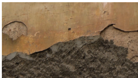
Figure 1: Get Out, 2013, mixed media, 157x53cm.