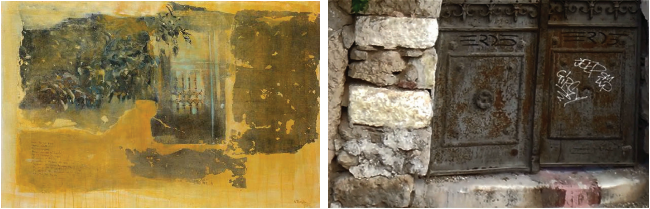
Figure 3: There You'll Find Them, 2016, mixed media, 150x100cm

dynamic elements of building – in the effects of weathering, decay and renewal, of extension and re-use (Leatherbarrow & Mostafavi 1993). Sometimes the relation to memory may be direct – this particular angle of a wall, this juxtaposition of doorway and window, this fall of light, may immediately evoke a memory of our own. Sometimes the relation to memory may be via certain archetypal forms or schemas that are typically felt and recognized through generalized modes of bodily engagement and responsiveness.