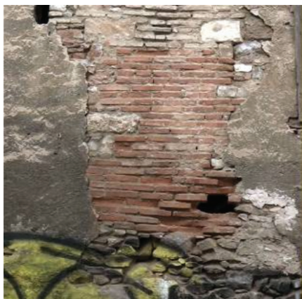
Figure 6: Imago, 2012, mixed media, 153x57cm