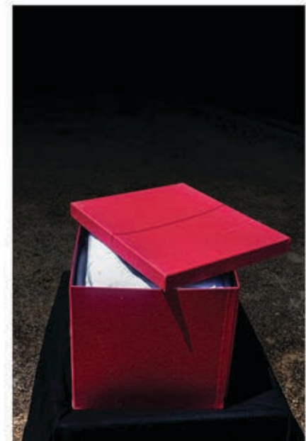
Figure 3: Vasso Florou (2019) -The box marked 27 November 2018 (24 hours).