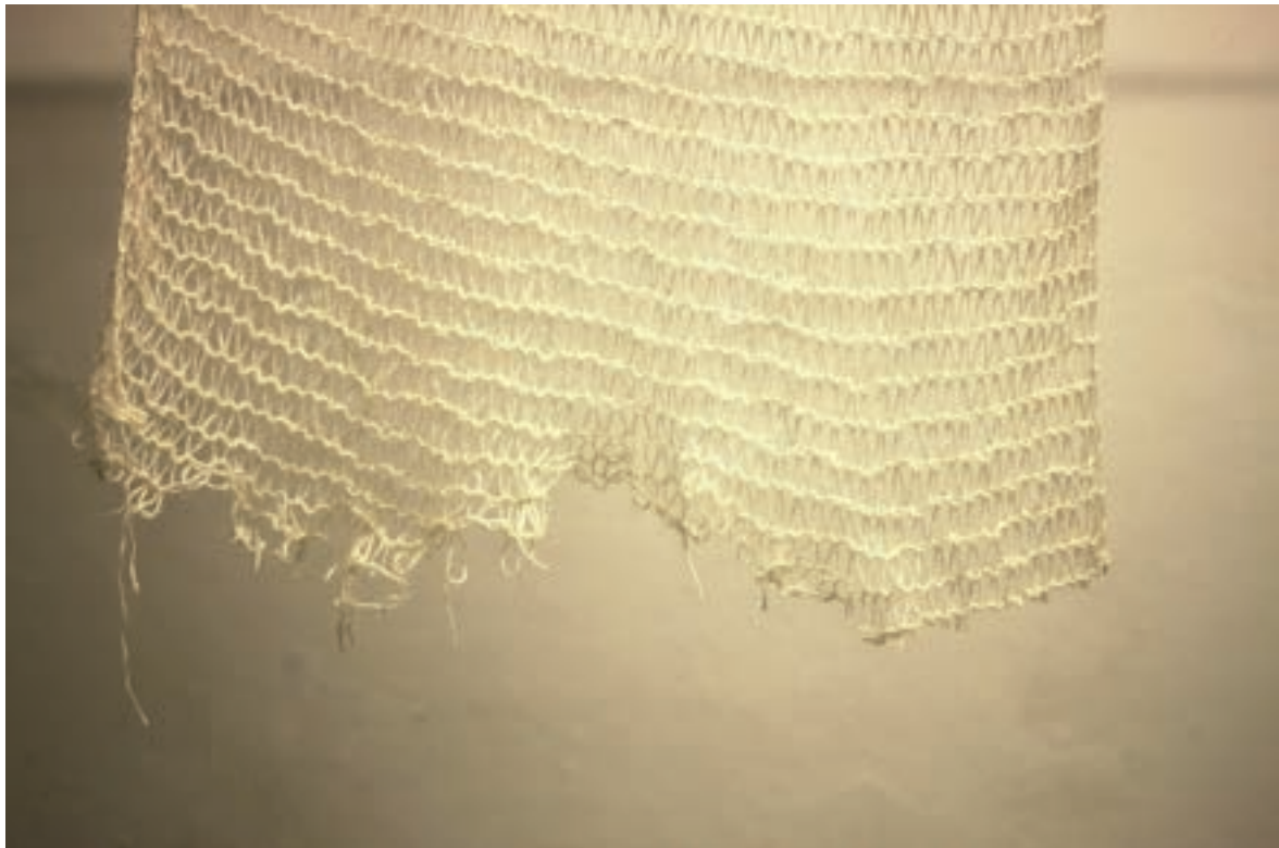
Figure 5: Ifigeneia Iliia-Georgiadou (2020). Installation “ Damnatio memoriae .”

temporary condemnation of memory is essentially suspended and thus, the conversion of some event into a work of art does not follow the primordial route of event-knowledge-language-art, but the reverse with the insight of the artist. In this way, the work is composed as an autonomous, ephemeral event and from it, spring language and knowledge and re-define the initial event.