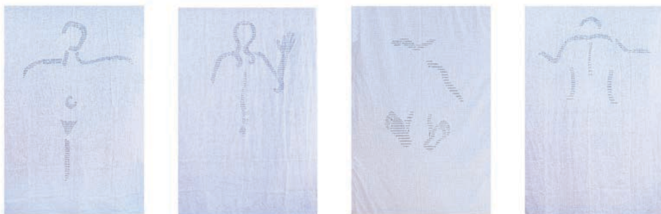
Figure 2: Tetraptych by Vasso Florou (2019). Selected “Curtains”.

where in contemporary patriarchal society, the archetype man-subject-gaze and woman-object-image to be consumed is the predominant condition. The preservation of relationships of power and dominance is recognised as the essential goal of the “hegemonic” 24 group in forming social relations and this constitutes the main model developed as a narrative in all aspects of public dialogue. We could say it is a narrative palimpsest developed in differing historical, political and social conditions, founded on relations of gendered characteristics. Reference is called for here to the views of Foucault (1982/1989) 25 in regard to the biological normality and transformation of the sexual subject of western societies, where he describes the history of subju-