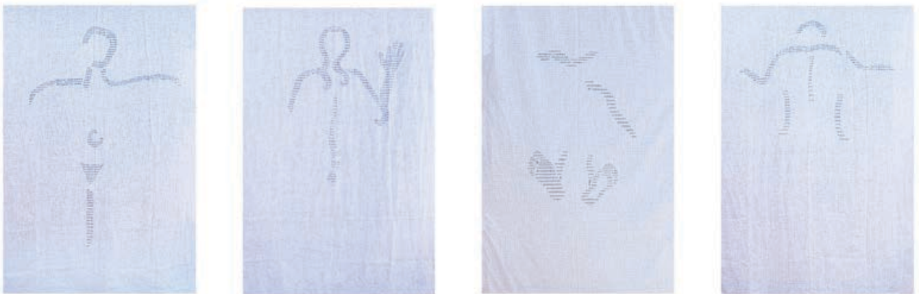
Figure 2: Tetraptych by Vasso Florou (2019). Selected “Curtains”.

where in contemporary patriarchal society, the archetype man-subject-gaze and woman-object-image to be consumed is the predominant condition. The preservation of relationships of power and dominance is recognised as the essential goal of the “hegemonic” 24 group in forming social relations and this constitutes the main model developed as a narrative in all aspects of public dialogue. We could say it is a narrative palimpsest developed in differing historical, political and social conditions, founded on relations of gendered characteristics. Reference is called for here to the views of Foucault (1982/1989) 25 in regard to the biological normality and transformation of the sexual subject of western societies, where he describes the history of subj-