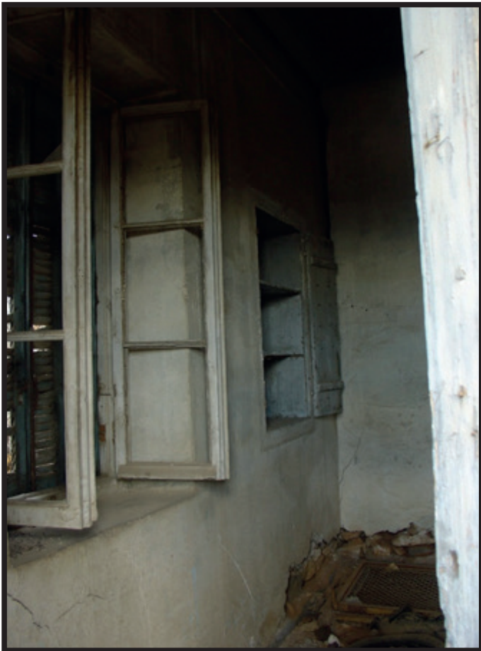
Figure 12: Interior of the building, Photo: M. Delazanou (2020)