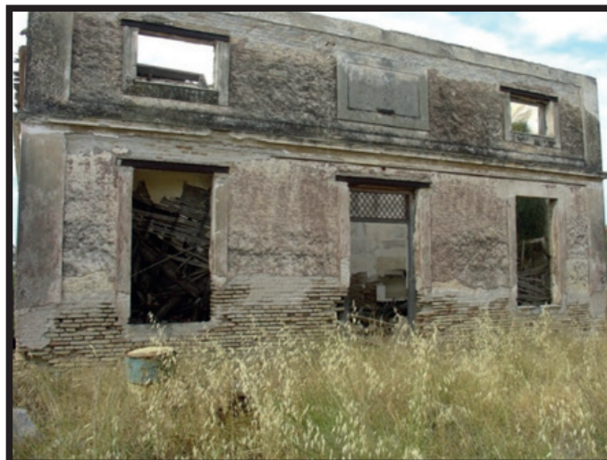
Figure 15: Building 7

The refugees are hosted in Building 7 (see Figure 15). Taking advantage of the rich photographic archive, which has been digitized by the Hellenic Literary