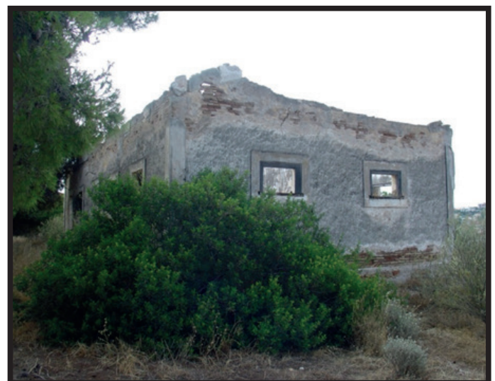
Figure 14: Building 6, as seen from road D2 Photo: M. Delazanou (2020)

Infectious Diseases Hospital is represented by Building 6 (see Figure 14). The haunted bark of the building represents a "crime" scene, a landscape of pain, hor-