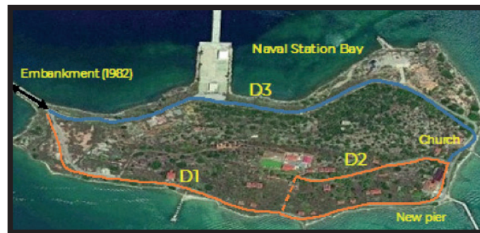
Figure 3 : Cultural Route Map with digitally edited route tracing (see D1, D2, D3).

The entrance of the group of participants in the cultural route is done from the main gate of the Naval Station, where the necessary identification check takes place. Arrival on the islet by road is made through the landfill. In Figure 3, the roads D1 and D2 that are marked with orange