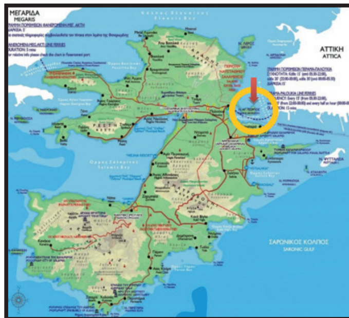
Figure 1: Map of the ancient location of Salamis, based on Government Gazette 305/1982. The islet of Agios Georgios is indicated by the red arrow inside the circle.

The islet of Agios Georgios consists of an area of 1,498 square meters [9]. It has been included in the archaeological map of Salamis, with the contribution of Melina Mercouri, under the Government Gazette B' 302/1982, with the reason "because in this place the famous naval battle took place, which is the most important event in ancient Greek History" (Belavilas & Predou, 2018 : 23 ; Operational Program of the Municipality of Salamis 2011-2014, 2011 : 55). As Antonis Virvilis informs us, the initial operation of the islet as a quarantine station is not recorded in the official map of the (12) public stations in Greece, based on a Royal Decree of