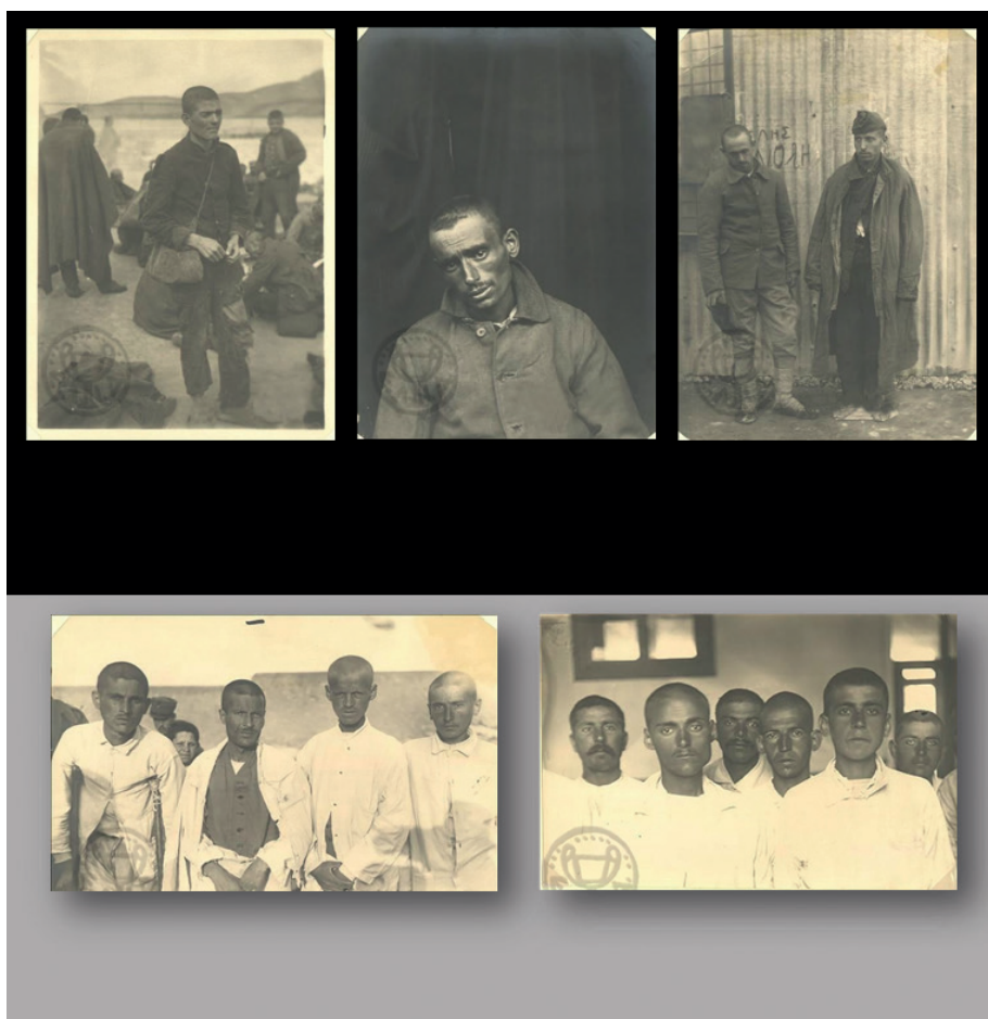
Table 3 Prisoner Exchange – freed soldiers at the Sanatorium of Agios Georgios. [37]