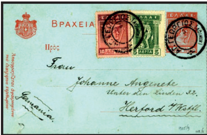
Figure 10: Letter with stamp details of the Post Office which was a V-type two-wheeler with the inscription inside: "ΑΓ. Γεώργιος (ΛΟΙΜΟΚ)"

the Paris Health Conference (1885) which acquitted correspondence of the disease carrier and abolished its disinfection" [25] (as cited in Iliadi, 2015:35).