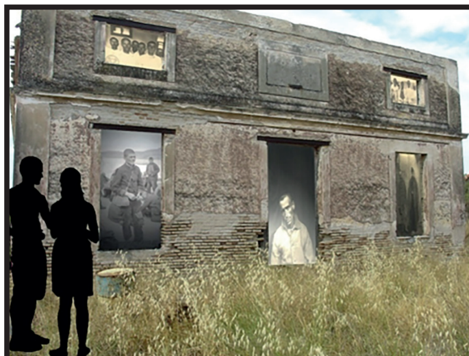
Figure 16: Facade configuration proposal for Building 7 (digital printing in photoshop software)

(E.L.I.A.), [28] the following artistic intervention in the structure of the building is proposed (see Table 3). To achieve the visual narration, digital prints in kappamouti are attached to the openings of the façade, by processing selected photos of the refugees of that time in the disinfection centre. The tour is accompanied by a digital audio archive in which the letters and written memoirs of Panagiotis Stampoulis and Nikolaos Lorentis are dramatized. The aim is to pay tribute to the people who were expelled from their homeland only to come and suffer new tasks of isolation and uprooting in Greece. The Archive photos capture dark faces, as well as bony bodies with tattered clothes (see Figure 16).