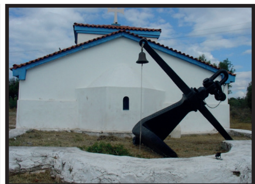
Figure 17: The inscription in the shed of the church of Agios Georgios. Photo: M. Delazanou (2020) Figure 18: Shed of the church of Agios Georgios. Photo: M. Delazanou (2020) Figure 19: View of the church of Agios Georgios. Photo: M. Delazano