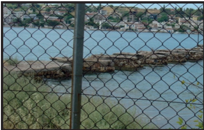
Figure 7: View of the pier from the coastal road D1 of the islet.

"Surveillance Cleansing" is chosen to be performed at the old pier. The route starts from the remains of the old pier, from the point where the passengers of the downstream ships disembarked. The pier is not accessible and can be seen through the fencing of the coastal road, overlooking the settlement of Kamatero in the background Figure 7. Here the visitor can gaze at the bay of Paloukia, which is the sea boulevard that connects Salamis to Piraeus, with intense mobility of small and large ships.