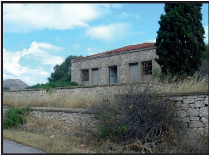
Figure 8: View of the building from the coastal road.

The period that the post office was abolished is yet unknown, but in 1931 it no longer exists. For the disinfection of these letters "they were taken with tongs, which had been previously immersed in vinegar, placed in a certain place and they were smoked on burning straws for a quarter of an hour" (Pandi-Agathokli, 2011: 23). According to Virvilis, "Greece stopped disinfecting correspondence in 1893, ten years after the discovery of Robert Koch [23] and eight years after