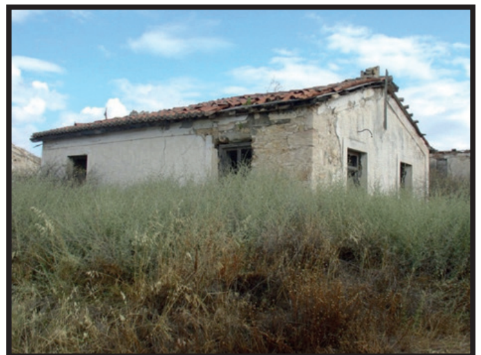
Figure 9: Building 3, as seen from the coastal road D1.

was Videise. After their departure (October 12, 1944), its facilities were looted. Building 1, is the reception area, a place where visitors can obtain a map with the proposed route, photographic material and publications related to the history of the islet. The visitors, in order to experience the journey on the islet, should pay a symbolic fee of three Euros, which corresponds to the "laxative rights"[22]. Their "enclosure" will be sealed by wearing a yellow silicone bracelet, such as the flag of quarantine, on which the logo and the name of the destination will be printed, as well as the date of the visit. Finally, each visitor or pair of visitors will have a tablet with all the digital information, which will be returned at the end of