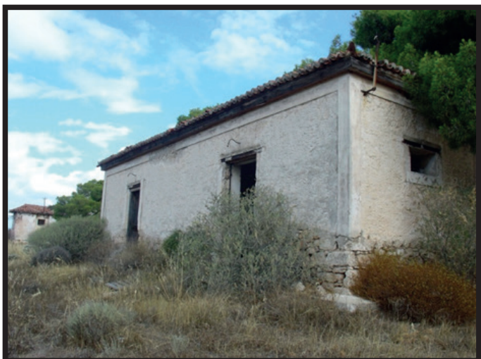
Figure 13: Building 4, the house of the Unknown X.

a mirror, wooden oil-painted table, water bottle after three glasses.