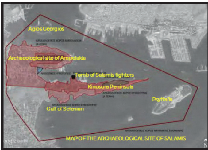
Figure 2: Map of the ancient location of Salamis, based on Government Gazette 305/1982.

November 25th, 1845. Table 1 (see the Appendix) records the short history of the islet of Agios Georgios.