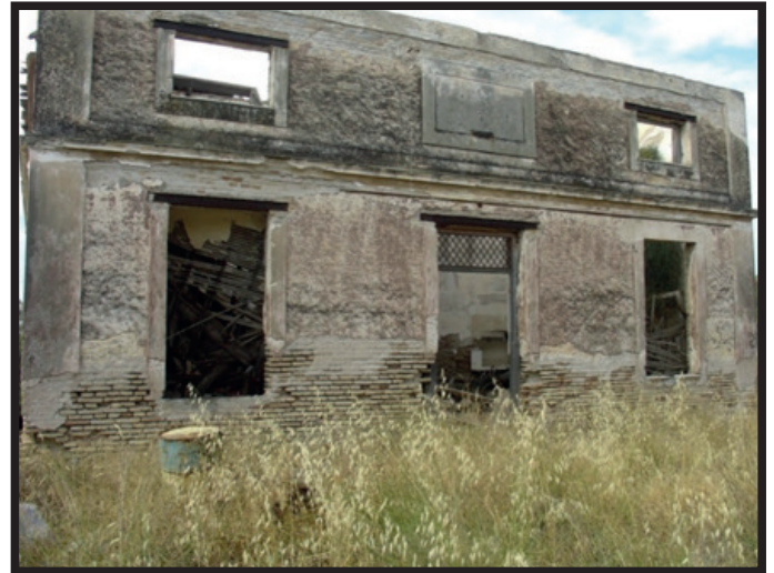
Figure 15: Building 7

The refugees are hosted in Building 7 (see Figure 15). Taking advantage of the rich photographic archive, which has been digitized by the Hellenic Literary