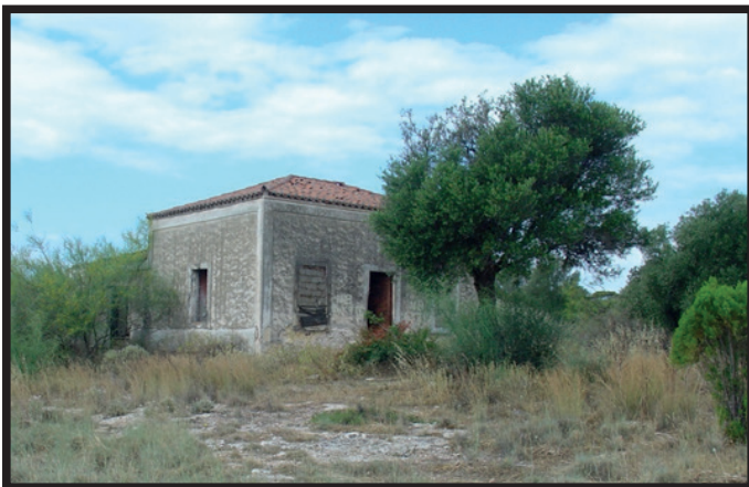
Figure Figure 20: View of Building 9 from the church of Agios Georgios.

The building that simulates the grocery store is Building 9, which is in pretty good condition. The visitor can buy local products and taste the traditional platetsi (oil pie), the kougougoulouari (pumpkin pie),