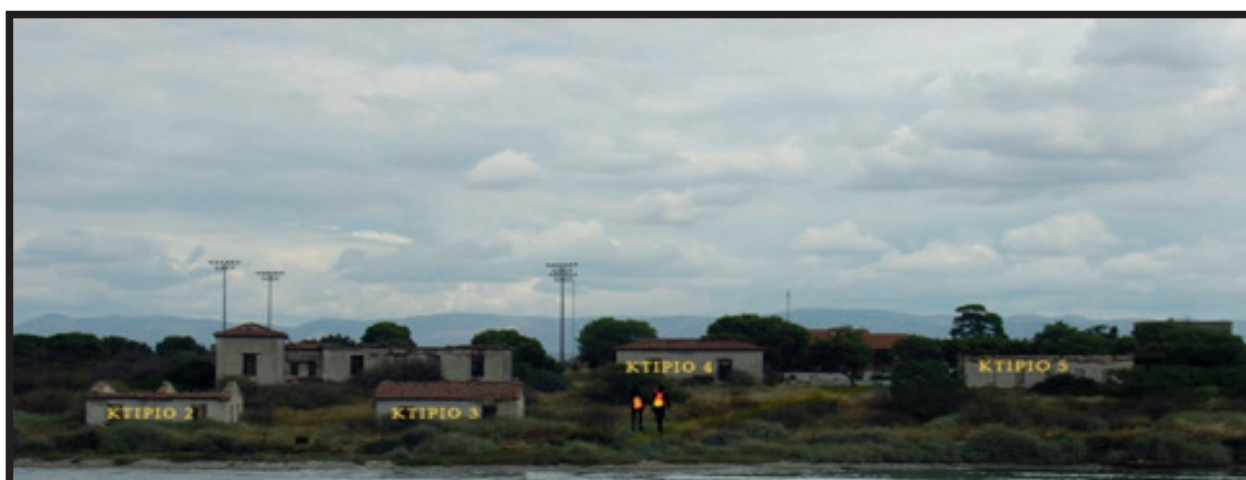
Figure 5: View of the coastal road D1, with the marking of buildings 2-5, which are the respective stops.

are asphalted, thus creating the appropriate accessibility conditions for people with disabilities. Road D1 is coastal, overlooking the bay of Paloukia, the settlements of Kamatero and Perama. Along the coastal road there is a fence for security reasons of the Naval Station. Road D2 is inland with unparalleled natural beauty. The dashed line is an uphill path (altitude difference about 3 meters above sea level), a total distance of 80 meters. Road D3, marked with blue color, is prohibi-