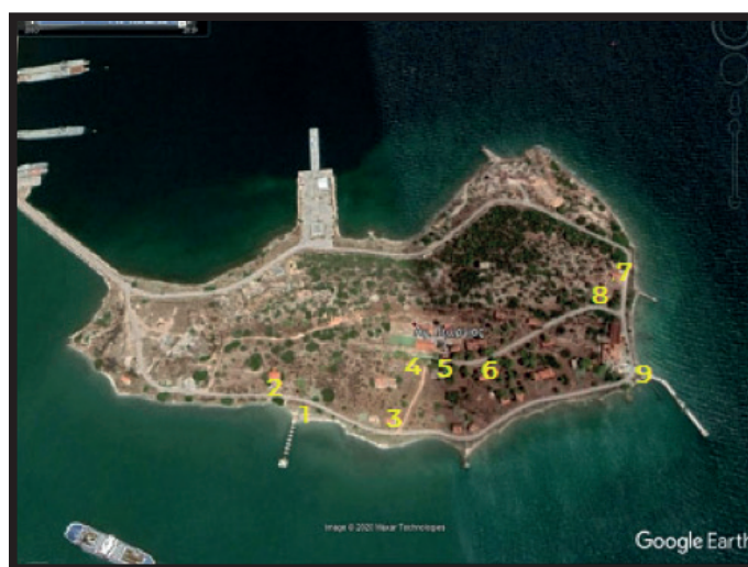
Figure 4: Satellite image of the islet of Agios Georgios (Salamis) with digitally edited thematic route stations. (Downloaded from Google Earth on July 8th, 2019)

are asphalted, thus creating the appropriate accessibility conditions for people with disabilities. Road D1 is coastal, overlooking the bay of Paloukia, the settlements of Kamatero and Perama. Along the coastal road there is a fence for security reasons of the Naval Station. Road D2 is inland with unparalleled natural beauty. The dashed line is an uphill path (altitude difference about 3 meters above sea level), a total distance of 80 meters. Road D3, marked with blue color, is prohibi-