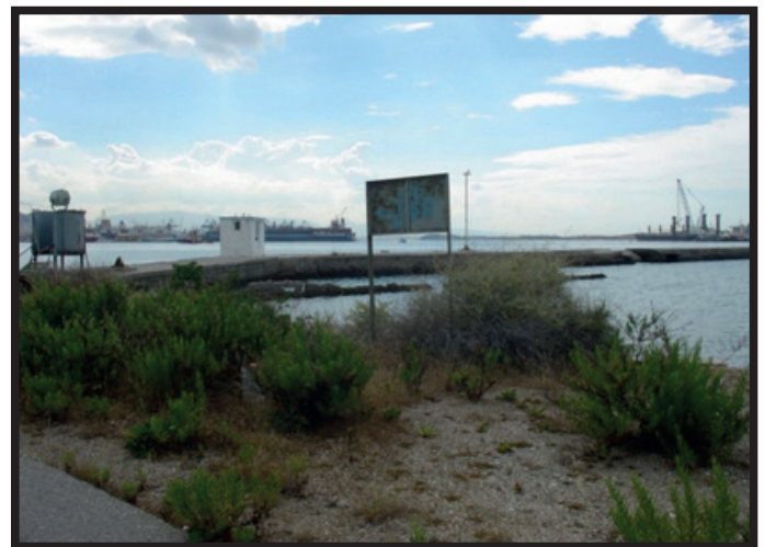
Figure 21: The new pier from the road D1. Photo: M. Delazanou (2020)

The route started from the old pier and was chosen to end up at the new pier with the newly built outpost. The