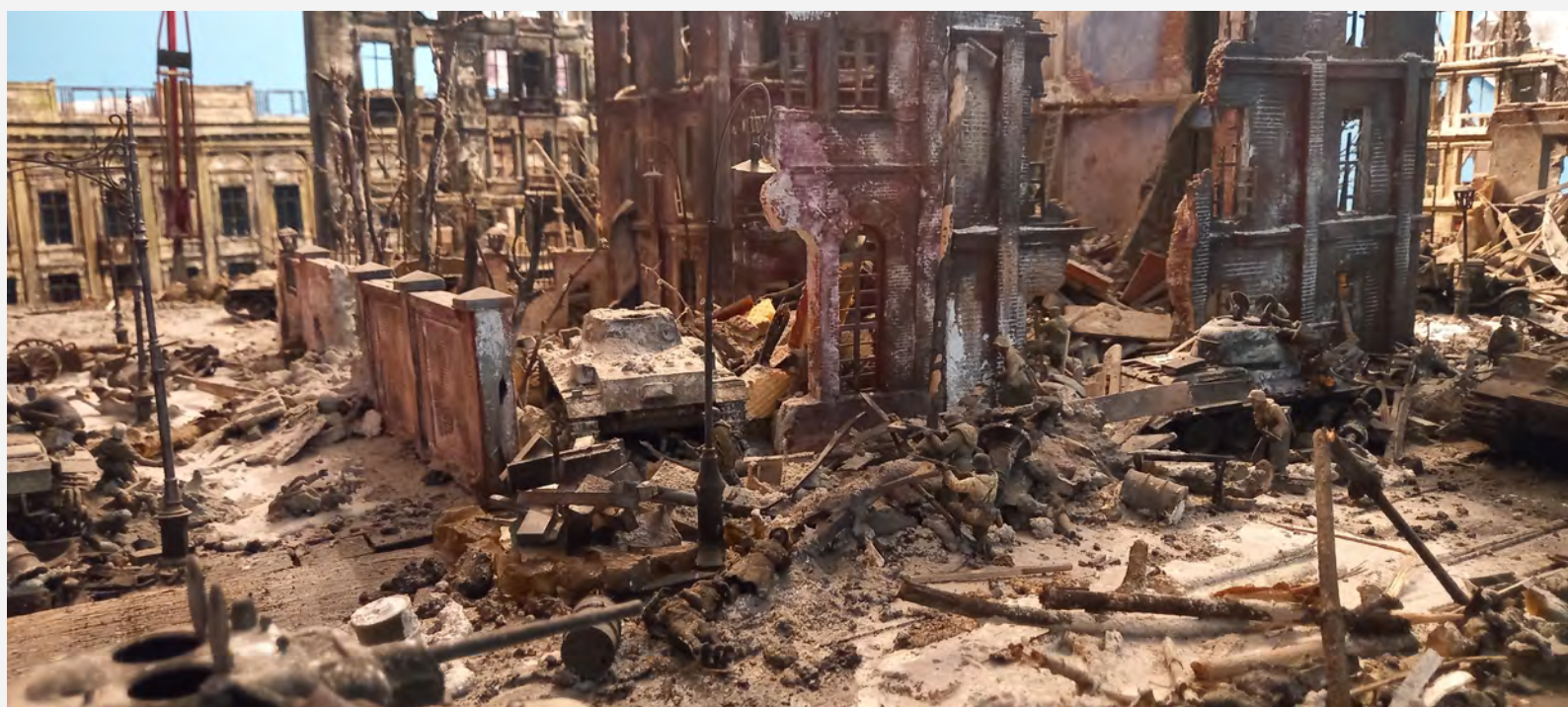
Figure 11. Photographing the miniatures, scale 1/35.