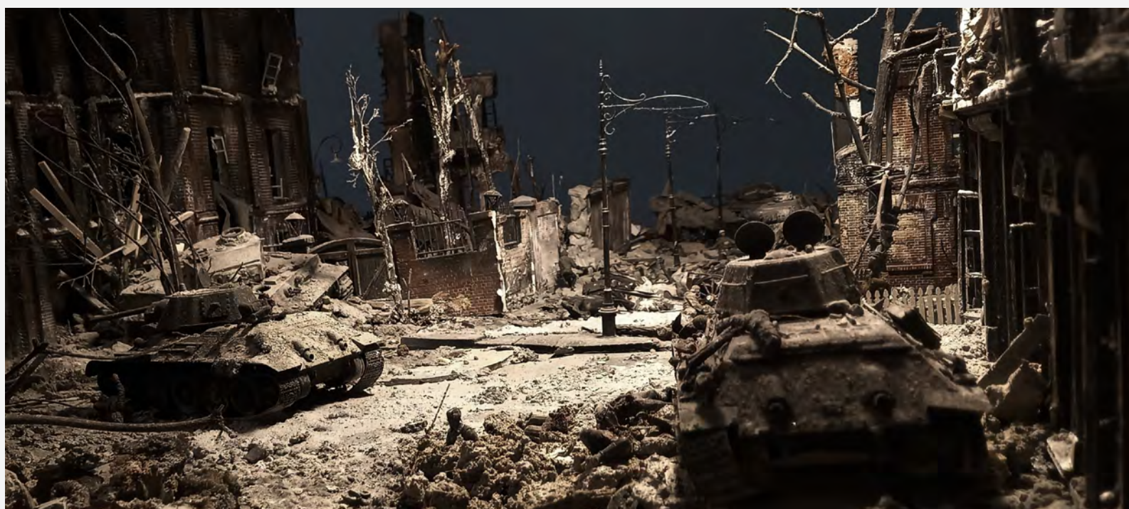
Figure 9. Photographing miniatures using an artificial light. Miniature scale 1/35.