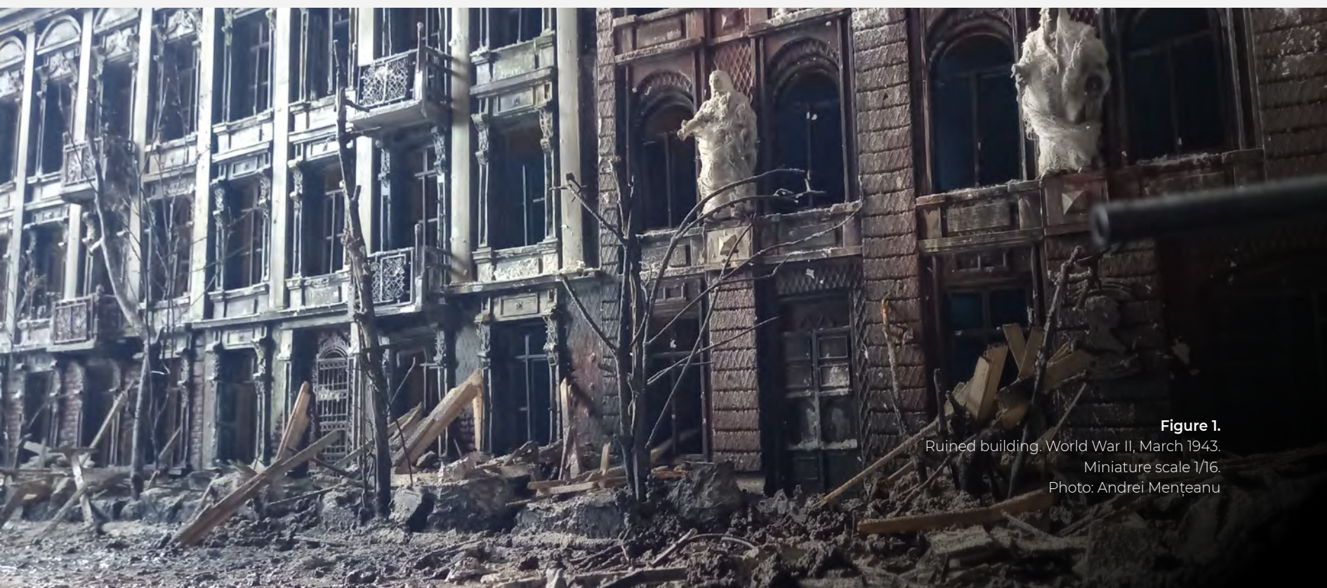
Figure 1. Ruined building. World War II, March 1943. Miniature scale 1/16.

A miniature, appreciable in size, in which the scenes turn out to be drawn from the reality of the past, constitutes an extremely effective method of actualizing a tragic episode of history. And since miniatures can transform reality into art, they are, simultaneously, artistic compositions.