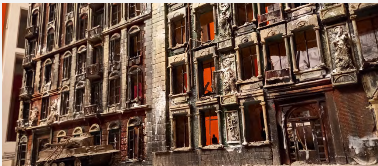
Figure 6. A tank taken out of service. World War II, March 1943. Miniature scale 1/35.