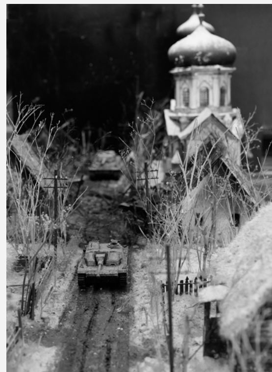
Figure 4. World War II, March 1943. Different types of materials can be seen in the ruined village. Scale 1/35.