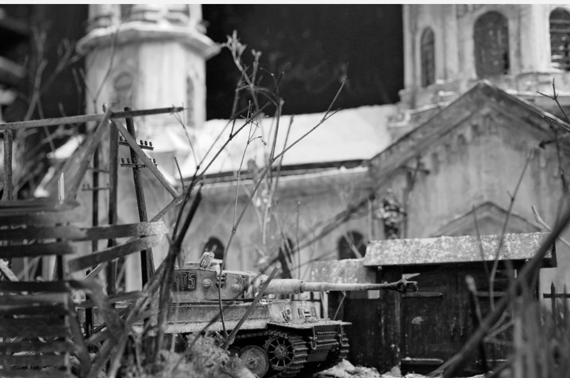
Figure 3. Ruined church and village. World War II, March 1943. The model is made of several types of building materials. Scale 1/35.

There are, no doubt, many museums, and memorials of the two world wars in which images are presented yearly, to develop the mental process of individual or collective memory. However, the impression and reproduction of human sensations and feelings in the face of three-dimensional history made with the construction of miniatures, are considerably enhanced.