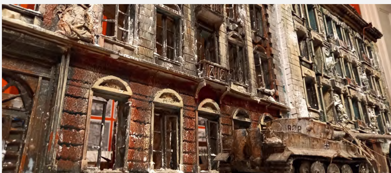
Figure 5. A tank taken out of service in front of a complex building. World War II, March 1943. Miniature scale 1/35.