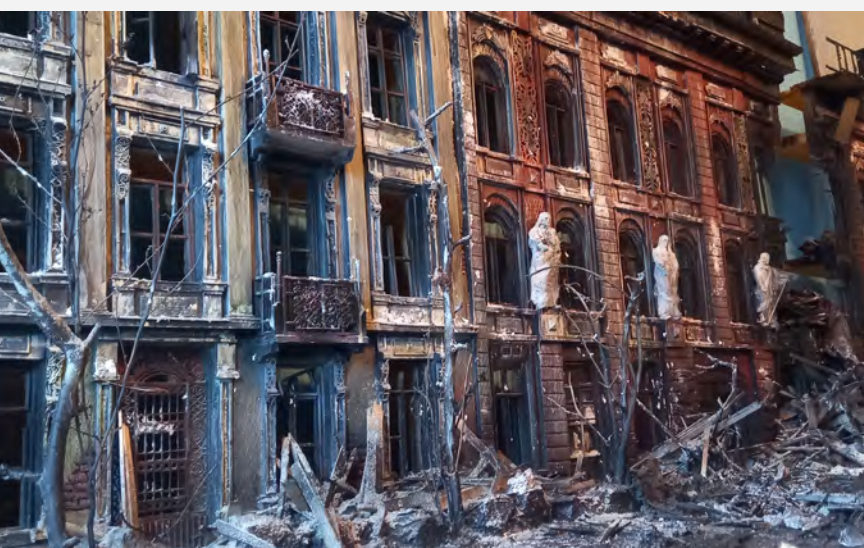
Figure 7. Ruined building. World War II, March 1943. Miniature scale 1/16.