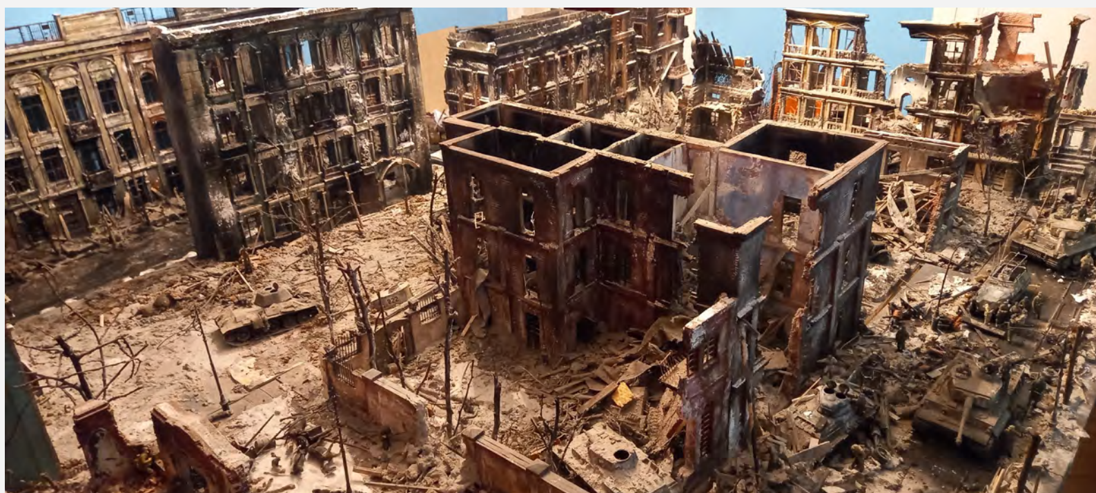
Figure 10. Photographing miniatures using natural daylight. Scale 1/35.