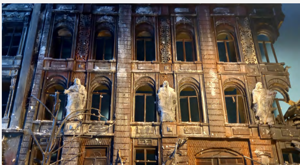
Figure 8. Ruined building, details. World War II, March 1943. Miniature to scale 1/16.