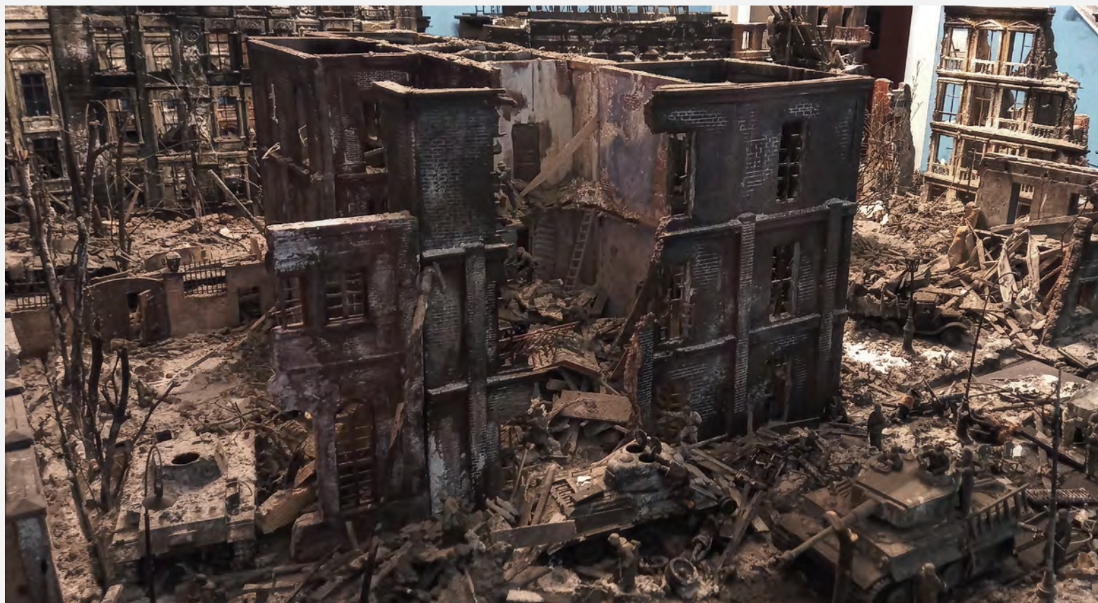
Figure 2. Ruined buildings. World War II, March 1943. Miniature scale 1/35.

The architecture of the urban landscape where the bloody battles took place was accurately respected for every street and building. The magic of the scale models is filtered through artistic compositions and cinematic frames, and the audience is invited into the small film set of history, where the miniatures can transport them in time and space through magical effects. An important catalyst, something that can trigger reactions in those around us that are in line with those of the model artist, is the concept of the miniature trompe l'oeil , a perspective effect that can be realised as a special effect in a cinema or museum space.