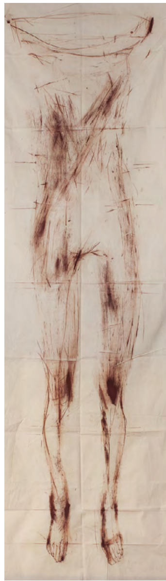
Figure 6. Adriana Lucaciu, 2021 Embodiments No. 34 mixed technique on canvas, 280 x 90 cm