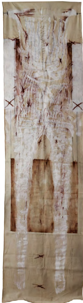
Figure 5. Adriana Lucaciu, 2012 Embodiments No. 06 mixed technique on canvas, 280 x 90 cm

In order to transform into a process of signification, the image – what is visible – loses its material substance, so that between corporeality and sublimation an ‘alchemical’ connection is established. (Figures 05, 06, 07, 08)