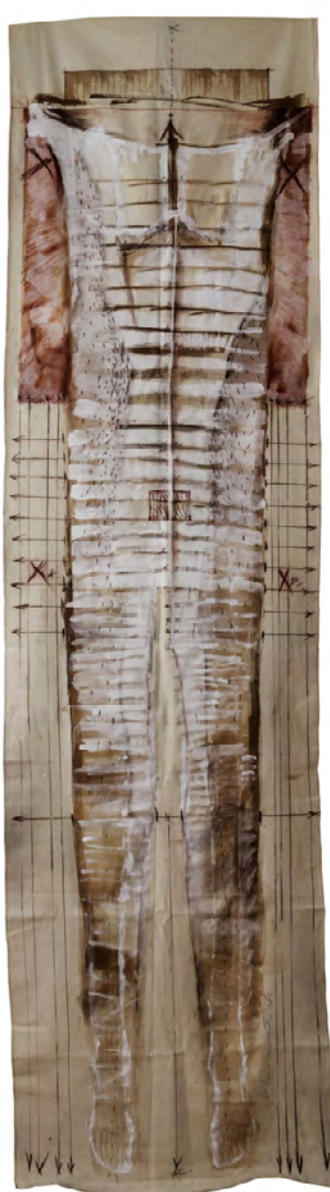
Figure 7. Adriana Lucaciu, 2012 Embodiments No. 04 mixed technique on canvas, 280 x 90 cm