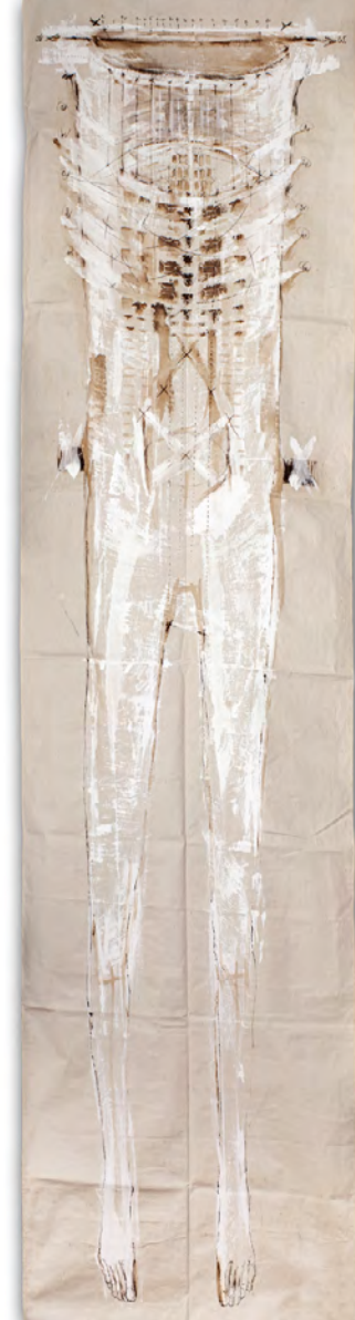
Figure 8. Adriana Lucaciu, 2021 Embodiments No. 19 mixed technique on canvas, 280 x 90 cm

Corporeality reflects the forms of art as an interface between me-artist and reality, and reveals both the material support of the objectifications of the inner substrate (the physical product) and the figural content of personal creations (the human figure/ the body as a topographical plastic element).