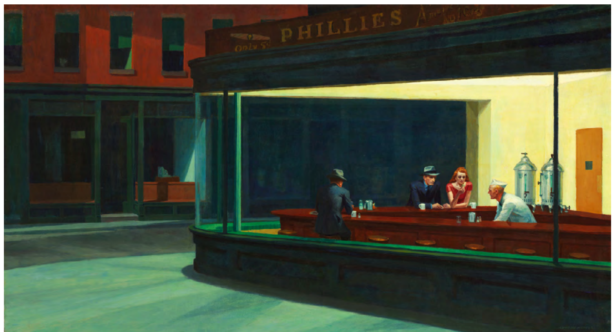
Figure 7. Edward Hopper Nighthawks , 1942, oil on canvas

Doig in these works has an unexpected conversation with the idiosyncratic realist painter, Edward Hopper. The resignation of human existence, like a Robinson Crusoe forgotten in a canoe in the middle of nowhere, or like a drinker left in a bar in the Midwest in the Nighthawks [Figure 7], expressed by a horizontal line intersecting a vertical and surrounding flat colours forming strange reflections in an eerie light, forms the spiritual universes of both Doig and Hopper, and their bona fide landscapes of sublime solitude, that stay in memory just as much as it is needed to change the viewer's worldview. Lonely figures are the par-excellence exponents of a dystopia, which experiences everyday life on the fringes of lost dreams, through one-act visual stories. Those stories form a palimpsest of silent moments overflowing with unutterable emotion, through a visual gaze that circulates unbroken across the canvas and with equal comfort between the adventurous avenues of Romanticism, Realism, Symbolism.