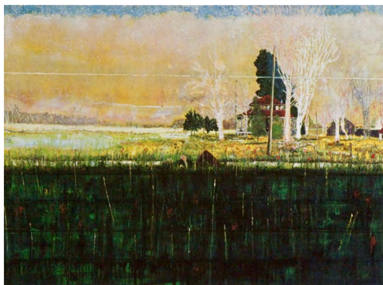
Figure 12. Peter Doig Daytime Astronomy , 1999, oil on canvas

The skilful use of figurativeness in the foreground houses in Iron Hill coexists with extended abstract areas, often featuring a panspermia of splatters and intentional flecks of colour that recalls Jackson Pollock's flat disturbing surfaces, joining the background with the foreground, as in the Architect's Home in the Ravine , 1991, [Figure 11].