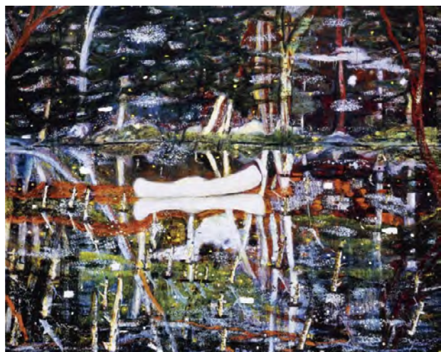
Figure 2. Peter Doig Canoe Lake , 1997, oil on canvas