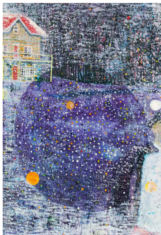
Figure 8. Peter Doig Charley's Space , 1990, oil on canvas

the hidden image within the circle, awakening the voyeuristic mood of the viewer who attempts to plunge his gaze into the forbidden area of a possible, grand secret. With the project Concrete Cabin , 1991, [Figure 9] Doig pays homage to the father of modernism in architecture Le Corbusier (Charles-Édouard Jeanneret 1887-1965), and his demystifying view that buildings are mere machines that serve as shelters, with emphasis on their building materials, glass, steel, cement. In Concrete Cabin , he draws inspiration from his vision of Unité d'Habitation , a modernist apartment building in Marseille in 1945.