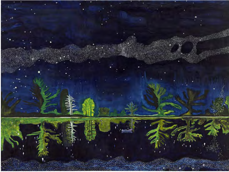
Figure 5. Peter Doig, Milky Way , 1989-90, oil on canvas

References to Arnold Böcklin's Die Toteninsel-The Island of the Dead , 1881-86, are evident, as is the influence of Van Gogh's Starry Night , 1889, [Figure 6] on Doig's existentially galactic Milky Way , 1989-90 [Figure 5].