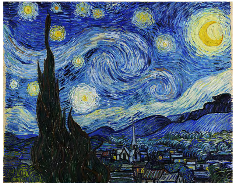
Figure 6. Vincent Van Gogh, Starry Night , 1889, oil on canvas

Doig in these works has an unexpected conversation with the idiosyncratic realist painter, Edward Hopper. The resignation of human existence, like a Robinson Crusoe forgotten in a canoe in the middle of nowhere, or like a drinker left in a bar in the Midwest in the Nighthawks [Figure 7], expressed by a horizontal line intersecting a vertical and surrounding flat colours forming strange reflections in an eerie light, forms the spiritual universes of both Doig and Hopper, and their bona fide landscapes of sublime solitude, that stay in memory just as much as it is needed to change the viewer's worldview. Lonely figures are the par-excellence exponents of a dystopia, which experiences everyday life on the fringes of lost dreams, through one-act visual stories. Those stories form a palimpsest of silent moments overflowing with unutterable emotion, through a visual gaze that circulates unbroken across the canvas and with equal comfort between the adventurous avenues of Romanticism, Realism, Symbolism.