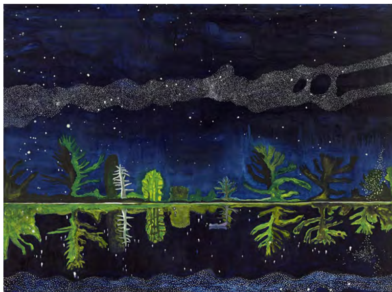
Figure 5. Peter Doig, Milky Way , 1989-90, oil on canvas

References to Arnold Böcklin's Die Toteninsel-The Island of the Dead , 1881-86, are evident, as is the influence of Van Gogh's Starry Night , 1889, [Figure 6] on Doig's existentially galactic Milky Way , 1989-90 [Figure 5].