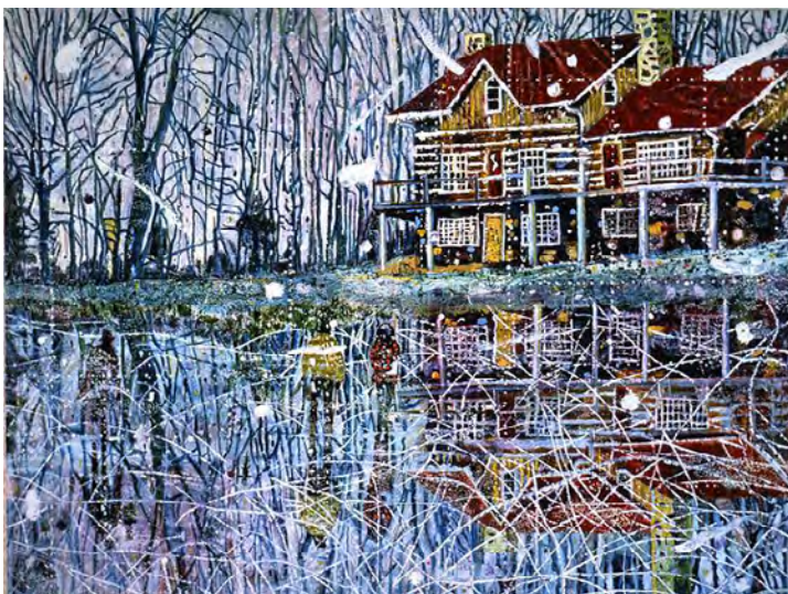
Figure 1. Peter Doig, Pond Life , 1993, oil on canvas

High and everyday culture, abstraction and realism, the need of constantly seeking a refuge, or the question of what it means to belong somewhere, are issues to analyze, with wilderness or willful exile standing seemingly opposite to each other or meddling within. Although he himself considers painting to be nothing more than a specific placement of colours, it is the color of human absence that is the deepest and most penetrating of all in his painting.