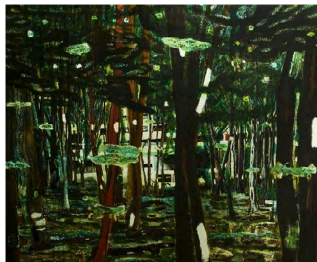
Figure 9. Peter Doig Concrete Cabin , 1991, oil on canvas