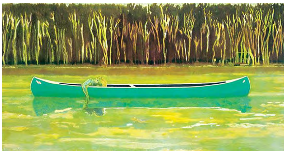
Figure 3. Peter Doig, Ghost Canoe , 1991, oil on canvas