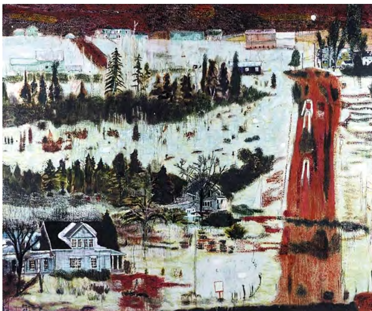
Figure 10. Peter Doig Iron Hill , 1991, oil on canvas

In Concrete Cabin , although at a first reading the concrete volume of the building contrasts with the rich nature around, the glow of the building illuminates the very landscape that its visible entity depends on.