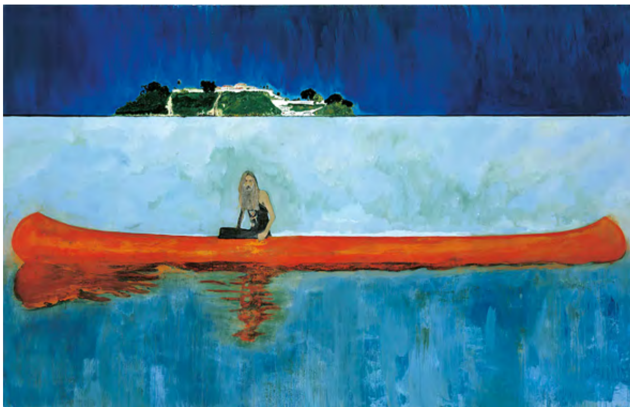
Figure 4. Peter Doig 100 Years Ago , 2000, oil on canvas

The canoe-lake themed works Ghost Canoe , 1991, Canoe-lake , 1997-98, and 100 Years Ago , 2000-01, [Figures 2.3.4.] summarize the above ideas as typical examples of his work. The use of individual elements such as the bushes behind the lake suggests the voyeuristic observation of a scene that contains the element of privacy and exclusivity, as if we are peeking into someone else's dreams, staying there and being hypnotized by them. The horizontal, Rothkoesque format in most of the paintings seems to have been cut from a reel of film, a haunting stop-frame from a menacing series of ominous narratives that still carry the terror of loneliness in the original dream.