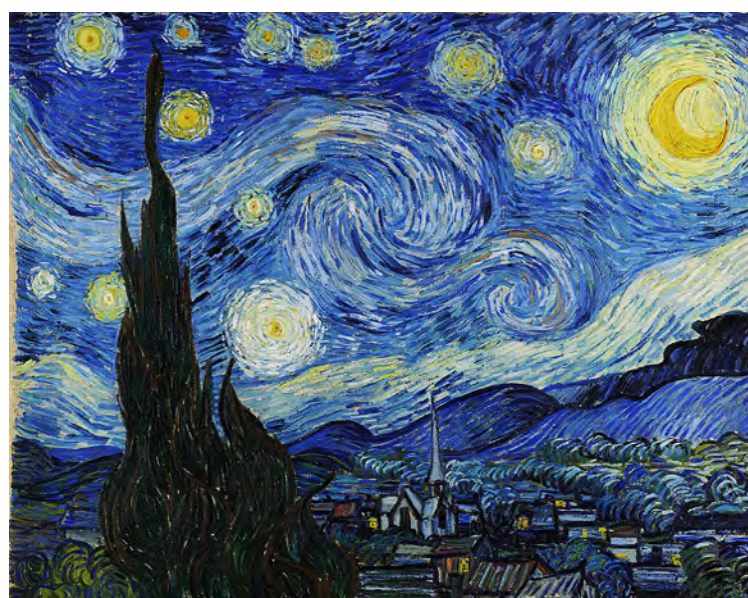
Figure 6. Vincent Van Gogh, Starry Night , 1889, oil on canvas

Doig in these works has an unexpected conversation with the idiosyncratic realist painter, Edward Hopper. The resignation of human existence, like a Robinson Crusoe forgotten in a canoe in the middle of nowhere, or like a drinker left in a bar in the Midwest in the Nighthawks [Figure 7], expressed by a horizontal line intersecting a vertical and surrounding flat colours forming strange reflections in an eerie light, forms the spiritual universes of both Doig and Hopper, and their bona fide landscapes of sublime solitude, that stay in memory just as much as it is needed to change the viewer's worldview. Lonely figures are the par-excellence exponents of a dystopia, which experiences everyday life on the fringes of lost dreams, through one-act visual stories. Those stories form a palimpsest of silent moments overflowing with unutterable emotion, through a visual gaze that circulates unbroken across the canvas and with equal comfort between the adventurous avenues of Romanticism, Realism, Symbolism.