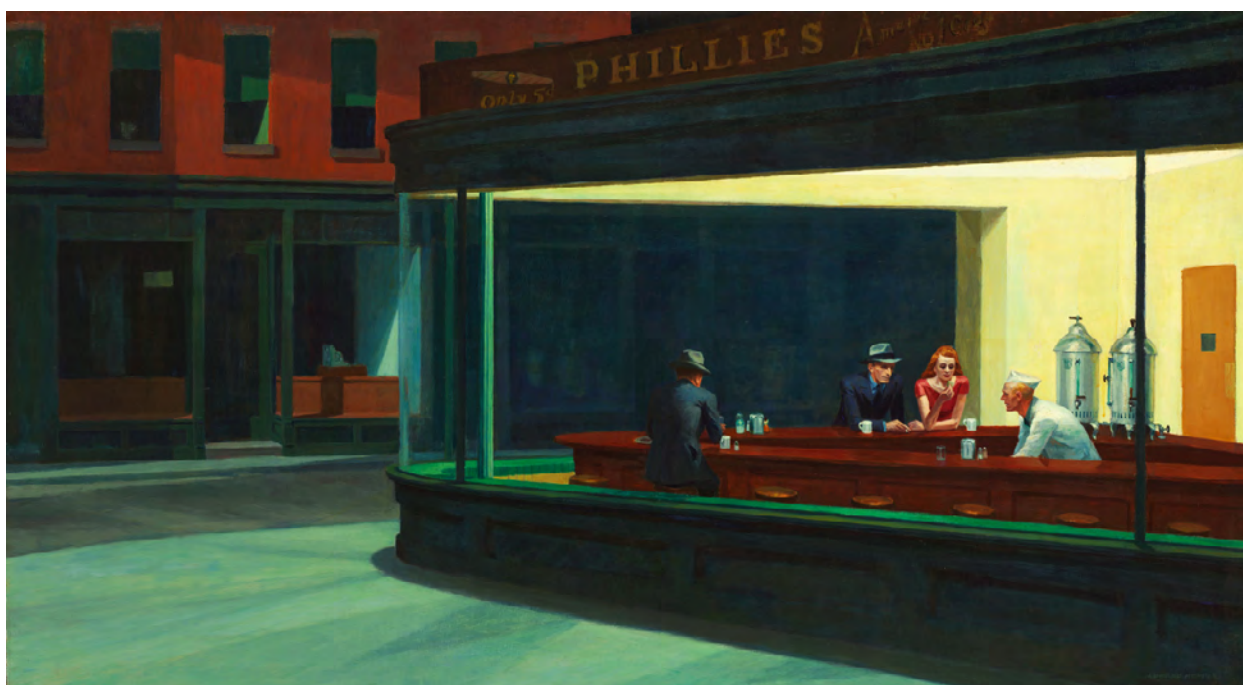
Figure 7. Edward Hopper Nighthawks , 1942, oil on canvas

Doig in these works has an unexpected conversation with the idiosyncratic realist painter, Edward Hopper. The resignation of human existence, like a Robinson Crusoe forgotten in a canoe in the middle of nowhere, or like a drinker left in a bar in the Midwest in the Nighthawks [Figure 7], expressed by a horizontal line intersecting a vertical and surrounding flat colours forming strange reflections in an eerie light, forms the spiritual universes of both Doig and Hopper, and their bona fide landscapes of sublime solitude, that stay in memory just as much as it is needed to change the viewer's worldview. Lonely figures are the par-excellence exponents of a dystopia, which experiences everyday life on the fringes of lost dreams, through one-act visual stories. Those stories form a palimpsest of silent moments overflowing with unutterable emotion, through a visual gaze that circulates unbroken across the canvas and with equal comfort between the adventurous avenues of Romanticism, Realism, Symbolism.