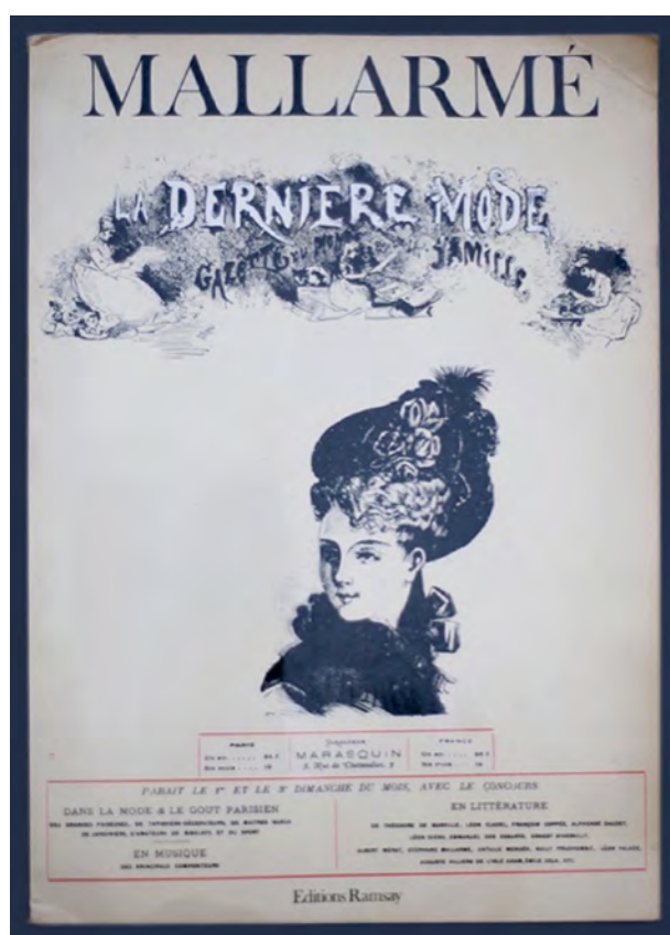
Figure 1. Cover of the magazine La Dernière Mode , 1874

“[Photography] is made for the present age, in which the desire for art resides in a small minority, but the craving, or rather necessity for cheap, prompt, and torrent facts in the public at large. Photography is the purveyor of such knowledge to the world. She is the sworn witness of everything presented to her view... What are her studies...but facts...facts which are neither the province of art nor of description, but of that new form of communication between man and man – neither letter, message, nor picture – which now happily fills up the space between them?” (Eastlake, 1857, p. 93)