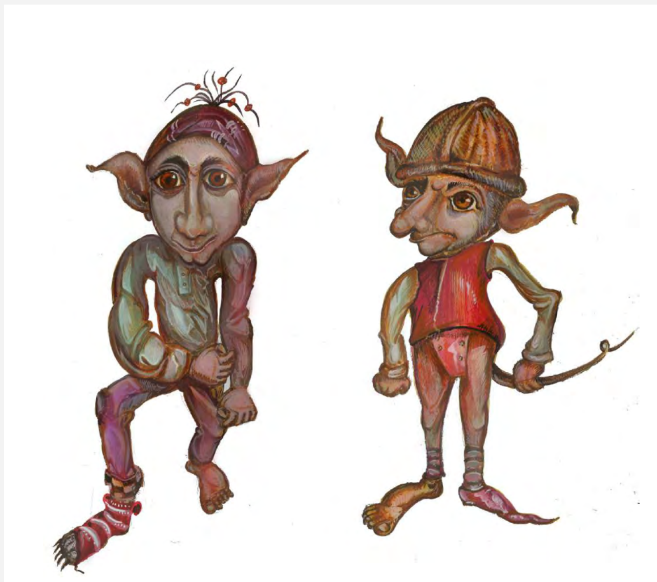
Figure 4. 'Goblins' Egg tempera painting © 2022 Prodromos Manou