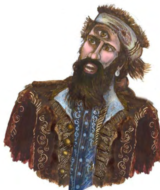
Figure 3. 'Three-eyed pirate' – Egg tempera painting © 2022 Prodromos Manou