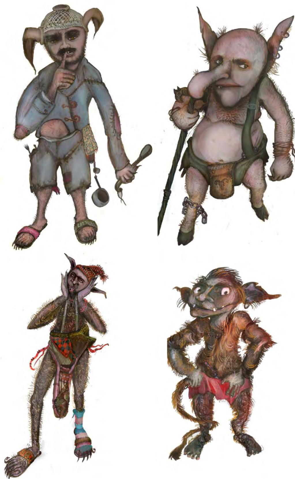
Figure 7. 'Goblins' (up, left) Peridromos, (up, right) Mandrakoukos, (down, left) Malaperdas, (down, right) Paganos' Egg tempera painting © 2022 Prodromos Manou