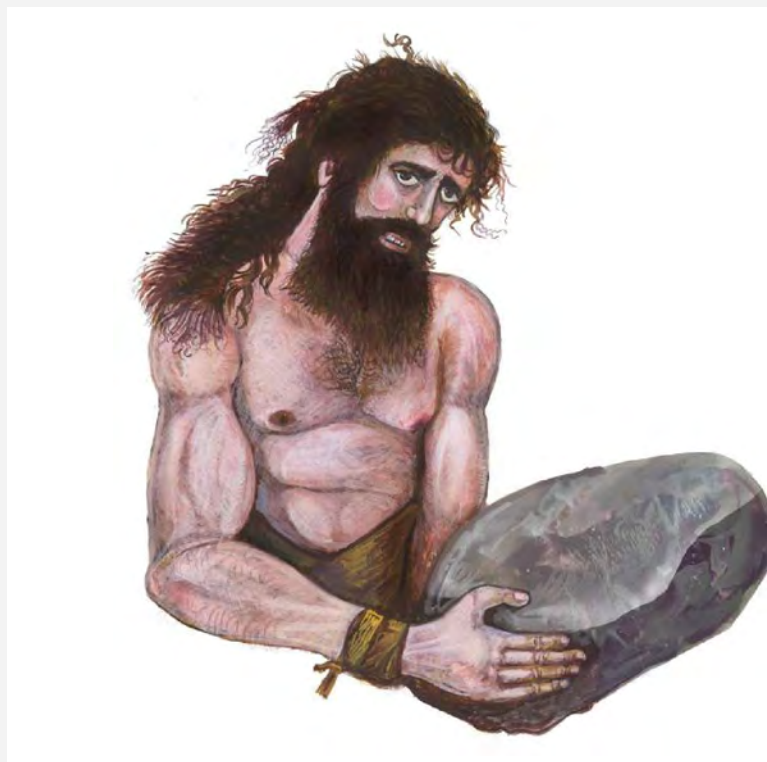
Figure 2. 'Greek Giant' – Egg tempera painting © 2022 Prodromos Manou