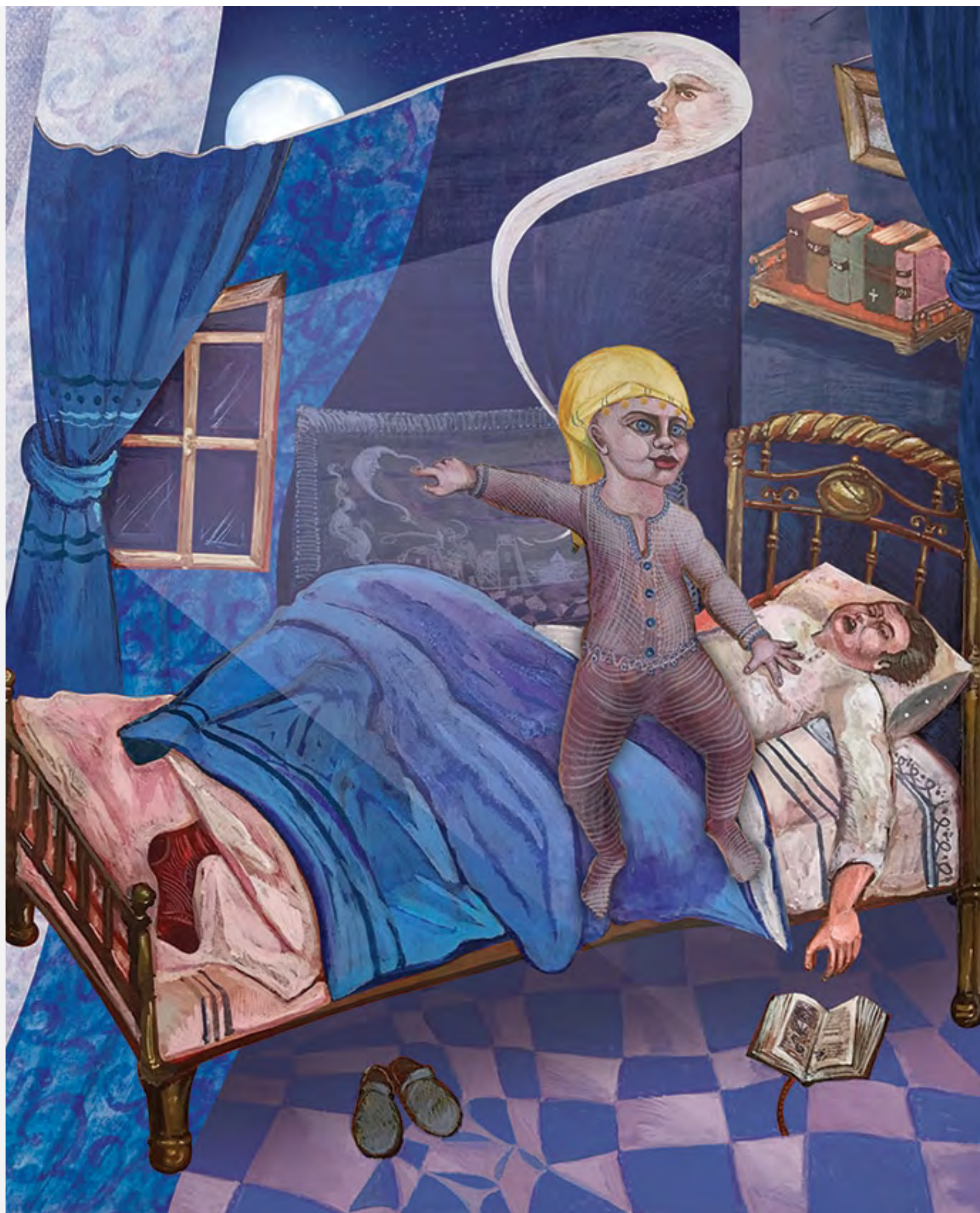
Figure 1. 'Vrahnas' Egg tempera painting and digital processing © 2022 Prodromos Manou