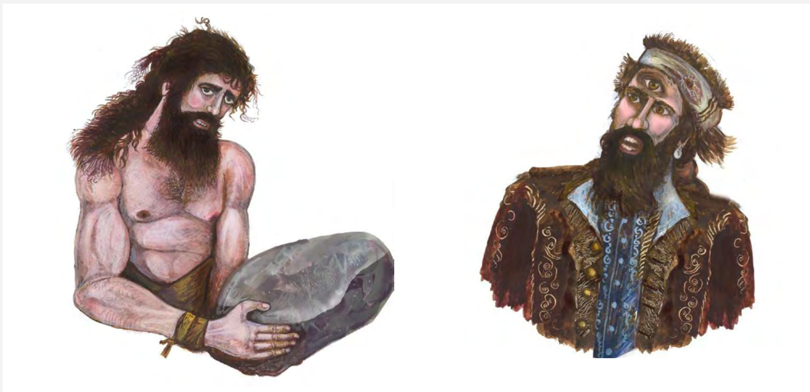
Figure 2. 'Greek Giant' – Egg tempera painting © 2022 Prodromos Manou