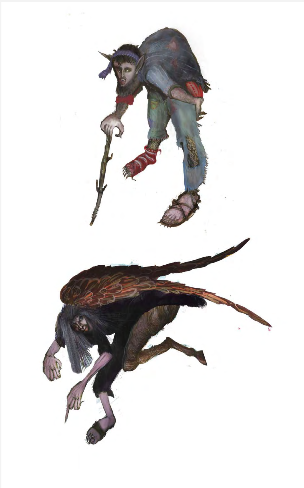
Figure 6. 'Witch with wings' Egg tempera painting © 2022 Prodromos Manou