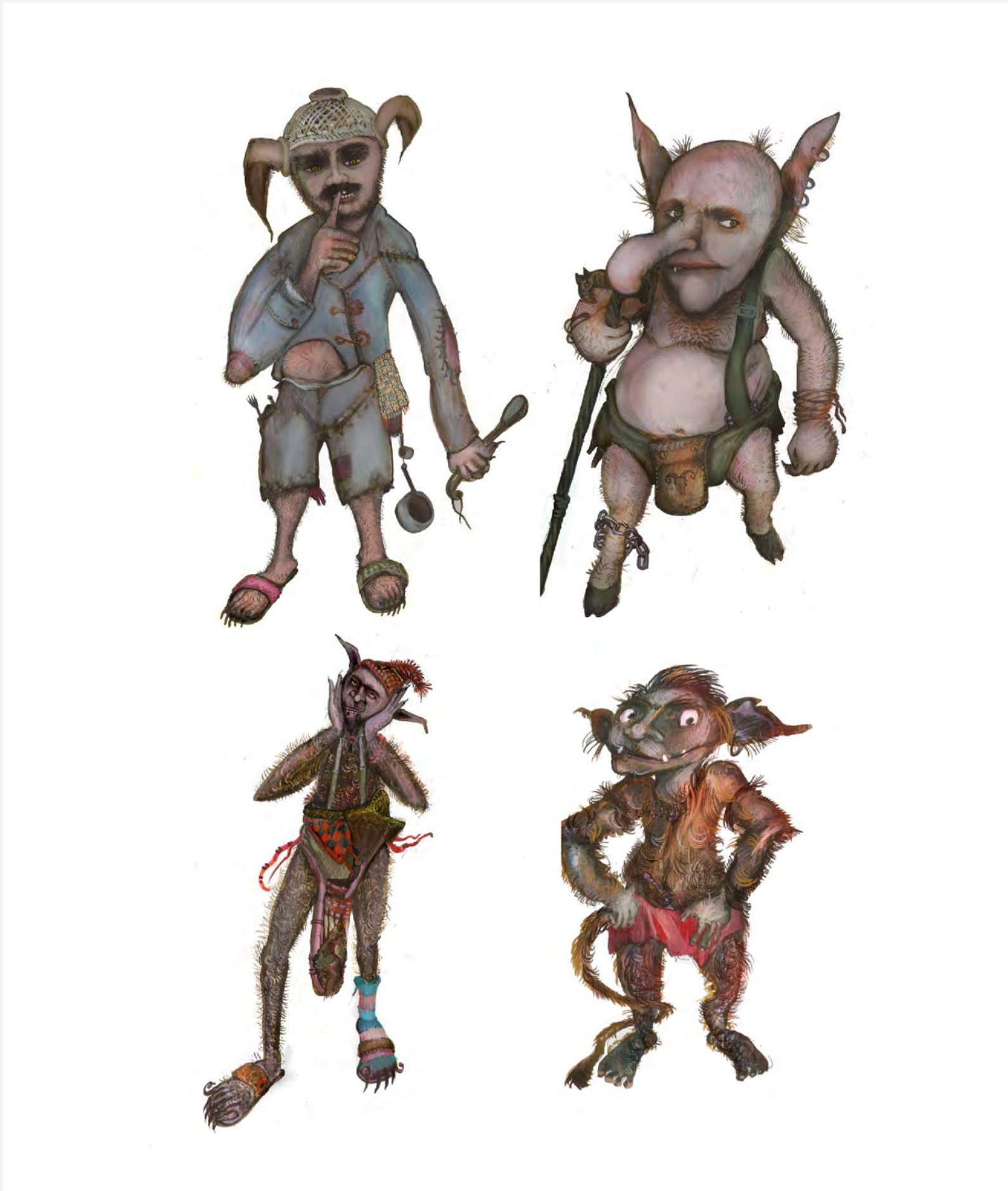
Figure 7. 'Goblins' (up, left) Peridromos, (up, right) Mandrakoukos, (down, left) Malaperdas, (down, right) Paganos' Egg tempera painting © 2022 Prodromos Manou