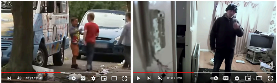
Figure 3: Benefit Street , Channel 4, S01, E04 (left) Still from the official Season 2 trailer (right), (Screenshots).

perience” he has stated elsewhere (Fullerton, 2016).