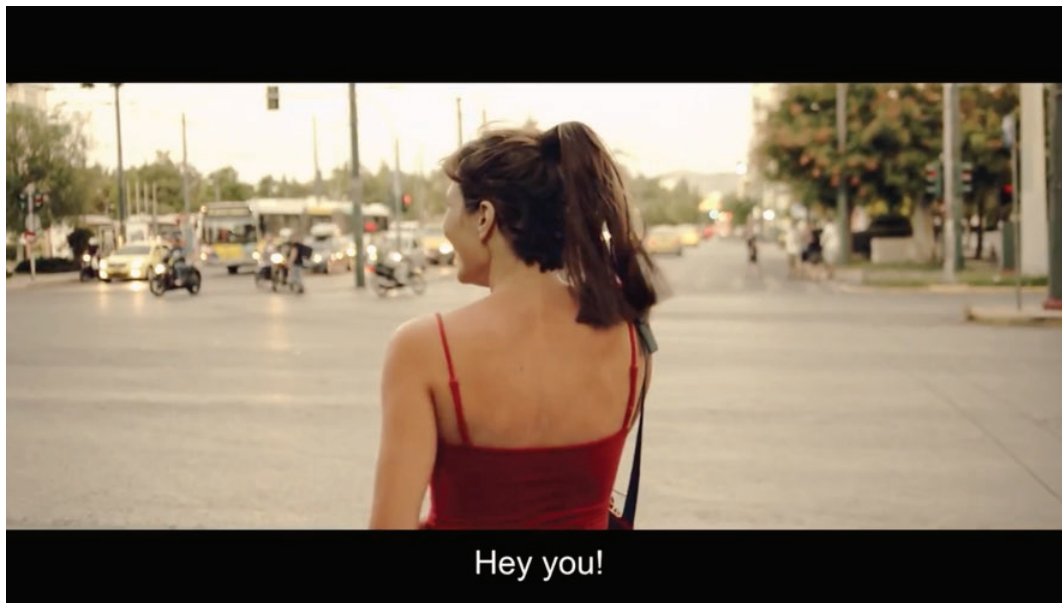
Figure 1: Patission Avenue