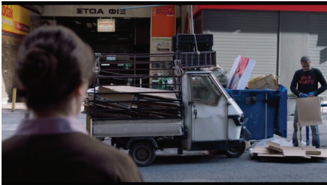
Figure 3: Her Job