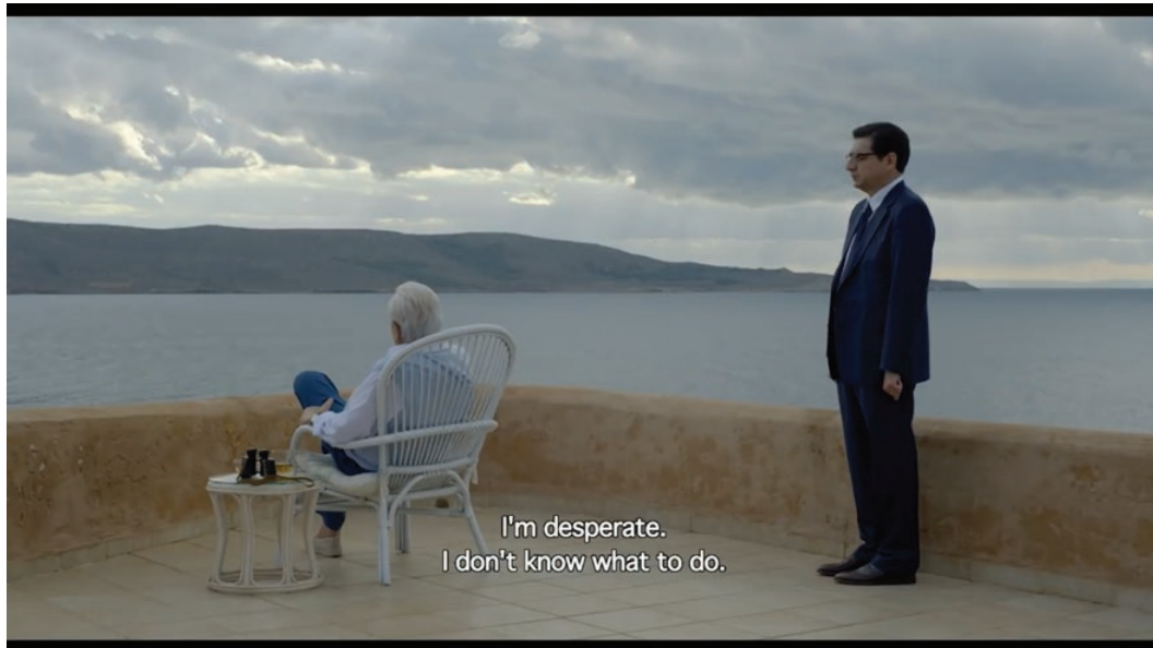
Figure 5: Pity

spaces of the middle class. This choice sparked reactions that viewed the films of the weird wave as a reflection of society. However, by the 2019 elections, the concept of the 'middle class' had become central to the political agenda of both governmental parties, instrumental to the rhetoric of the 'return to normality' (c.f. Panayiotopoulos 2021: 308-312, 350-351). Thus, the class representations of these films, which highlight exactly this performance between conformism and exuberance, seriousness and the ridiculous, the normal and the weird, become even more ironic and political.