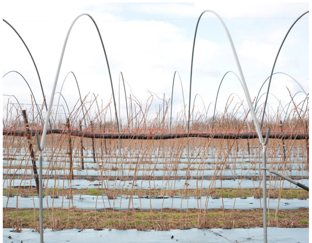
Figure 7: Raspberry Field, 2012