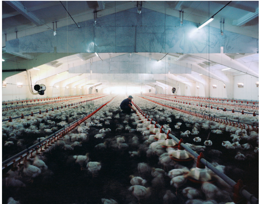
Figure 4: Berry Field, 2013

Since the mid 1990s the consumption of chicken has increased by 75 percent worldwide. Chicken are often reared in barns. One chicken barn has the capacity to rear 50,000 chickens.