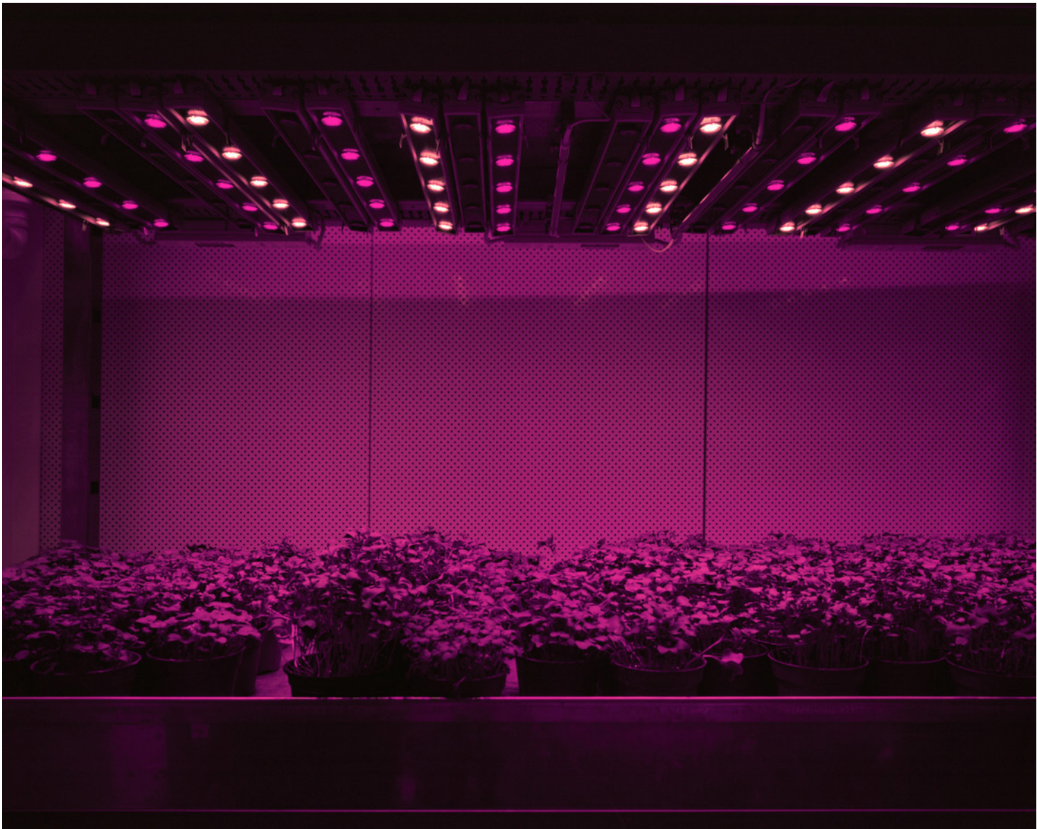
Figure 5: Cress, 2011

Cress, tomatoes, cucumbers, or lettuce are grown in closed systems just with LED lights. There is no sunlight and no direct exchange of air with the outside. Day and night, summer and winter stop existing. Humans are able to determine the shape, taste and colour of plants and fruits. They can be grown anywhere from the desert to inside of restaurants and supermarkets.