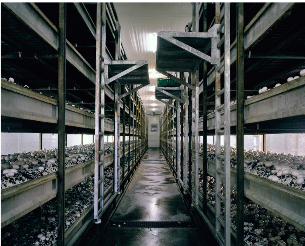
Figure 2: Mushrooms, 2012

In order to have total control over the nutrients and the irrigation, tomatoes are planted in sterile material such as rock wool and not in soil. By doing so the tomatoes are according to the growers less likely infected by diseases, a smaller amount of pesticides is needed and the yield can be increased.