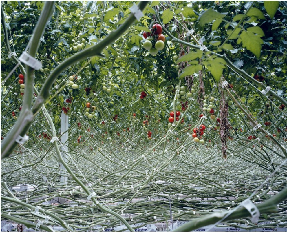
Figure 1: Tomatoes I, 2012

In order to have total control over the nutrients and the irrigation, tomatoes are planted in sterile material such as rock wool and not in soil. By doing so the tomatoes are according to the growers less likely infected by diseases, a smaller amount of pesticides is needed and the yield can be increased.