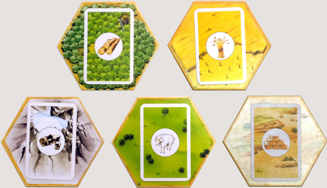
Figure 2 Resources and Terrains of Settlers of Catan (Authors, 2015)

As mentioned before, Settlers of Catan follows closely the formula of the eurogame both relating to the subordination of theme and setting to mechanics, and to the common tendencies in the representation of colonialization (Foasberg, 2019; Schreiber, 2011). Players are presented with land without previous population, a land rich in resources ripe for the taking that they must explore without reservation. There is no direct conflict between players, the closest to it is the use of the robber piece that may take resource cards away. Players compete to see which player more effectively explores the resources of the island, following the trend of representing this process through an economic management point of view. Native people are not present, unless one interprets the robber as their