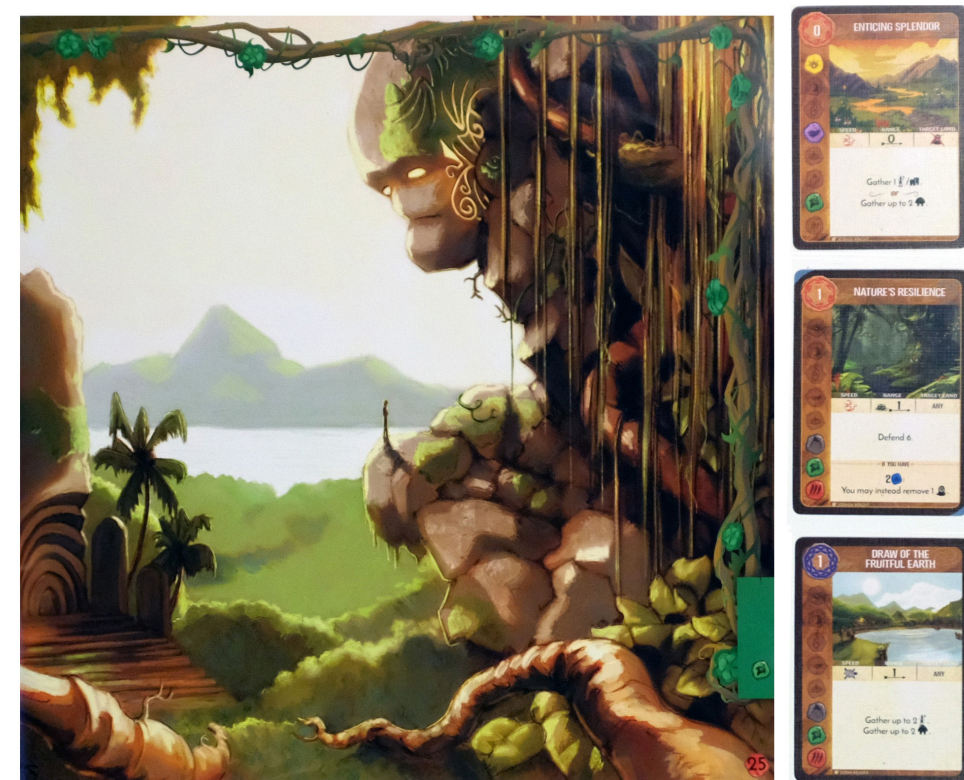
Figure 3 Pax Pamir's card illustrations (Authors, 2025)

The “Dahan” (name of the fictional native population) are granted even less agency than the colonizers themselves, who, as automatic opponents, have a complete