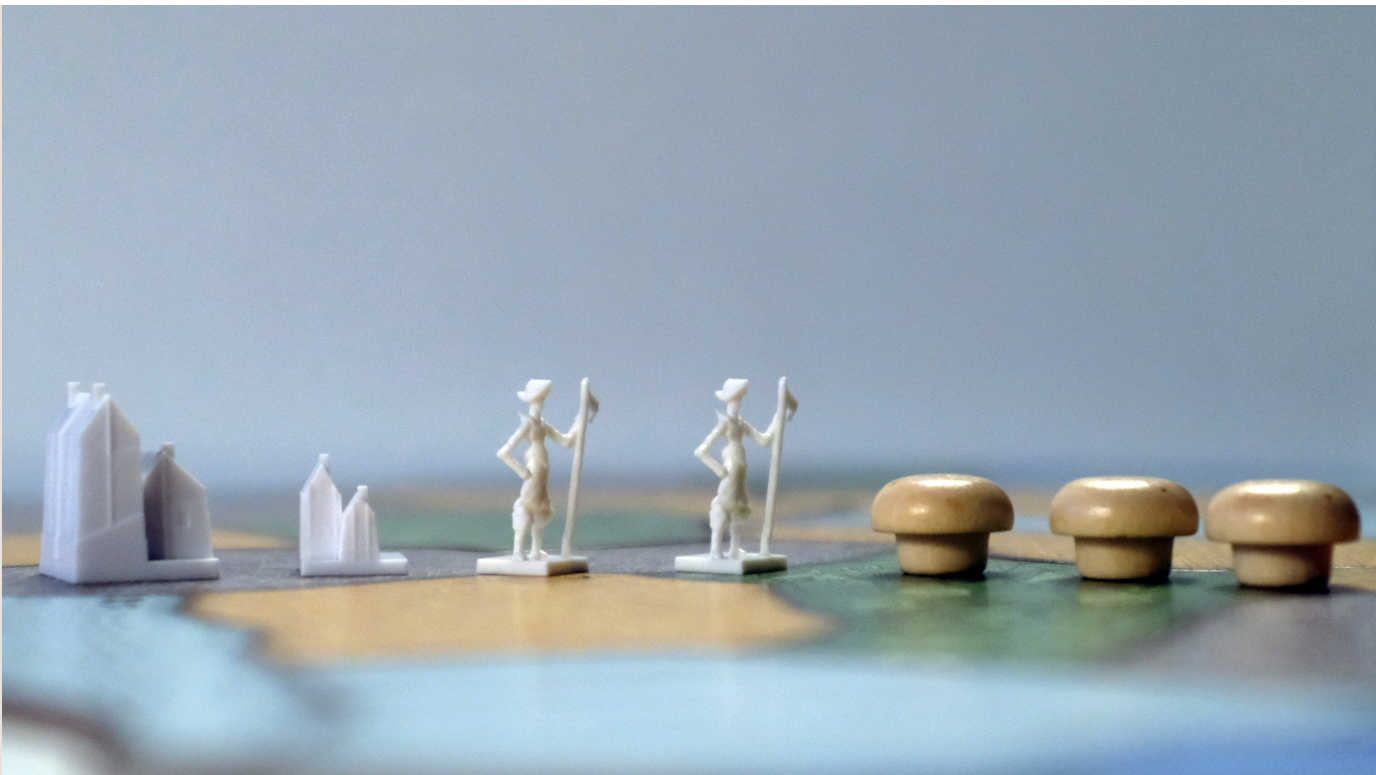
Figure 4 Naturalistic themes and idealistic representation in the illustrations of Spirit Island (Authors, 2025)