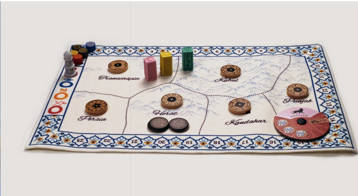
Figure 5 Pax Pamir's Board and components (Authors, 2025)