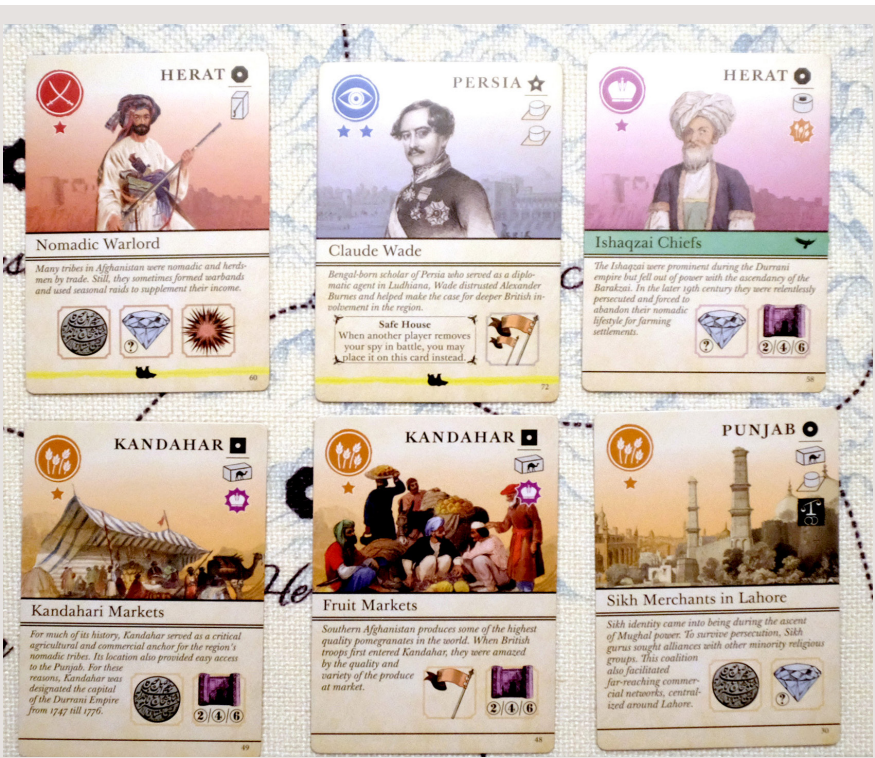
Figure 6 Pax Pamir's card illustrations (Authors, 2025)

vines a naturalistic imagery (see Figure 4). The colonizers are represented with a set of references that align them with the imagery of the Spanish colonizer, through their clothing, the use of galleons, and most notably, the helmet commonly associated with the Spanish “conquistadores”, even though the Spanish are not one of the colonial powers that can attack the island in certain game modes.