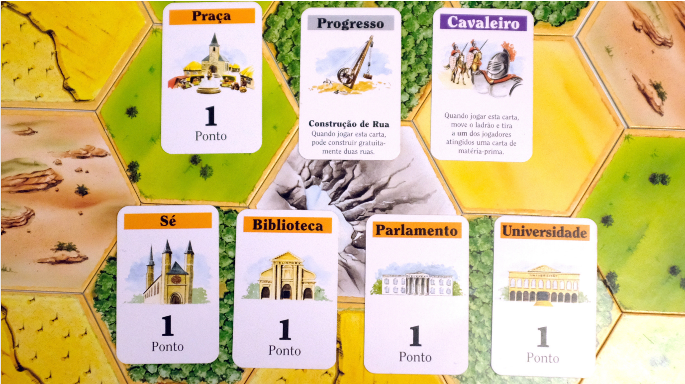
Figure 1 Illustration of the Development Cards in Settlers of Catan (Authors, 2015)

this expansion, as the game ends when enough blight (damage to the land as a result of the invaders’ ravaging action) accumulates or when a player’s presence on the board is eliminated. In order to win players must generate fear, which can be done directly through cards and abilities or, most commonly, through the destruction of settlers’ villages and cities. Also present on the board are the Dahan. They are the island’s native population and are working together with the spirits in order to eliminate the colonizing threat.