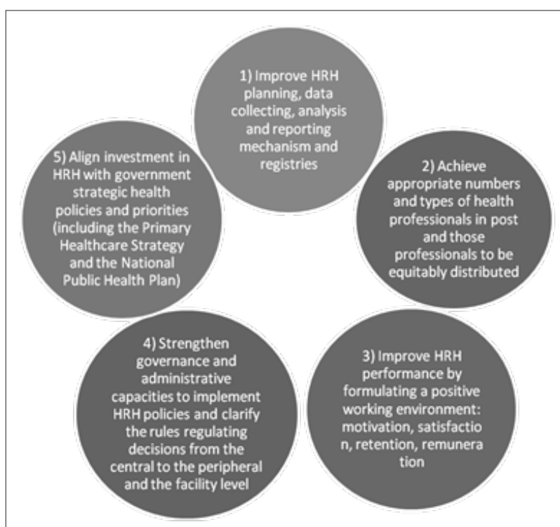
Figure 3: The five strategic objectives

Proposed strategic objectives and policy actions are itemized below along with some of the recommendations which constitute the most urgent policy priorities: