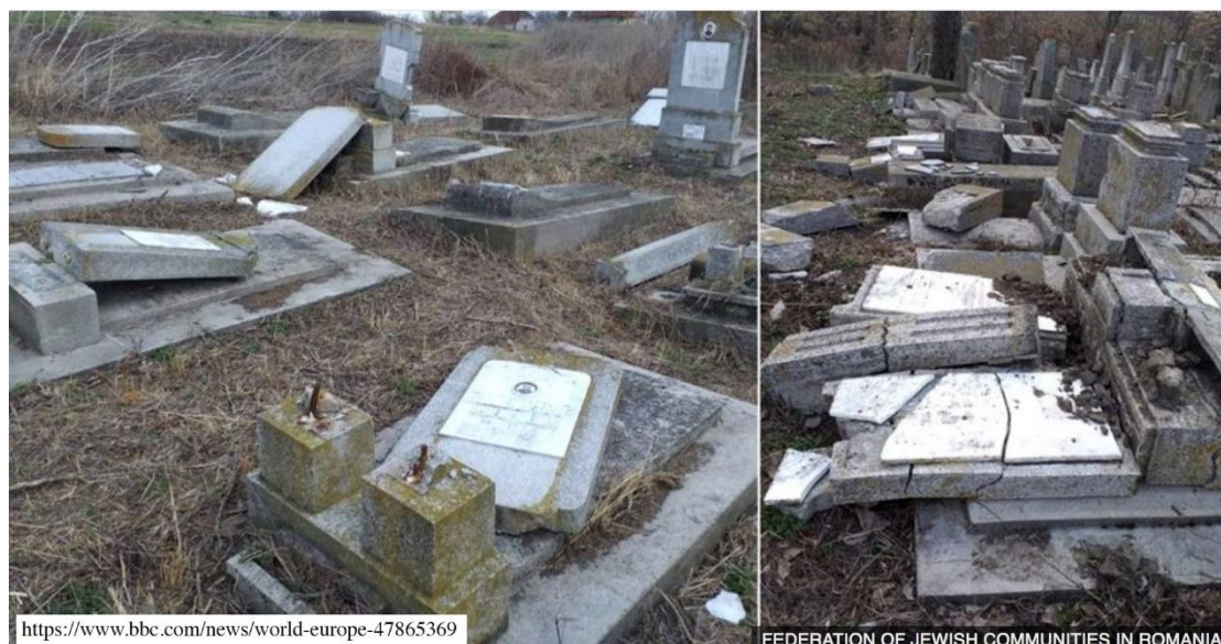
Fig. 3 The Jewish Cemetery in Huși, Romania, April 2019

Unfortunately, in addition to being sites of remembrance, cemeteries are also sites of vulnerability. Sometimes the 'beasts' will not let the dead rest in peace but rather signal a threat to the living through desecration of the dead.