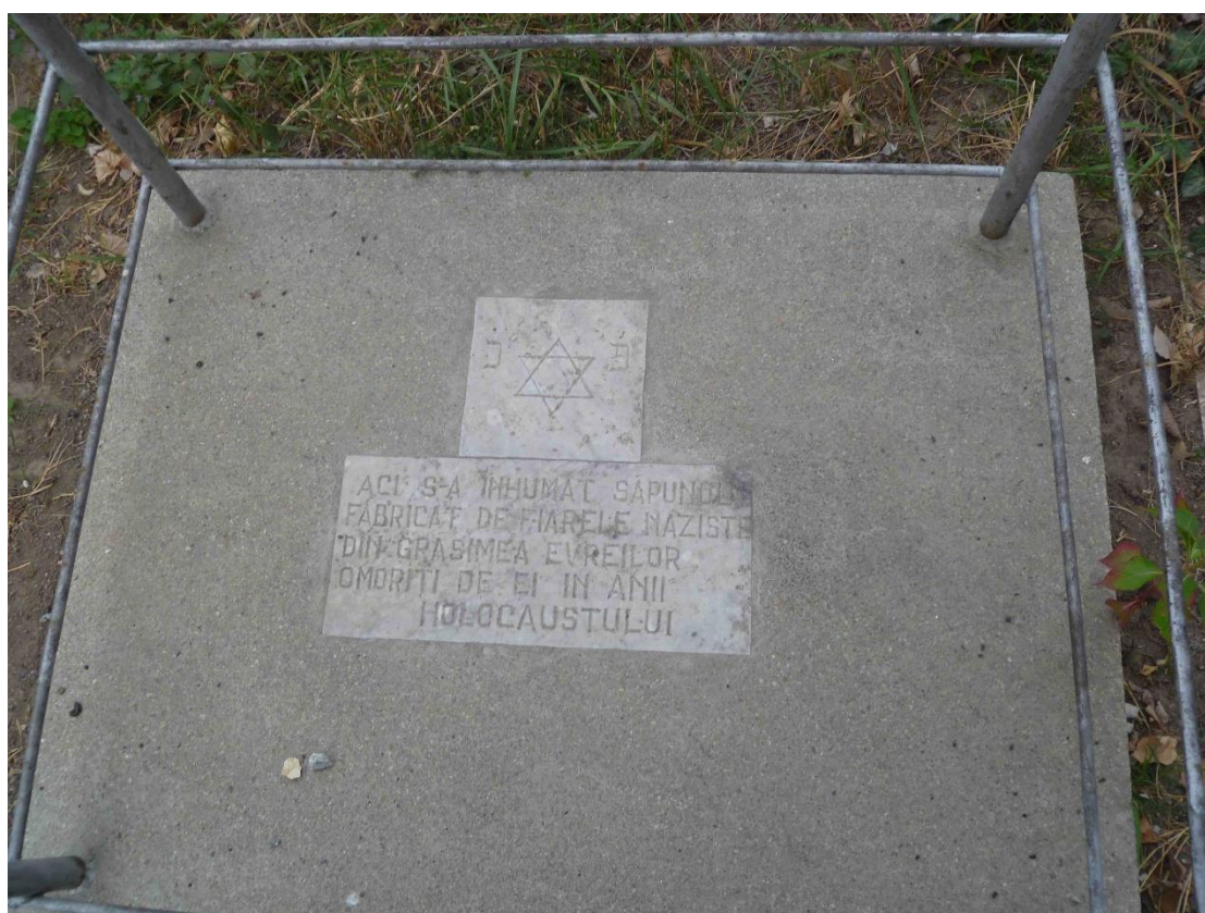
Fig. 2 Memorial to Holocaust victims, Brăila, Romania

Stanković's is a very different kind of paper from the others in the volume. It is about the use of language to commemorate loss. The paper is concerned primarily with a Bosnian women's embroidery project in Berlin and gives moving and striking images from that project as well as various sites of commemoration. Among the issues raised are the commemoration of the missing, individual and collective mourning, monuments and cemeteries, especially in the shadow of the Srebrenica genocide and the war in Bosnia in general. The author also adduces examples from Bosnia itself, as well as unknown soldier monuments and the Yad Vashem memorial to the Holocaust. In this commentary I would like to add an additional example of commemorating the missing.