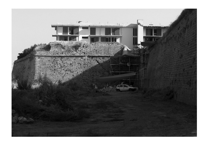
Fig. 11. Chania, Hotel Xenia on the seafront bastion of the Venetian wall. Before demolition, 2007.

as regards the protection and enhancement of a medieval monument. Nevertheless the restoration was done without any prior study or documenting of the extensive building history of the complex, with unauthorized use of concrete and the creation of an entirely new pseudo-Romanesque doorway at the east end, where the presbytery had once stood, as there was no access on the other sides of the building which belonged to various owners.