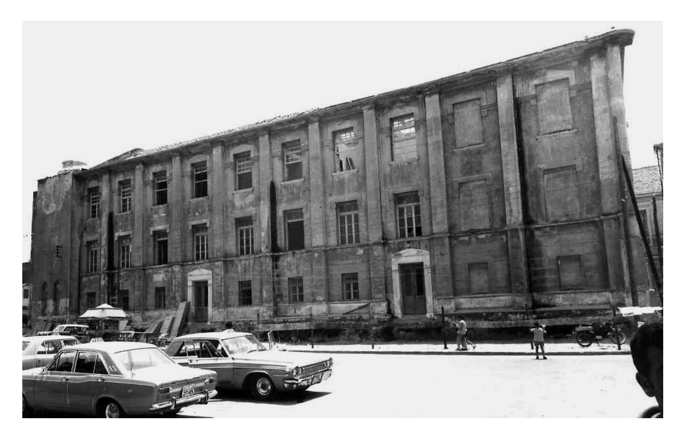
Fig. 4. Herakleion, San Salvatore during the demolition 1972.

adopted by the mendicant orders of the Roman Catholic Church. The building had many similarities with the Eremitani Church in Padua, which also belonged to the Augustinians. Moreover it was the only remaining Western-style medieval church on Greek soil which had preserved its entire shell until then. Naturally it was a deserted building, which had been unused for about a decade.