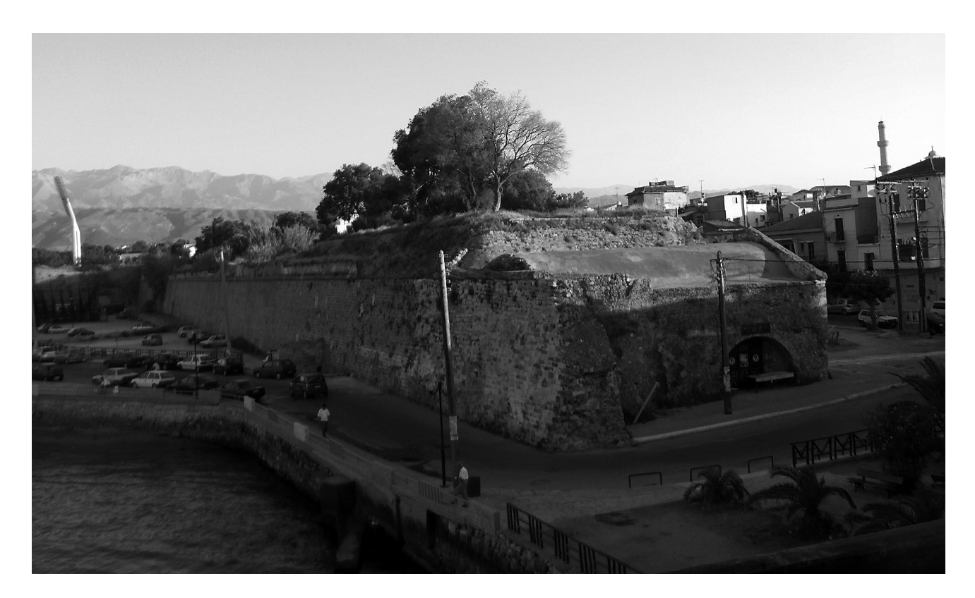
Fig. 1. Chania, Sabbionara gate. A part of the Venetian wall has been demolished to let the street pass through.

King Otto, to the codification of its occasional revisions in 1932, the legislation spoke of antiquities as well as 'works of the ancestors of the Greek people'3 and there is no doubt that the overwhelming majority of those charged with implementing the legislation were not ready to include monuments that were neither ancient, nor Byzantine nor even 'post-Byzantine' in the familiar pattern of the history of the nation. Even though from the twenties on certain administrative regulations included building complexes from the Venetian and Ottoman periods, especially forts, in the buildings listed for preservation henceforth, these monuments were never actually integrated in the historic landscape of their region. They remained in a dilapidated state, without active protection, in run-down areas. The reasons for this were not, of course, entirely ideological, but rather mainly financial. The priorities according to which funds available for monuments were spent were determined by needs arising from the ideological framework for preservation and display of the ancient monuments, the rescue digs due to rebuilding in modern towns and the Western European interest in these monuments, whether