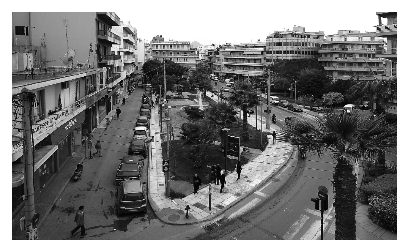
Fig. 5. Herakleion, Kornaros Square in place of San Salvatore.

multi-storey blocks of flats whose new owners wanted to look out onto squares.