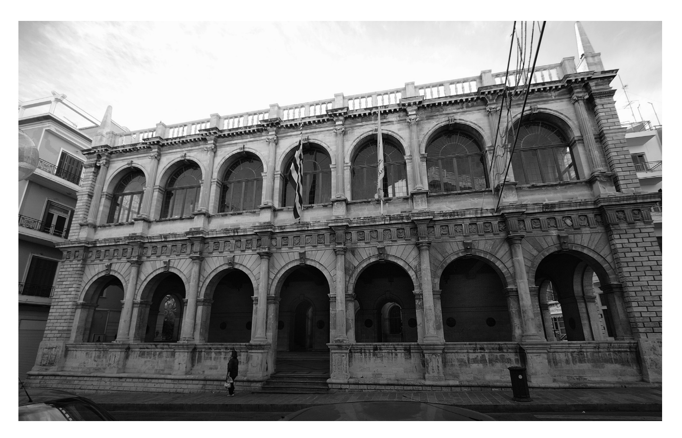
Fig. 7. Herakleion, Town Hall in place of the Venetian loggia. Rebuilt in the eighties.