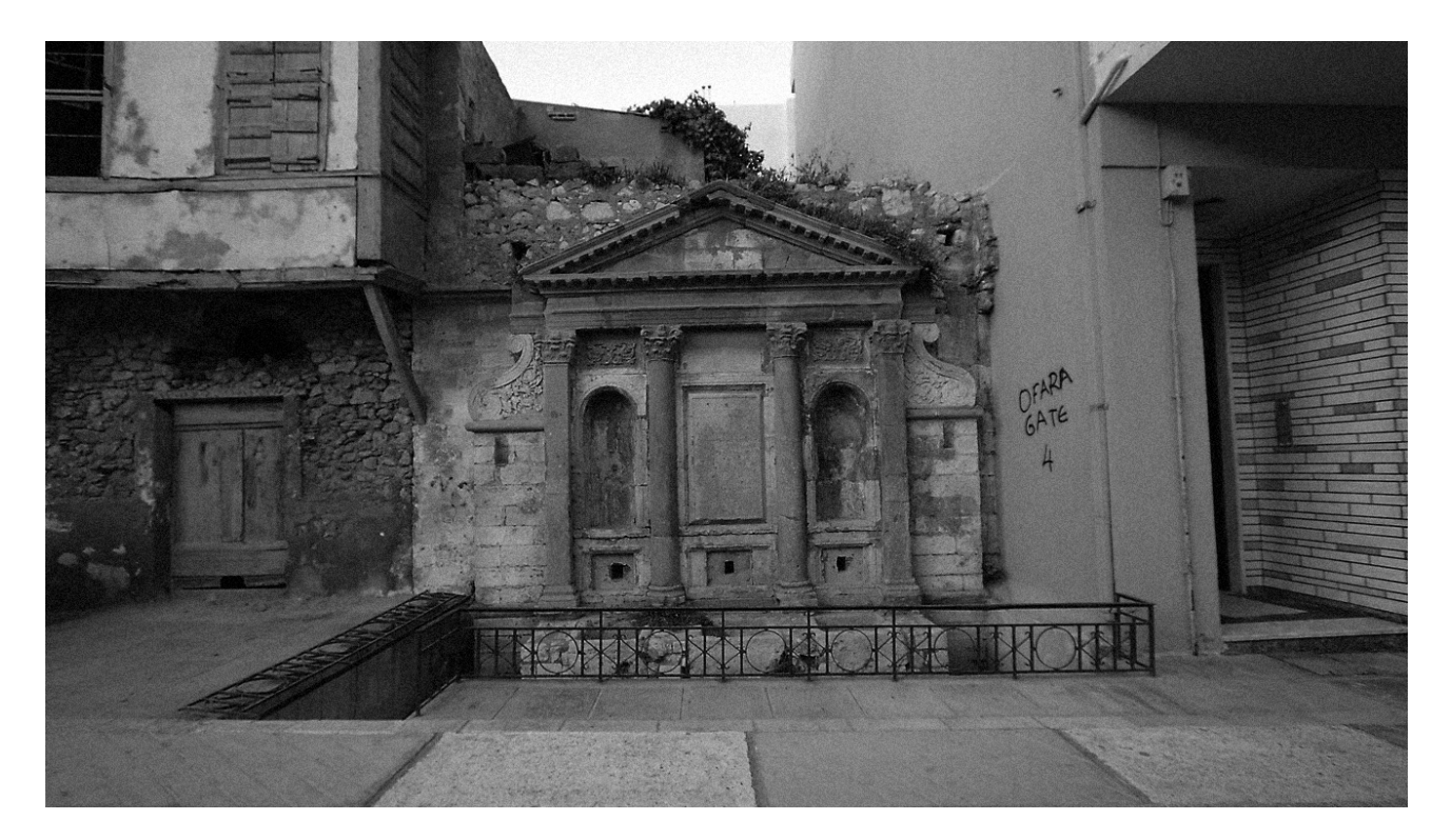
Fig. 12. Herakleion, Priuli Fountain, 1666.

Nevertheless this positive evaluation of the period of Venetian rule only influenced the policy on monuments very gradually and with difficulty. There have already been plans to protect individual monuments. However, the many surviving monuments from the Venetian period in Crete, some of which are massive and impressive, have yet to find their place within the Cretan historical landscape. Progress towards integrating them into the actual cityscape is slow (fig. 12), and academic research (and the corresponding restoration and preservation) are also lagging behind in this respect. Finally, incorporating them in the collective historical memory is proceeding at a snail's pace.