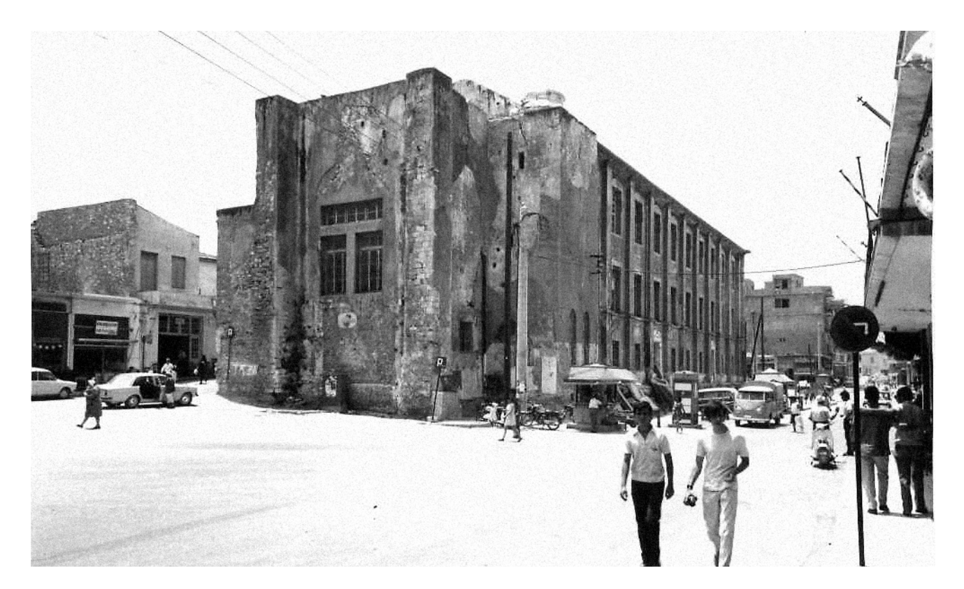
Fig. 3. Herakleion, San Salvatore before demolition, 1972.

as early as the end of the Ottoman period, when the Ottoman authorities were trying to modernize, and increased as soon as Crete won its independence. An example of this modernization is the construction of the Municipal Market in Chania, in itself an important piece of architecture of its time, which involved demolishing of the piatta-forma of the impressive sixteenth-century Venetian fortifications.4 There was extensive demolition, especially between the wars, both for road widening and for reconstruction purposes. Thus in Herakleion and Chania parts of the marvellous sixteenth-century fortification walls were demolished to make way for arterial routes (fig. 1) and a large number of private houses were knocked down, parts of which dated back to the Venetian period. Though we have no direct evidence as regards the latter, we can deduce that this was the case from two indicators. The details of some of these houses had been photographed in the early twentieth century by the Italian scholar Giuseppe Gerola; by mid-century when the first attempts were made to preserve monuments from the Venetian period some architectural members, lacking documented provenance, were