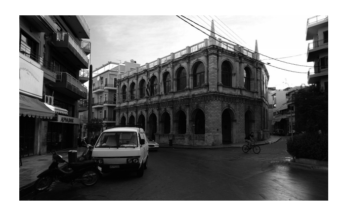
Fig. 8. Herakleion, as fig. 7, view from southwest.

town without pavements. Ugly residential blocks, all built since 1960, now crowd around it (fig. 8).