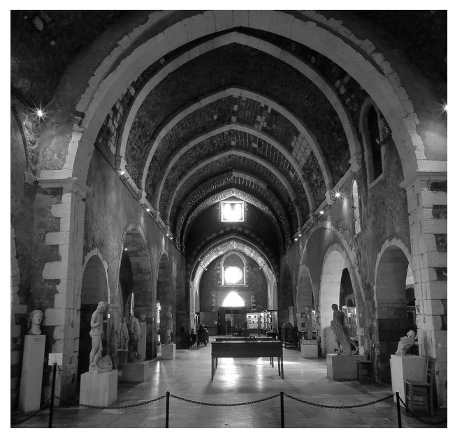
Fig. 9. Herakleion, Morosini Fountain, first half of the 17th century.