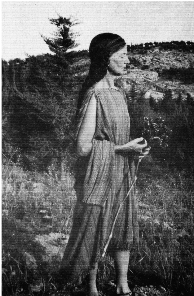
Fig. 1. Eva Palmer Sikelianos photographed in 1927 among the ruins of Delphi.