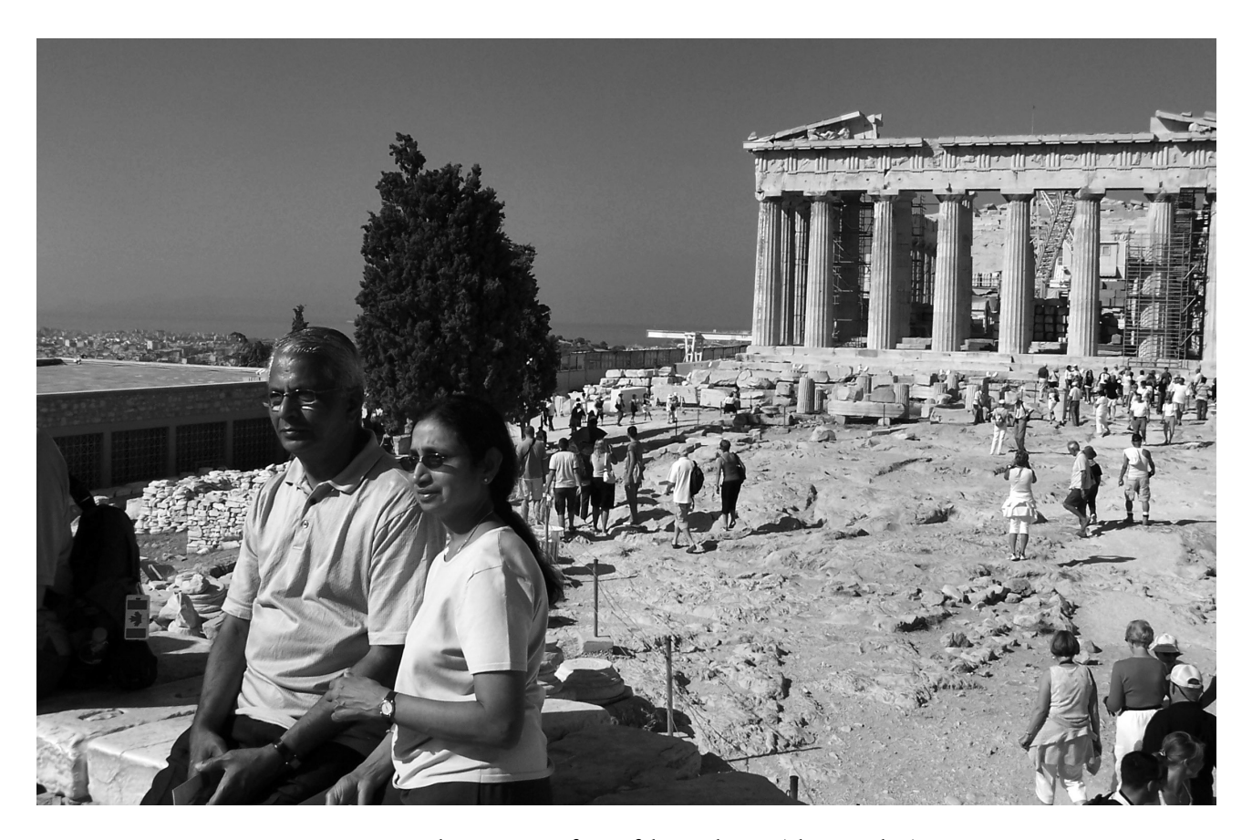
Fig. 1. Indian visitors in front of the Parthenon.

homogenous social, ethnic and religious entity? (A typical example is the complete identification of the Greek nation with Orthodoxy). Why therefore do we insist on linear continuity rather than partly superimposed circles one after another? How can one give the 'new' Greeks the feeling of participating in the country where, like it or not, they have chosen to live, when that country's past is literally untouchable? In such a situation the past can either be viewed with indifference or with the mentality of the tourist, who has a photo taken on the Acropolis because - according to the international rules of a global lifestyle - a visit to the Parthenon is one of the 50 items on the list of 'things to do before you die' (fig. 1). If a foreigner resident in Greece regards the material remains of the past with indifference, that indifference can easily become hostility to the unfamiliar - and if we are completely realistic, this is exactly the attitude of most Greeks to the material remains of their otherwise glorious past.