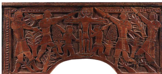
Fig. 3. Carved wooden frame with representation of the Crucifixion. Athens, Benaki Museum 8798.

The idea that the object came from a sanctuary screen