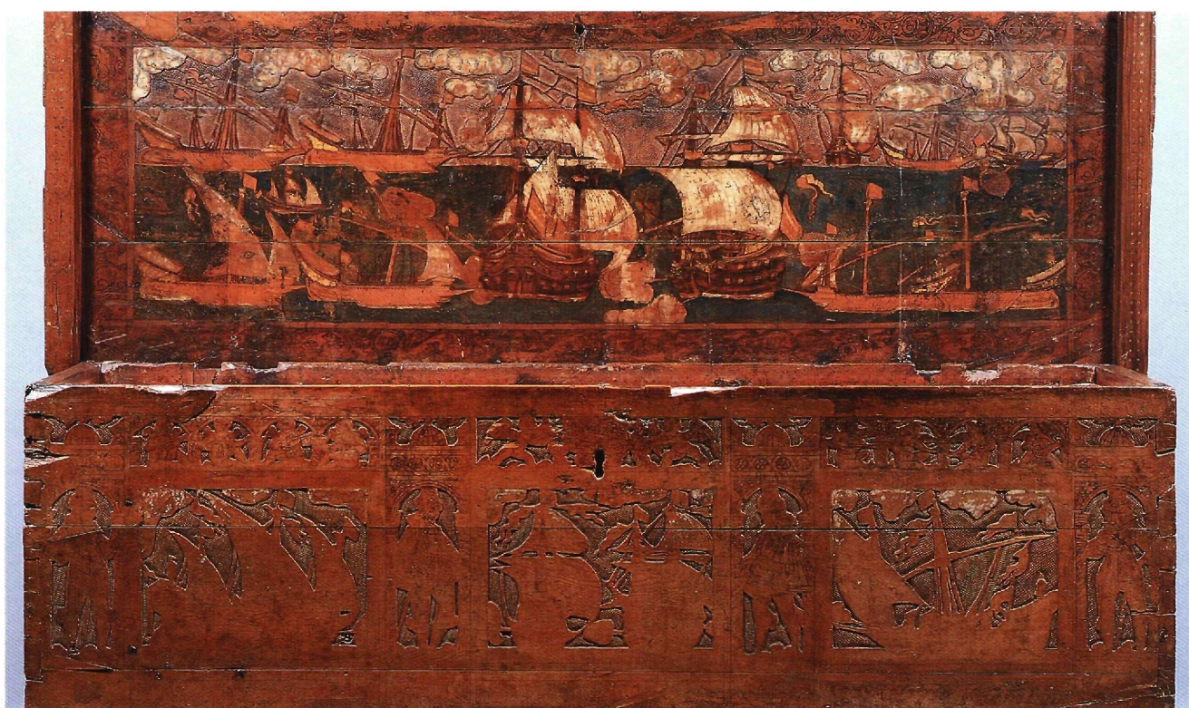
Fig. 9. Chest from Folegandros. Athens, Benaki Museum 8270.