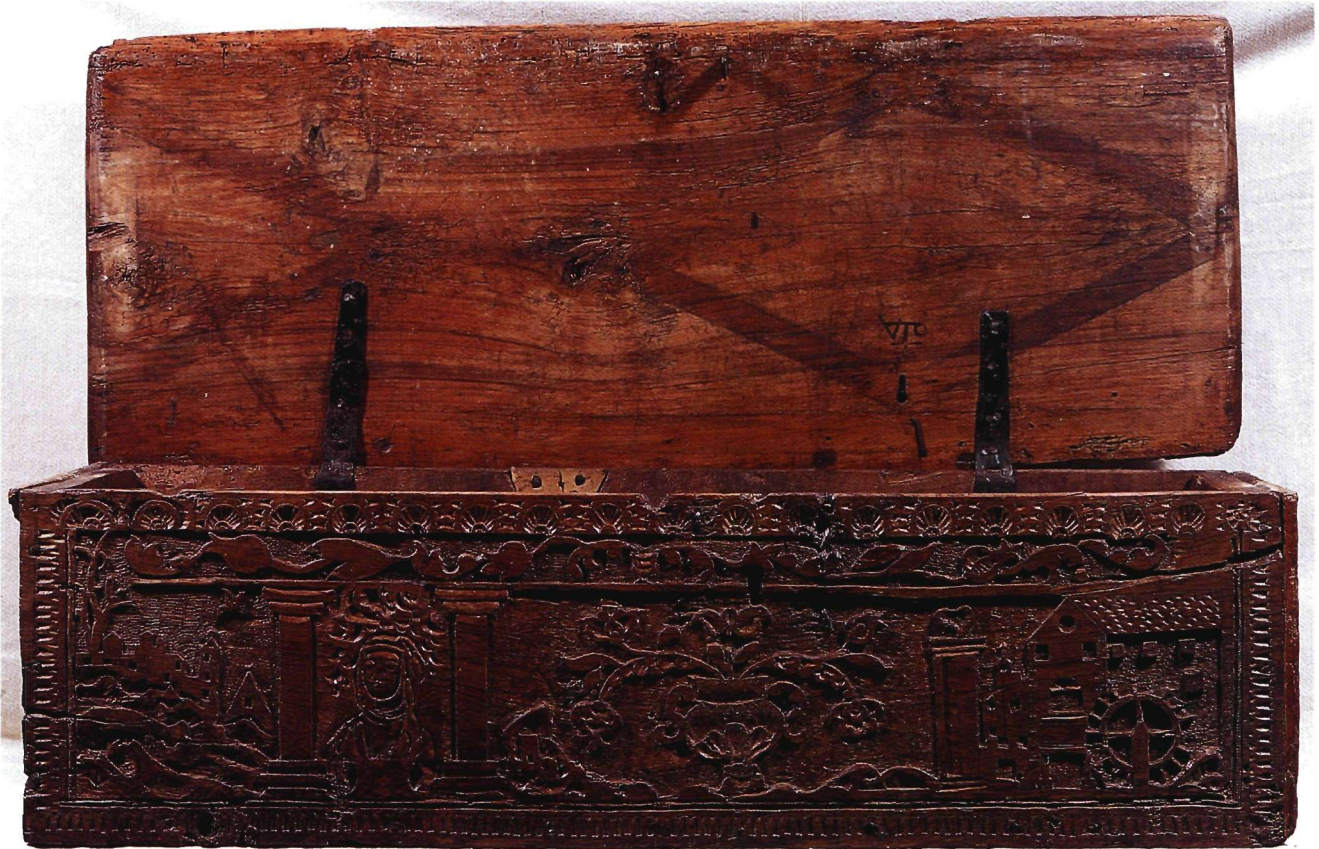
Figs 14-15. Lid and front panel of chest. Athens, Benaki Museum 8718.