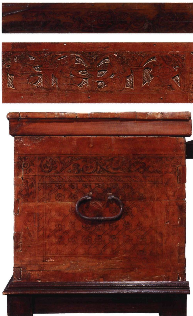
Fig. 10. Garland with vegetal motifs. Detail from the chest fig. 9.