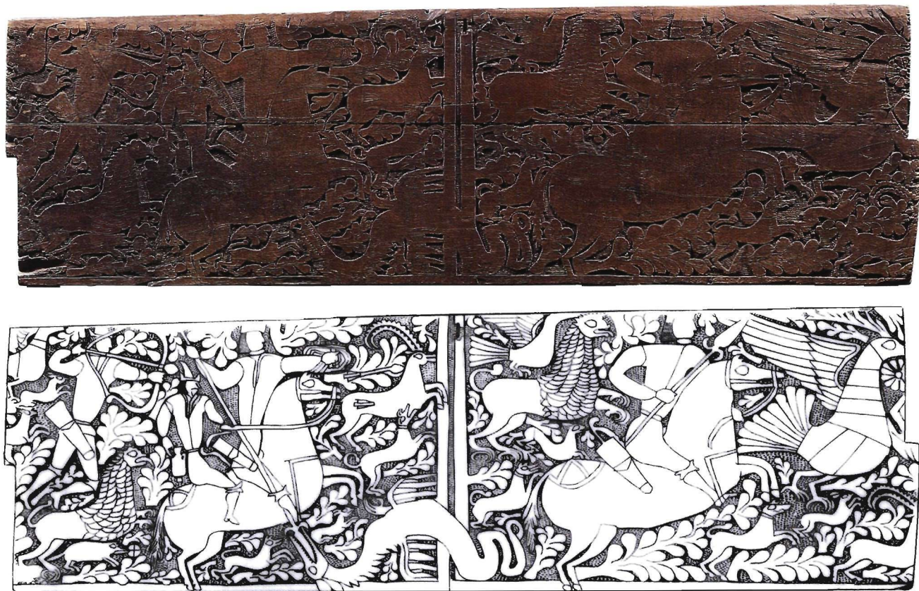
Fig. 1. Front panel of carved wooden chest, l.: 1.37 m. Private collection.