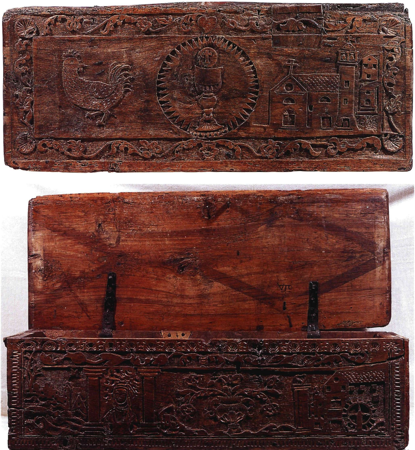
Figs 14-15. Lid and front panel of chest. Athens, Benaki Museum 8718.