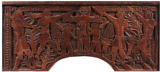
Fig. 3. Carved wooden frame with representation of the Crucifixion. Athens, Benaki Museum 8798.

The idea that the object came from a sanctuary screen