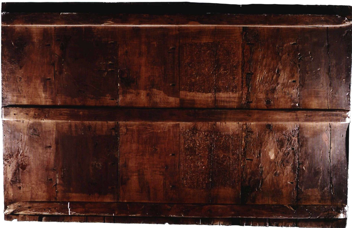
Fig. 4. Icon of the Last Judgement. Chania.