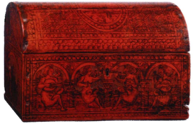
Fig. 13. Box from Friuli (after: Semenzato, Casa d'aste , Auction Catalogue, Florence, December 2001 no 72).

Further investigation may be able to provide firmer guidance to the researcher whose attentions are currently poised between Italy and Crete. I am myself not able to say if the presence of another object in Friuli—a small box with a cylindrical lid (fig. 13)— 42 can be similarly explained as a product of the exporting activity of some Cretan workshop. Low-level relief is not the technique used here, but rather ‘pokerwork’ ( decorazione pirogra-