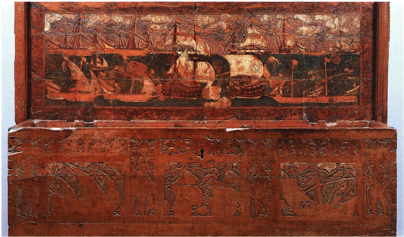
Fig. 9. Chest from Folegandros. Athens, Benaki Museum 8270.

at the celebrated naval battle of Lepanto on 7 October 1571, 33 a date which represents a terminus post quem ; we may therefore assume that the work was executed at some point between the last quarter of the 16th and the first quarter of the 17th century, the period during which the battle might have been expected to maintain its dramatic impact on both western and eastern art. 34 The same comment applies to the typology of the ships depicted therein; Chrysa Maltezou kindly arranged for these to be examined by Alvise Chiggiato, member of the Italian Institute of Archeology and Naval Ethnology in Venice, to whom I am most grateful. Though he interpreted the content differently, he came to a similar conclusion as to the dating of the work and its origin in the East. 35