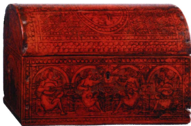
Fig. 13. Box from Friuli (after: Semenzato, Casa d'aste , Auction Catalogue, Florence, December 2001 no 72).

Further investigation may be able to provide firmer guidance to the researcher whose attentions are currently poised between Italy and Crete. I am myself not able to say if the presence of another object in Friuli—a small box with a cylindrical lid (fig. 13)— 42 can be similarly explained as a product of the exporting activity of some Cretan workshop. Low-level relief is not the technique used here, but rather ‘pokerwork’ ( decorazione pirogra-