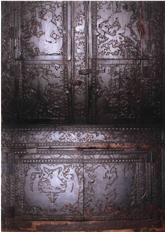
Fig. 8. Front panel of carved wooden cupboard, detail. Chania, Historical Archive.

relief ornamentation, probably originating from a carved wooden chest in second use. The dense decoration consists of representations of rarely-depicted animals surrounded by stylised vegetal motifs, a feature of western art ". The panel in the Last Judgement icon is better preserved (fig. 5), though in spite of its having been isolated with the aid of electronic technology (fig. 6), a 'reading' of the decorative motifs is at present possible only with the aid of a drawing (fig. 7). 28 Andrianakis' dating of the two icons to around 1625 certainly defines the terminus ante quem of the carving, but it cannot provide any precise confirmation of their position in the chronology of post-Byzantine secular Cretan woodcarving; similarly there can be no guarantee of their origin in Chania, because the item of furniture from which they derive could equally well have been sent there from Candia. My own opinion is that it would have taken at least a generation before the