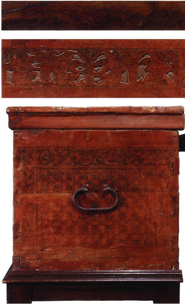
Fig. 10. Garland with vegetal motifs. Detail from the chest fig. 9.