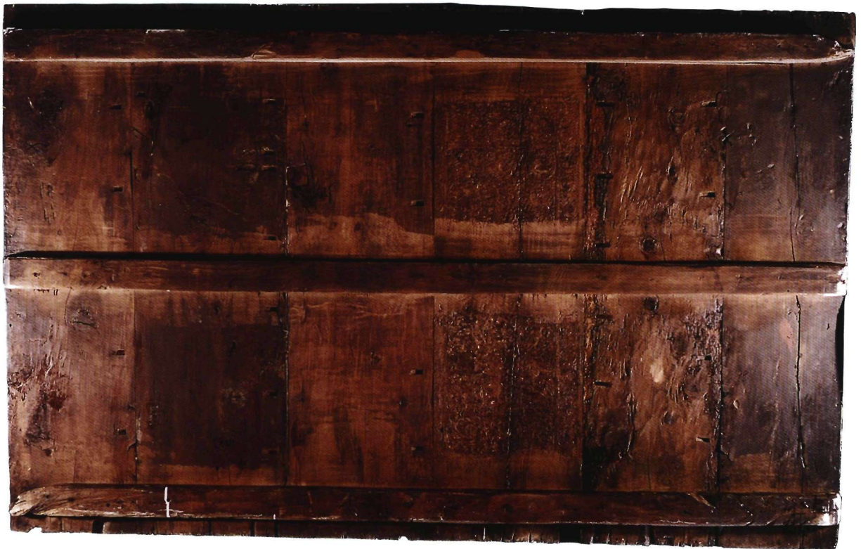
Fig. 4. Icon of the Last Judgement. Chania.