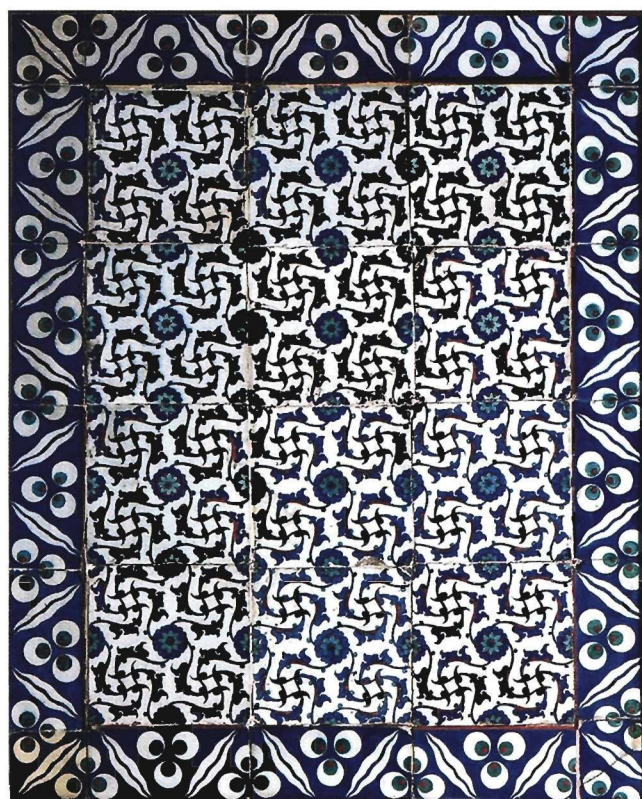
Fig. 7. Tiles made for the mosque of Rüstem Pasha Mosque in Istanbul, Iznik, ca. 1560. Athens, Benaki Museum, inv. no. 102.

of material that is no longer found in any original locations within the former Ottoman empire. Sets of large rectangular tiles about 60 x 90 cm designed for programmatical use in a single building are a rare case, but six of these, one with elaborate inscriptions, have survived in various collections. 12 Some of these may have been intended for wooden buildings or for royal Ottoman kayık barges, where fields of smaller tiles would have been impractical. 13 Large octagonal tiles, whose original purpose remains obscure but which may have been the tops of tabouret tables, have also made their way into museum collections (fig. 9). Other tiles were made in the form of spandrels for the recessed shelves ( dolap ) that were built into many important Ottoman domestic buildings. Many of these are now in museum collections but virtually none has survived in situ in its original location.