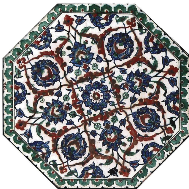
Fig. 9. Large octagonal tile, Iznik, ca. 1560-1570. Athens, Benaki Museum, inv. no. 103.

est and arguably the most important two-dimensional works in the Turkish art tradition. 14 They evidently draw their inspiration from the five very large and very famous blue, turquoise and white tiles now on the facade of the Sünnet Odası in the Topkapı Palace, 15 which were probably executed after designs of the court artist Shah Kulu sometime in the second quarter of the 16th century (fig. 10). The large unified-field tile panels from Iznik come in two types –with added borders, and with inclusive borders. The earliest examples of such tile panels were made to fit the irregular spaces of spandrels between arches of