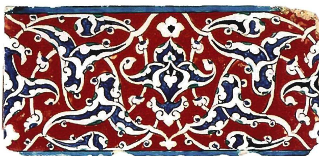
Fig. 8. Border tile made for Murad III Odasi, Topkapi Palace in Istanbul, Iznik, ca. 1580. Athens, Benaki Museum, inv. no. 85.

Unified-field panels –large designs created first as cartoons on huge sheets of paper and then transferred to entire fields of identical rectangular tiles– are the larg-