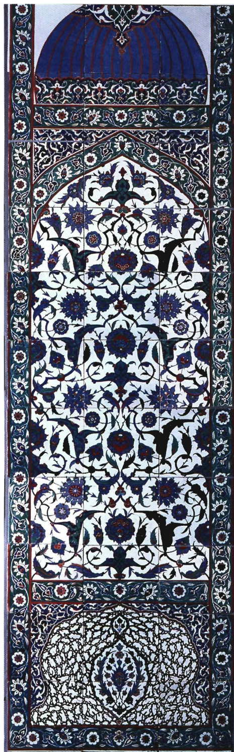
Fig. 12. Tile panel, probably from the Edirne Palace, reconstituted by the Benaki Museum (original tiles: Benaki Museum, Museum of the Calouste Gulbenkian Foundation. The remaining part of the panel reproduces tiles at the Victoria & Albert Museum and the Vienna Museum für Angewandte Kunst), Iznik, ca. 1570-1574.

tiles from the middle of the large panels, especially if they have no border designs which are easier to match up, is far more difficult. The work is made easier when the researcher is able to scan research photographs made over many decades, and then to re-create them in the same scale digitally, and then to attempt to put them together in much the same way as a picture-puzzle, but with all of the 'pieces' being the same shape and size. In working with literally thousands of slides taken in museums all over the world, I was able by the mid-1990s to identify a significant number of dispersed unified-field panels, but two of these were by far the most interesting. Juxtaposition of individual tiles and small groups of adjoining tiles from the Benaki Museum, the Calouste Sarkis Gulbenkian Museum, the Museum für Angewandte Kunst, the Victoria & Albert Museum, and the Metropolitan Museum led to a digital reassembly first discussed by the author at a Turkish art conference in Utrecht in 1999. Additional work by the Benaki Museum staff led to a more refined digital assembly of what was originally none identical panel of tiles (fig. 12), an unprecedented