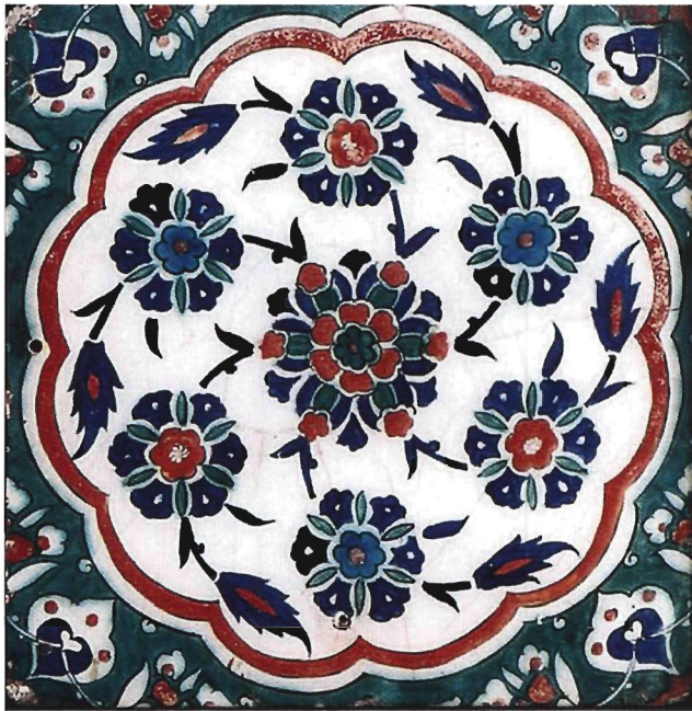
Fig. 5. Tiles made for the mosque of Mesih Ali Pasha in Istanbul, Iznik, ca. 1586. Athens, Benaki Museum, inv. no. 108.