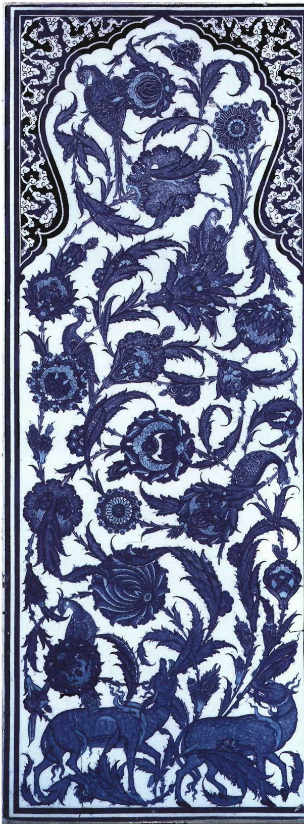
Fig. 10. Large tile with design after Shah Kulu, from Sünnet Odasi, Topkapı Palace in Istanbul, Iznik, ca. 1550.