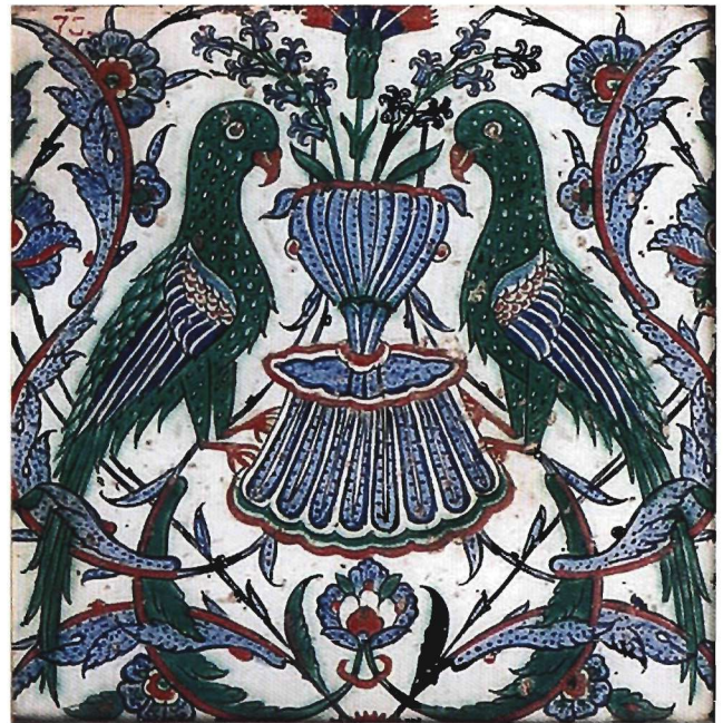
Fig. 6. Tiles with confronted birds, Iznik, ca. 1570-1580. Athens, Benaki Museum, inv. no. 75.

into adjacent tiles (fig. 3). One quite exceptional pattern from the mosque of Rüstem Pasha in Istanbul, found early in the development of polychrome Iznik mural ceramics, is notable both for the asymmetry of its design and for repeating only in a horizontal direction (fig. 4). Smaller groups of mass-produced tiles were made with self-contained symmetrical designs, usually consisting of bouquets of flowers, self-contained cusped roundels (fig. 5) or even two confronting birds (fig. 6).