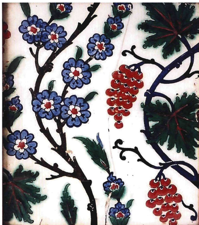
Fig. 11. Tile from the mosque of Takiyeci Ibrahim Aga in Istanbul, Iznik, ca. 1590. Athens, Benaki Museum, inv. no. 11166.

tiles from the middle of the large panels, especially if they have no border designs which are easier to match up, is far more difficult. The work is made easier when the researcher is able to scan research photographs made over many decades, and then to re-create them in the same scale digitally, and then to attempt to put them together in much the same way as a picture-puzzle, but with all of the 'pieces' being the same shape and size. In working with literally thousands of slides taken in museums all over the world, I was able by the mid-1990s to identify a significant number of dispersed unified-field panels, but two of these were by far the most interesting. Juxtaposition of individual tiles and small groups of adjoining tiles from the Benaki Museum, the Calouste Sarkis Gulbenkian Museum, the Museum für Angewandte Kunst, the Victoria & Albert Museum, and the Metropolitan Museum led to a digital reassembly first discussed by the author at a Turkish art conference in Utrecht in 1999. Additional work by the Benaki Museum staff led to a more refined digital assembly of what was originally none identical panel of tiles (fig. 12), an unprecedented