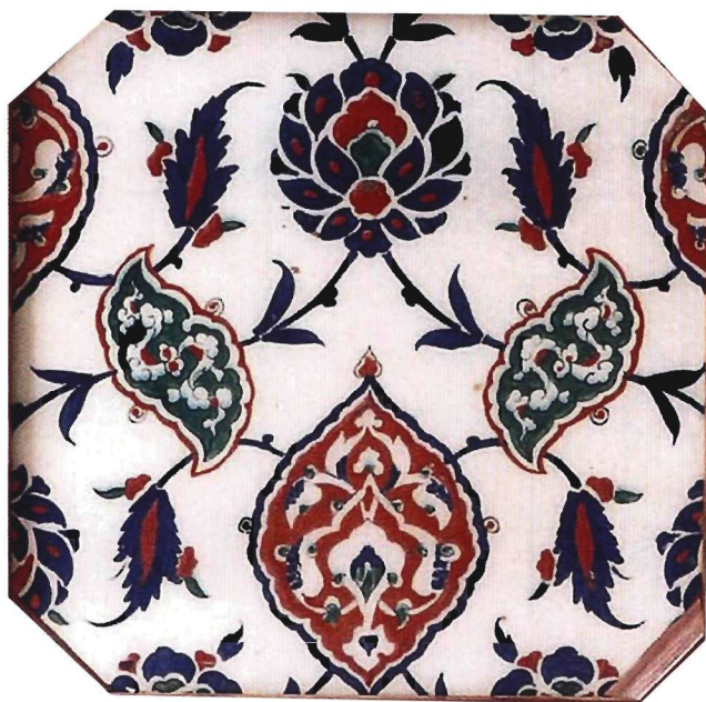
Fig. 1. Tile made for the tomb of Selim I in Istanbul, Iznik, ca. 1574. Athens, Benaki Museum, inv. no. 11157.

were subsequently recycled to other Ottoman monuments, large quantities of such artistic works were purchased by private collectors in Europe and around the Mediterranean; of these, the bulk eventually ended up in museum collections. Visitors today to the Victoria & Albert Museum in London can see numbers of Ottoman tiles from many different monuments in that museum's well-lit galleries of Islamic ceramics. Large panels of Iznik tiles from identifiable monuments were formerly on display in the Musée des arts décoratifs in Paris. Important collections of Iznik tiles relegated to storage are found in other museums, most notably the Louvre in Paris and the Calouste S. Gulbenkian in Lisbon. 5 The collecting of Iznik tiles in Europe during the late 19th and early 20th centuries appears to have received a special impetus from two events: first, the Russo-Turkish War of 1878-1879, with the siege and subsequent occupation of the secondary Ottoman capital city of Edirne, and the destruction of the revetments of its palace; and second, the 1902 earthquake in Istanbul, which took a special toll in monuments near the fault by the city walls at Topkapı and Edirnekapi. As the prices of Iznik tiles have continued to reach very high levels in the marketplace (a place they have maintained for well over a century and a half) the