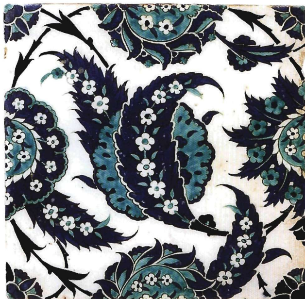
Fig. 3. Tile with asymmetrical central motif, Iznik, ca. 1560. Athens, Benaki Museum, inv. no. 83.