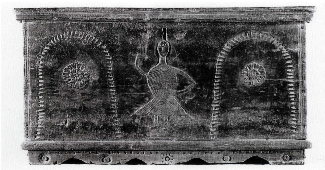
Fig. 5 Section of a carved wooden chest. Athens, Benaki Museum 37911 (photo: M. Skiadaresis).