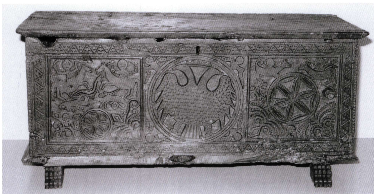
Fig. 11. Carved wooden chest. Nauplion, Peloponnesian Folklore Foundation 1989.09.0001.