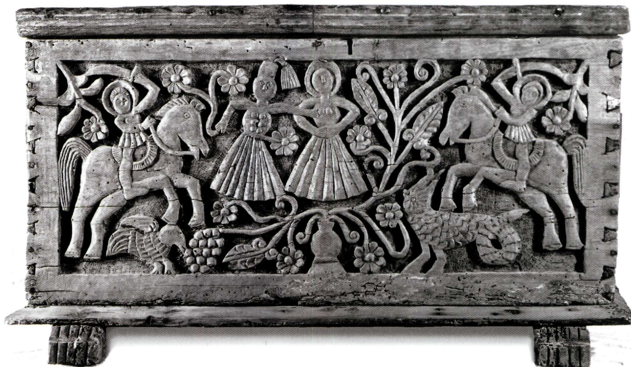
Fig. 8. Carved wooden chest. Athens, Dionysis Fotopoulos Collection.