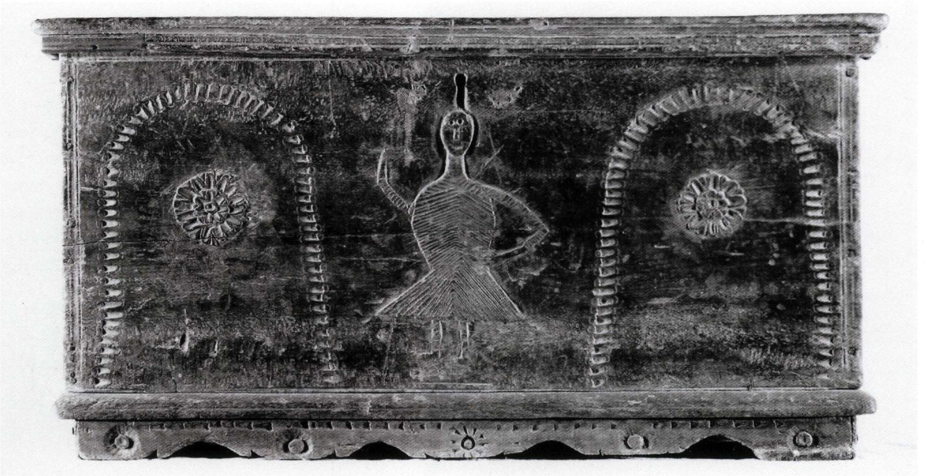
Fig. 5 Section of a carved wooden chest. Athens, Benaki Museum 37911 (photo: M. Skiadaresis).