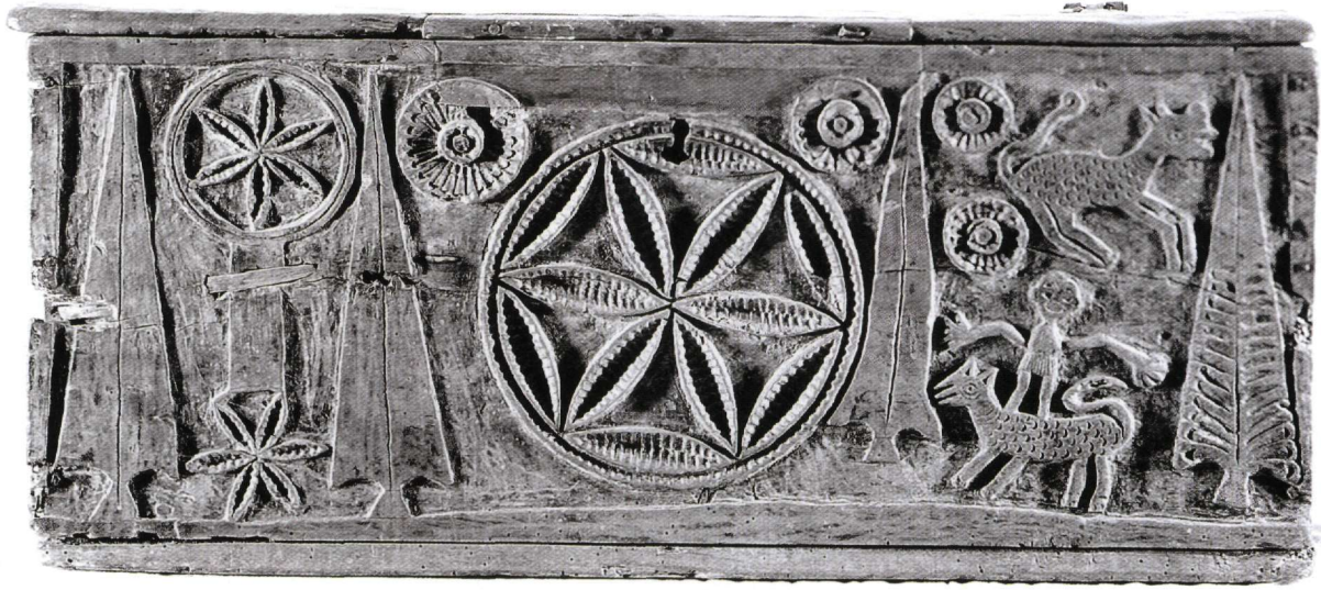
Fig. 12. Carved wooden chest. Athens, Alekos Eustathiadis Collection.