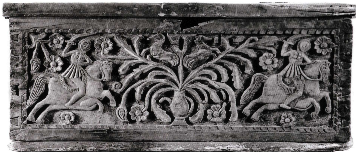
Fig. 10. Carved wooden chest. Athens, Alekos Eustathiadis Collection.