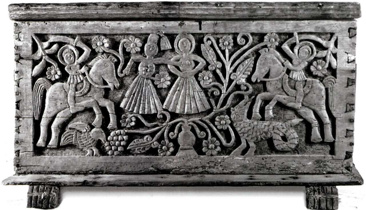
Fig. 8. Carved wooden chest. Athens, Dionysis Fotopoulos Collection.