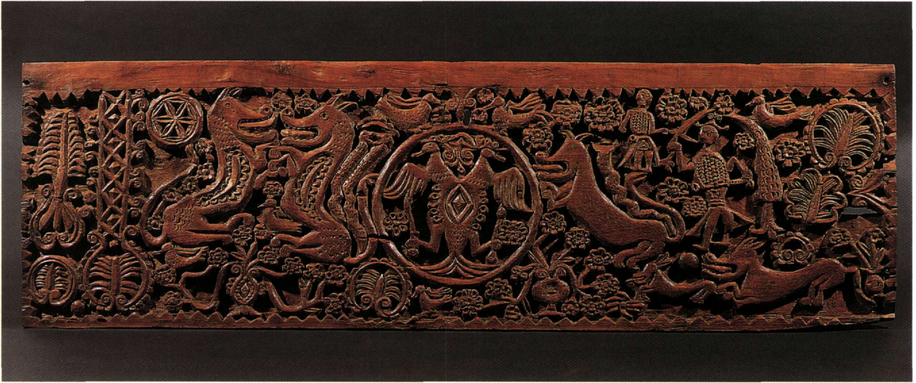
Fig. 7. Front section of a carved wooden chest. Athens, Benaki Museum 21777.

the semiologically dominant position of the narrative level, on the left and not on the right, because it overrides the "canon of hierarchy" which is respected even in folk art. 18 The same aberration is also a feature of the remarkable relief composition on a marble door frame of 1730 from Amorgos, where the female figure is flamboyantly glorified through her revealing nudity, in a manner far from common in the secular art of the era of the Ottoman occupation (figs 2-4). 19