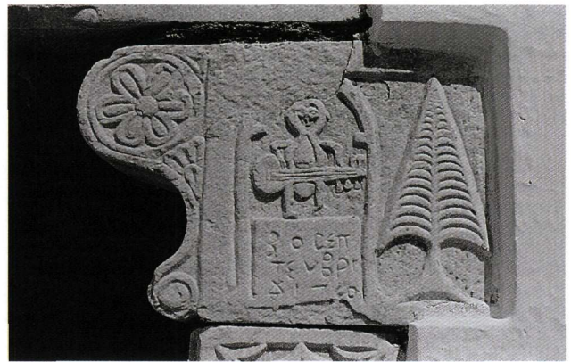
Fig. 2. Marble door frame of 1730, Amorgos (photo: G. Despotidis).

Also relevant is the significance of the two human figures who complete the representation, of which the one on the right projects its conceptual weight more obviously, both through its size and through its dominant frontal pose. This is a male figure with in his mouth a long pipe of the type which retained its popularity throughout of the War of Independence. 13 This iconographic detail is particularly significant, firstly because it provides a terminus ante quem no later than the first quarter of the 19th century, and also because it indicates a relaxed and tranquil situation, suggestive of the social superiority of the man portrayed, which is underlined by his wearing breeches instead of a fustanella (skirt), the more usual form of dress in the Peloponnese. 14 In the enigmatic "narrative" context of the rep-