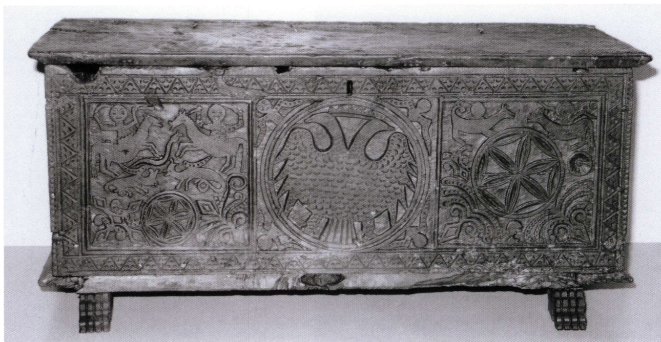
Fig. 11. Carved wooden chest. Nauplion, Peloponnesian Folklore Foundation 1989.09.0001.