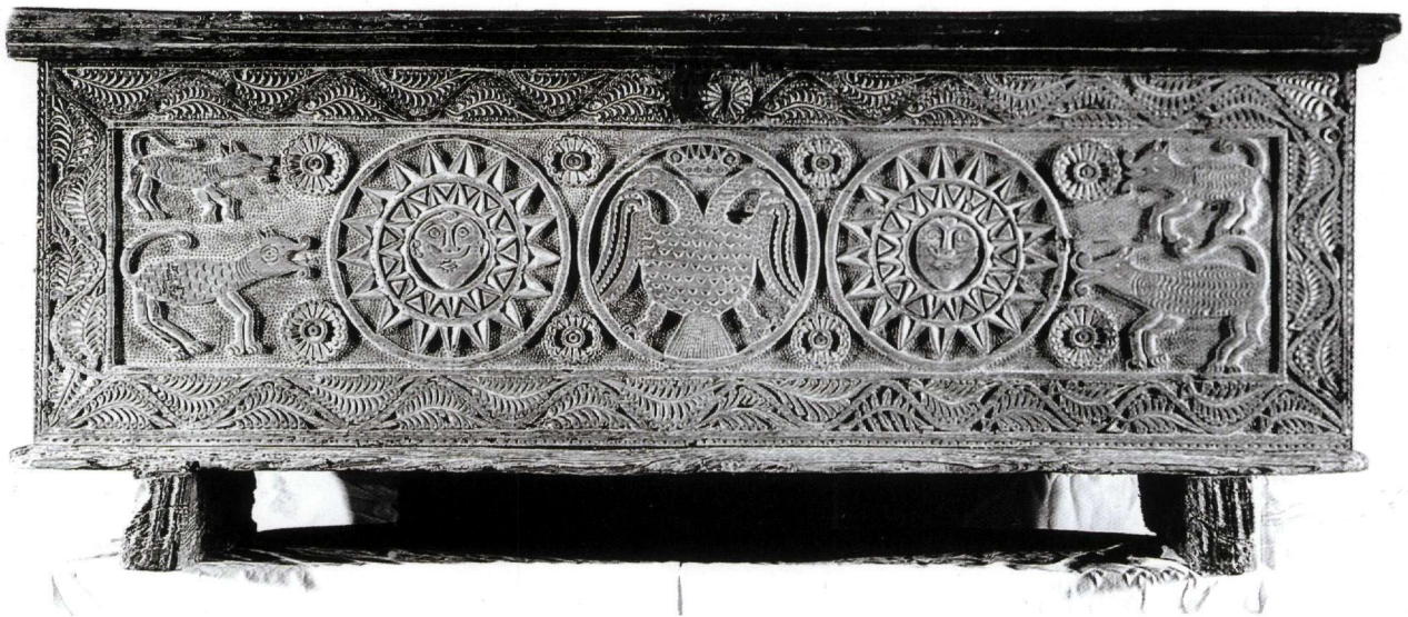
Fig. 13. Carved wooden chest. Athens, Alekos Eustathiadis Collection.