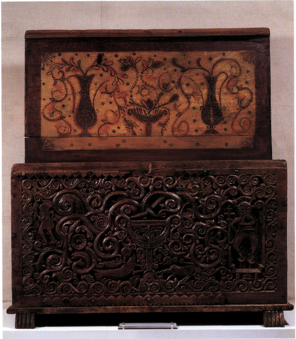
Fig. 1. Carved wooden chest. Athens, Benaki Museum 35496.