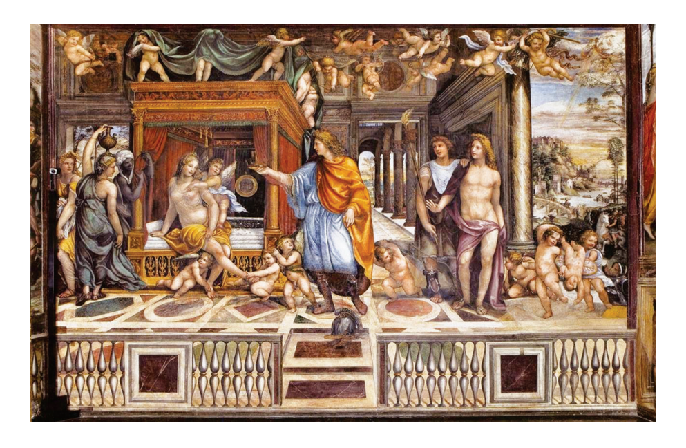
Fig. 2. Marriage of Alexander and Roxanne.