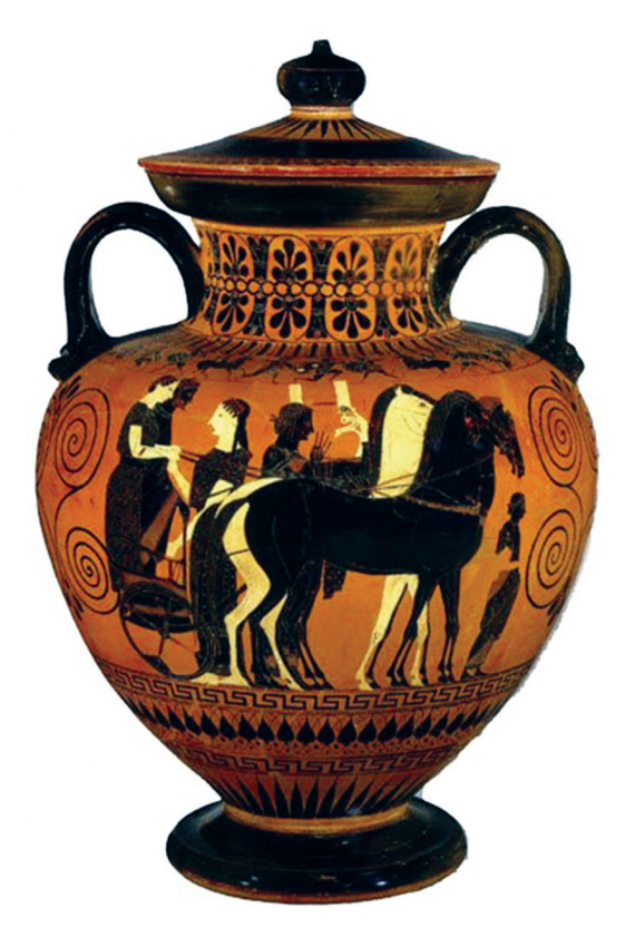
Fig. 3. A wedding procession. Neck-amphora, ca 540 B.C.; Archaic; black-figure attributed to Exekias (source: www. getty. edu/art/collection/objects/6998).