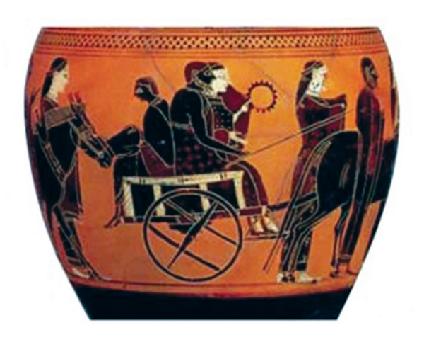
Fig. 4. A wedding carriage with the bride, the bridegroom and the parochus (An Attic black-figure vase, ca. 550 BC).