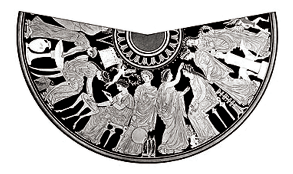
Fig. 1. Detail from the so-called Kerch lekanis: Drawings of the main scene, showing wedding preparations (A. Furtwängler – K. Reichhold, Griechische Vasenmalerei: Auswahl hervorragender Vasenbilder , München 1909. pl. 68.