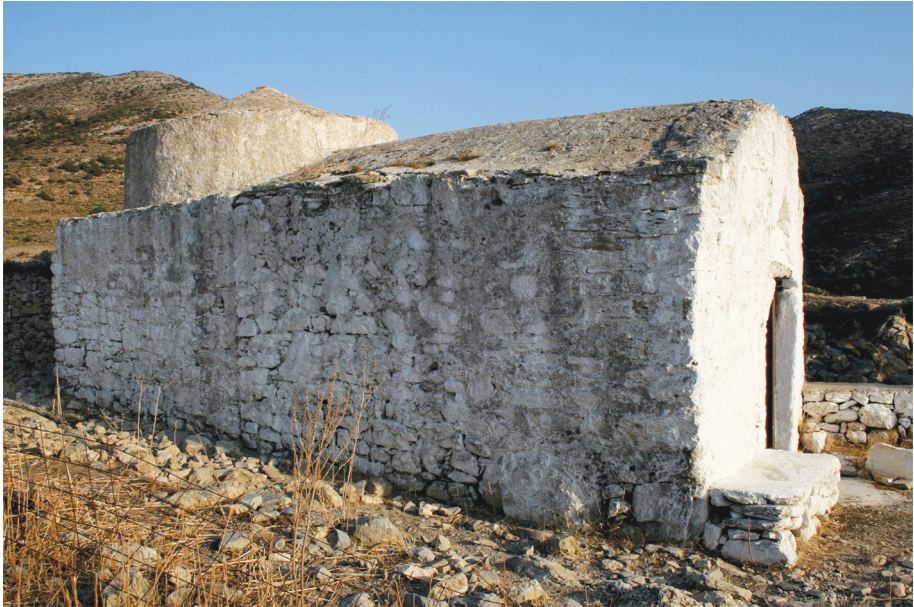
Fig. 1: Naxos, church of Panagia stes Yiallous, view from northwest