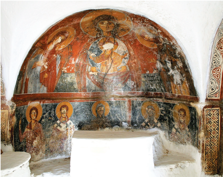
Fig. 3: Naxos, church of Panagia stes Yiallous, the fresco decoration of the apse, 1288/9