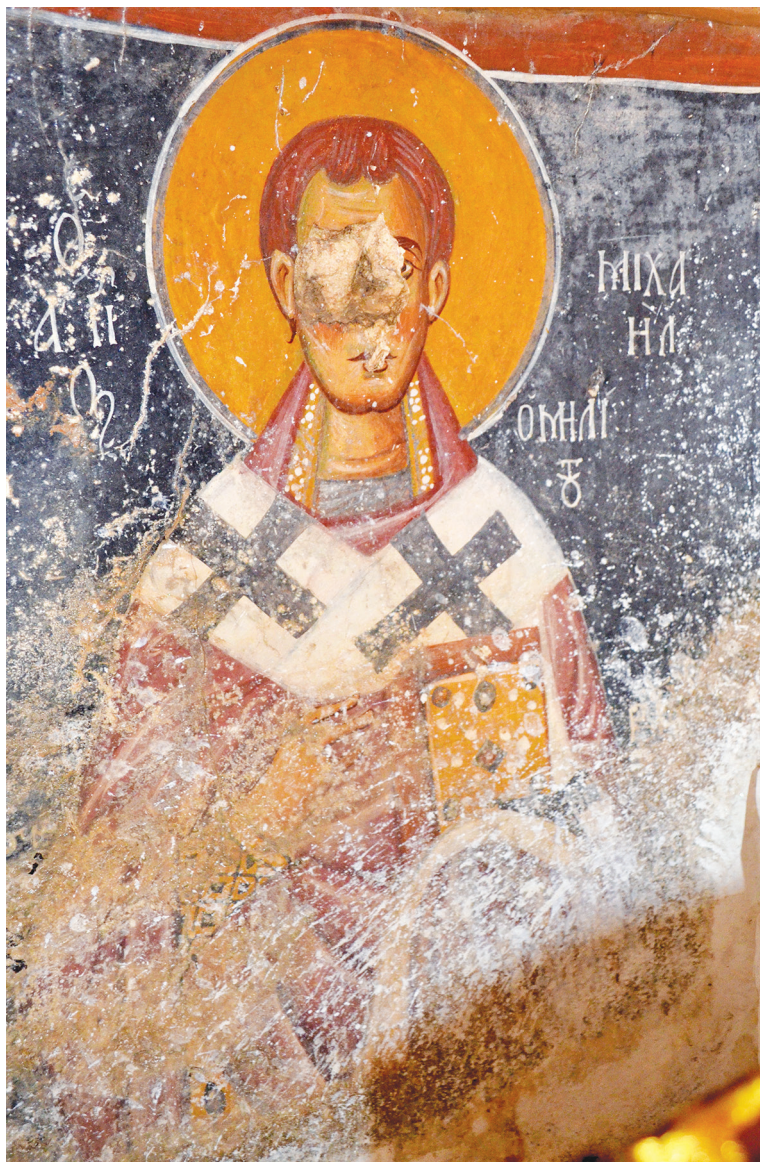
Fig. 12: Naxos, Panagia stes Yiallous, the semicircular wall of the apse, St. Michael of Miletus, 1288/9