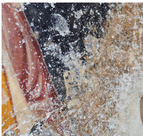
Fig. 11: Naxos, Panagia stes Yiallous, the semicircular wall of the apse, part of the dedicatory/ supplicatory inscription of Michael and Leonto Riaketa between the depictions of St. Michael of Miletus and St. Leontios the Younger, βίου αὐ[τοῦ]