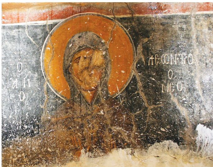
Fig. 14: Naxos, Panagia stes Yiallous, the semicircular wall of the apse, St. Leontios the Younger, 1288/9