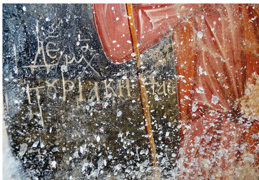
Fig. 9: Naxos, Panagia stes Yiallous, the semicircular wall of the apse, the first part of the dedicatory/ supplicatory inscription of Michael and Leonto Riaketa, Δε(ησις) Μιχα(ήλ) του Ριακήτα (καί)