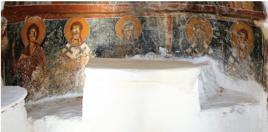
Fig. 4: Naxos, church of Panagia stes Yiallous, the semicircular wall of the apse, St. Mamas, St. Michael of Miletus, St. Leontios the Younger, St. Polycarpus, St. Eleftherios, 1288/9