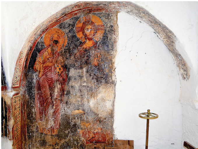
Fig. 6: Naxos, Panagia stes Yiallous, south tympanum, Christ Soter and St. John the Theologian praying to him, 1288/9