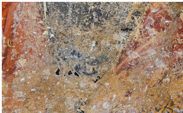
Fig. 10: Naxos, Panagia stes Yiallous, the semicircular wall of the apse, part of the dedicatory/ supplicatory inscription of Michael and Leonto Riaketa between the depiction of St. Mamas and St. Michal of Miletus, της συμ