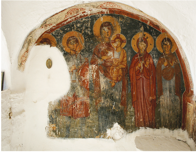
Fig. 5: Naxos, Panagia stes Yiallous, north tympanum, Virgin Pausolype and Child flanked by Sts. Paraskeve and Kyriake, St. Demetrios and an anonymous saint, 1288/9