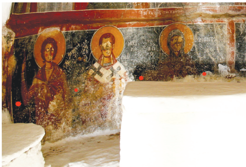
Fig. 8: Naxos, Panagia stes Yiallous, the semicircular wall of the apse, the dedicatory/ supplicatory inscription of Michael and Leonto Riaketa between the depictions of St. Mamas, St. Michael of Miletus, and St. Leontios the Younger, 1288/9