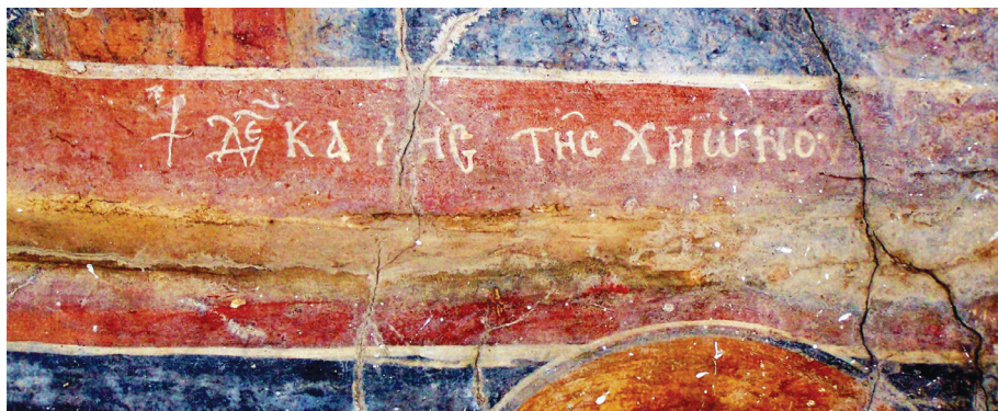
Fig. 7: Naxos, Panagia stes Yiallous, the dedicatory/supplicatory inscription of Kale tes Chionou in the narrow band that separates the semi-dome from the semicircular wall of the apse, 1288/9