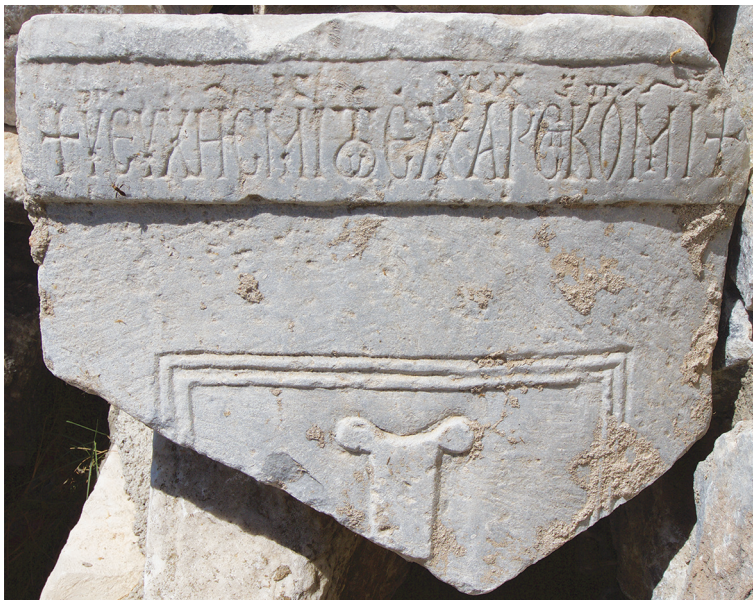
Fig. 13: Miletus, the dedicatory inscription on a marble pulpit with the reference on the archbishop Michael of Miletus, second half of the 11th c. – first half of the 12th c.