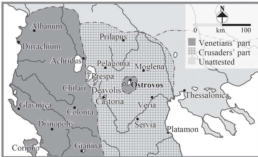
Fig. 3. A Venetian enclave in Ostrovo according to Longnon (adapted from LONGNON, Problèmes, 80 [map]; emphasis added).