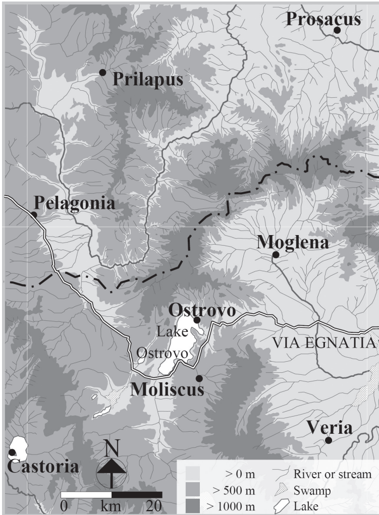
Fig. 4. Macedonian Ostrovo, Moliscus and Moglena (background adapted from the sheets 39°/41° Monastir, 40°/41° Vodena, 39°/40° Joannina, and 40°/40° Larisa of the 3rd Military Mapping Survey of Austria-Hungary; accessible through < http://lazarus.elte.hu/hun/digkonyv/topo/3felmeres.htm >).