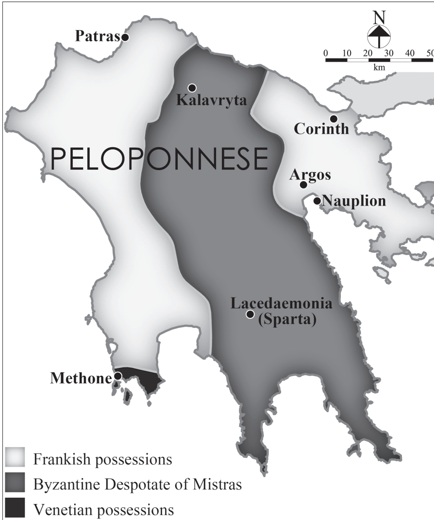
Fig. 1. Political division of Peloponnese ca. 1330 (adapted from STADTMÜLLER, Die Geschichte, map 6).