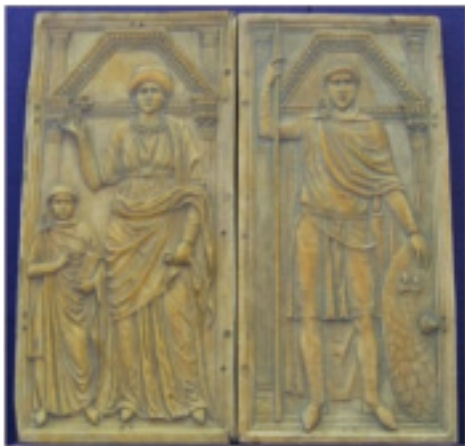
5. Ivory diptych of the Western generalissimo Stilicho with his wife Serena and son Eucherius (ca. 395 from Monza Cathedral).