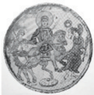
3. Fourth-century silver plate (Hermitage, St. Petersburg) depicting the Emperor Constantius II. In the military scene, the emperor is mounted and wielding a lance. He is being crowned by Winged Victory.