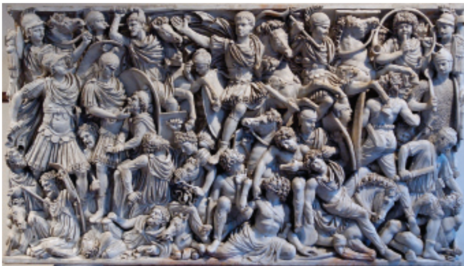
2. The third-century Grande Ludovisi sarcophagus (CE 251/252) in Rome's Museo Nazionale Romano, Palazzo Altemps.