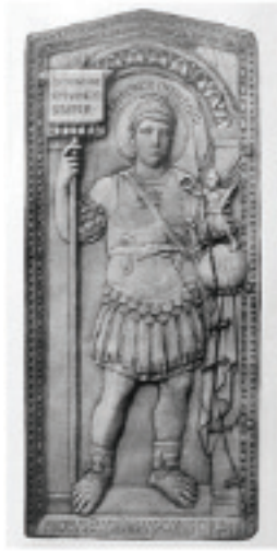
4. Probus diptych (Aosta Cathedral, Italy) depicting the Emperor Honorius in full military regalia. It probably commemorates a Roman victory over the Goths in 406.