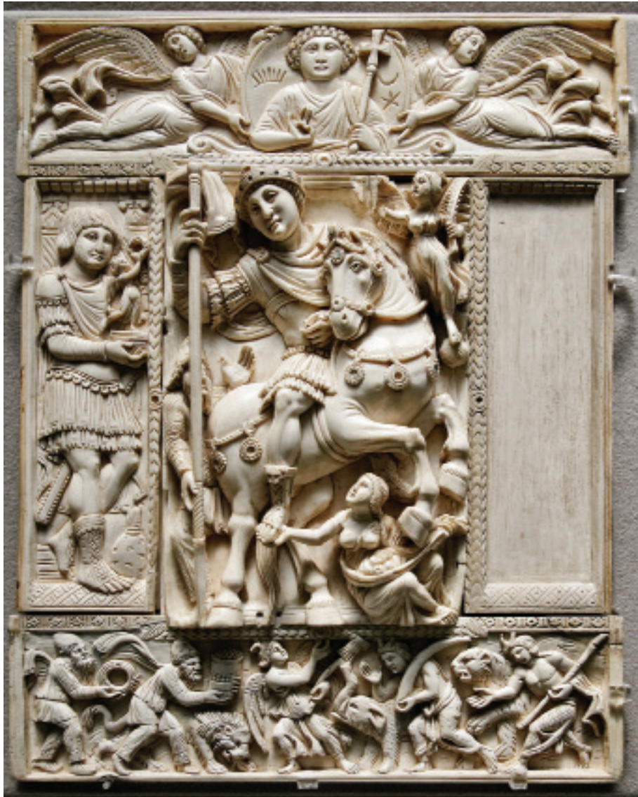
1. The Late fifth or early sixth-century Barberini ivory (Louvre, Paris) depicting a triumphant Roman emperor on horseback with a captive in tow. The emperor is probably Justinian, though Zeno and Anastasios I are also possibilities. The horse rears over the female personification of earth, whilst Winged Victory crowns the emperor. Beneath the rider, barbarians cower. On the side panels, soldiers carry miniature victories (source: wikimedia commons).