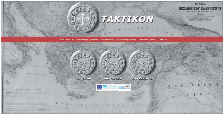
Table II: The front page of the online TAKTIKON