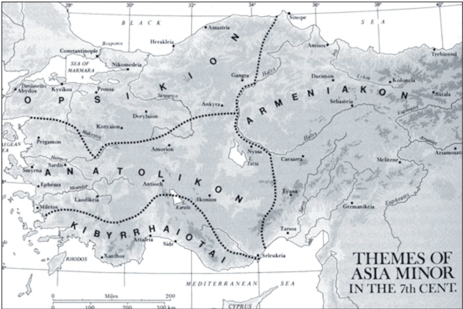
Table I: Themes in Asia Minor in the 7th c. (after ODB, vol. 3, 2034)