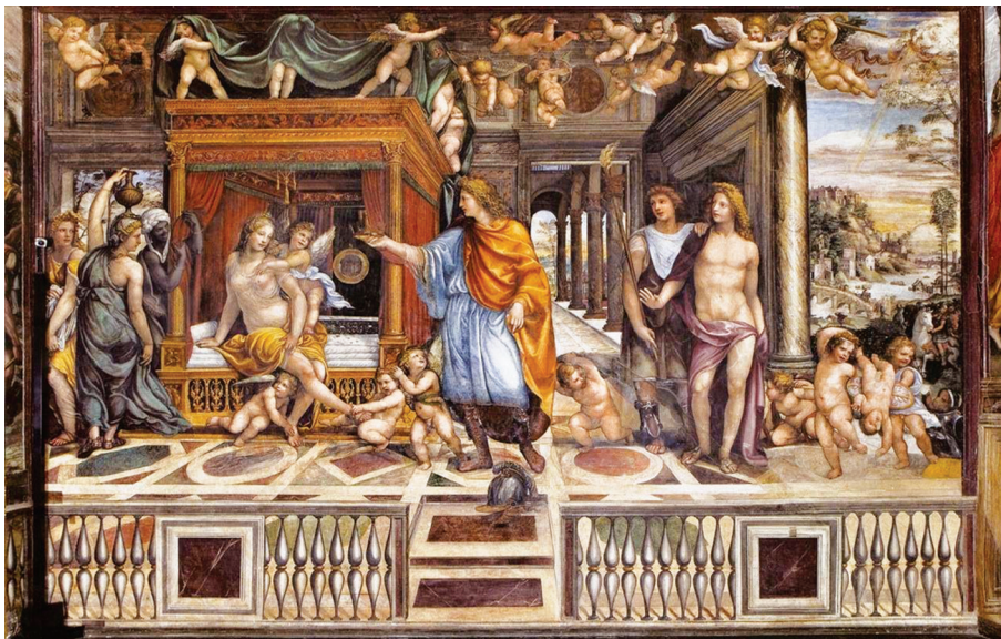
Fig. 2. Marriage of Alexander and Roxanne.