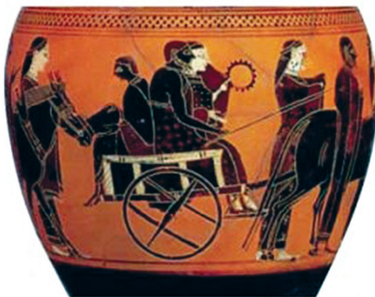
Fig. 4. A wedding carriage with the bride, the bridegroom and the parochus (An Attic black-figure vase, ca. 550 BC).