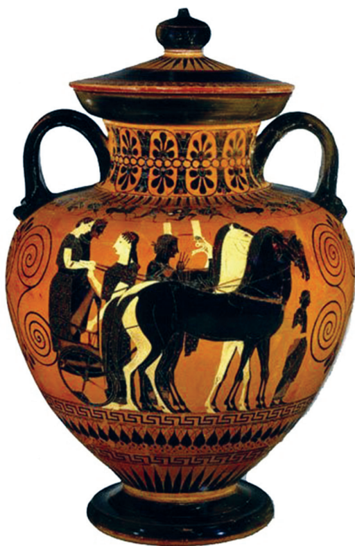
Fig. 3. A wedding procession. Neck-amphora, ca 540 B.C.; Archaic; black-figure attributed to Exekias.