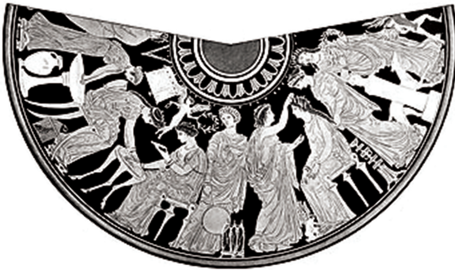
Fig. 1. Detail from the so-called Kerch lekanis: Drawings of the main scene, showing wedding preparations (A. FURTWÄNGLER – K. REICHOLD, Griechische Vasenmalerei: Auswahl hervorragender Vasenbilder , München 1909. pl. 68.