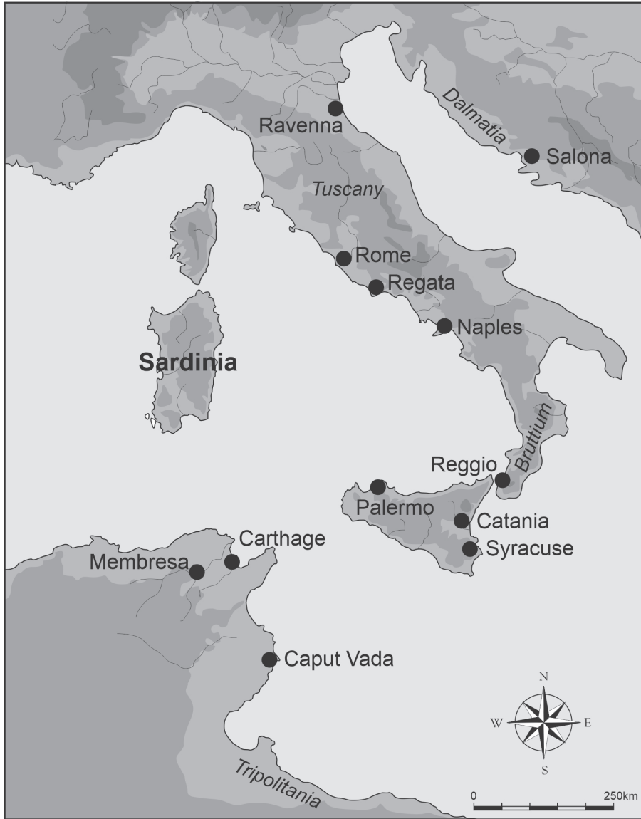
Figure 1. Principal cities and areas discussed.