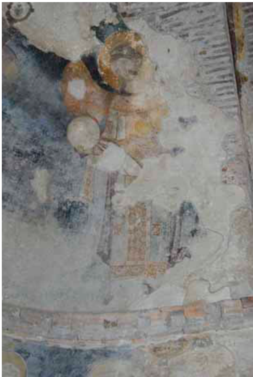
Fig. 1: Episkope Mastrou, Bema, apse.