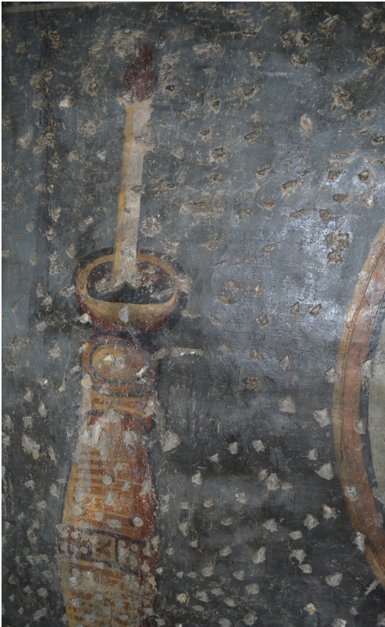
Fig. 8: Thessalonike, Theotokos Acheiropoietos, north wall of the south aisle, detail – candlestick with a lit candle.