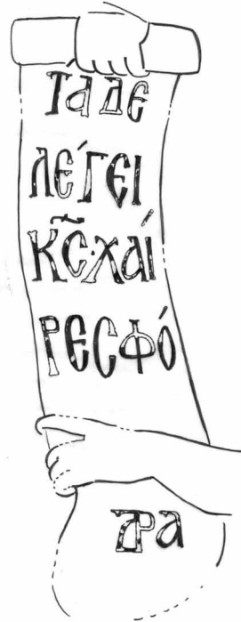
Draw 7: Zachariah (9:9) or Sophonias (3:14)