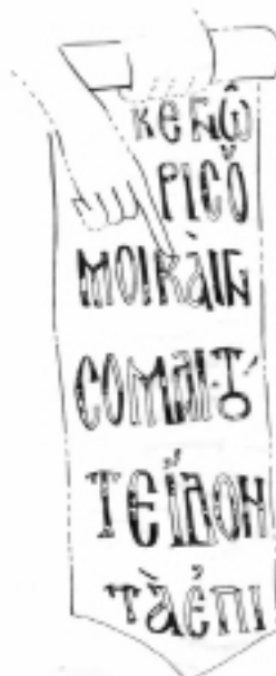
Draw 4: Jeremiah (11:18)