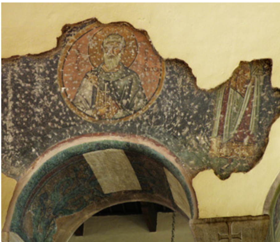
Fig. 7: Thessalonike, Theotokos Acheiropoietos, north wall of the south aisle, figures of the Forty Martyrs of Sebasteia, detail.