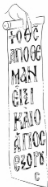
Draw 3: Habbakkuk (3:3)