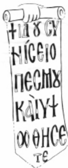
Draw 2: Isaiah (52:13)