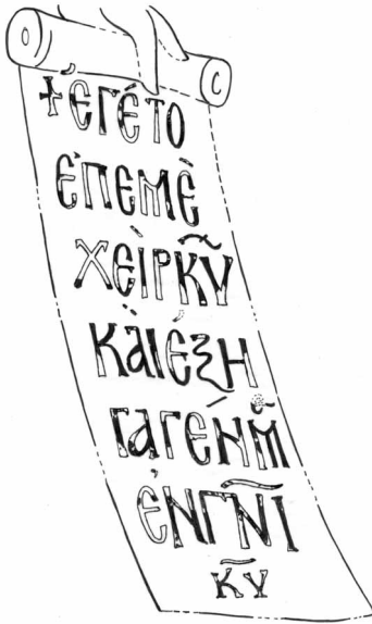
Draw 5: Ezekiel (37:1)