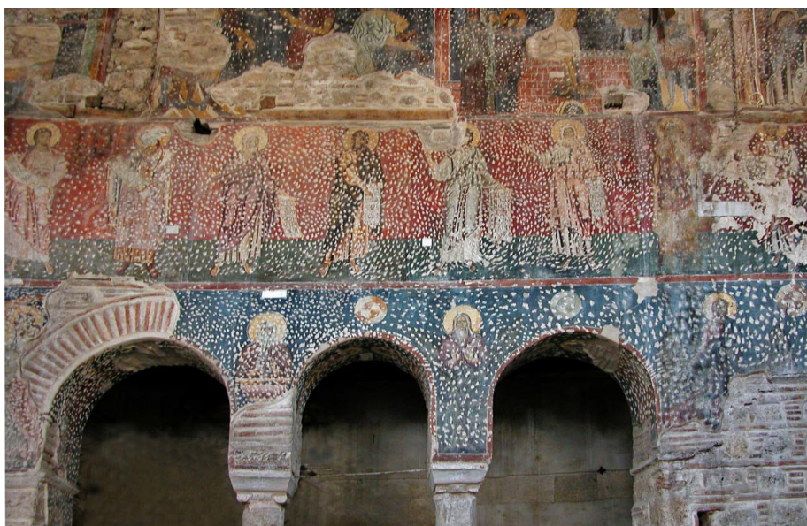
Fig. 5: Beroia, Old Metropolis, the second zone of the north wall of the nave.