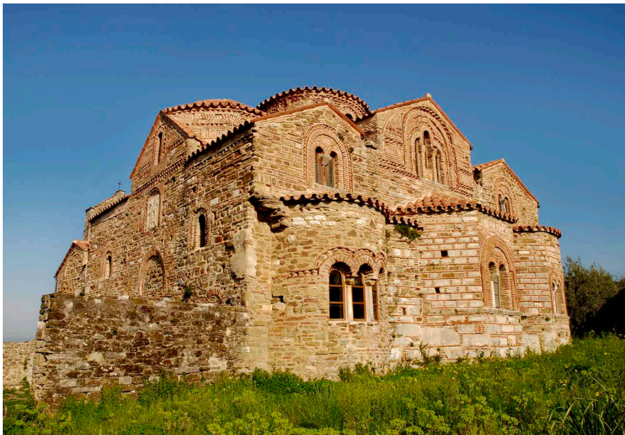
Fig. 2: Blacherna monastery near Arta, a view from the southwest.