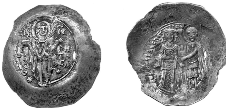
Fig. 3: Electrum trachy of Theodore Komnenos Doukas from National Museum in Belgrade.