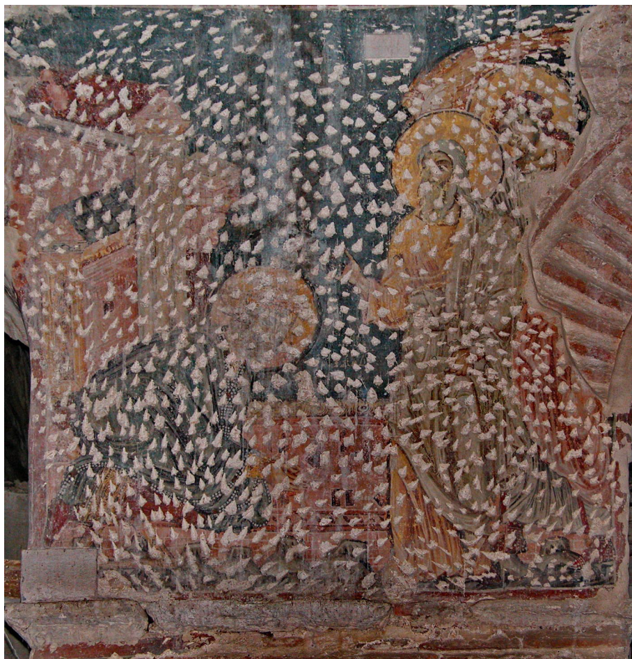
Fig. 6: Beroia, Old Metropolis, The repentance of David.