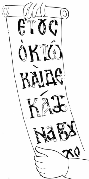
Draw 6: Daniel (3:1 or 4:4)