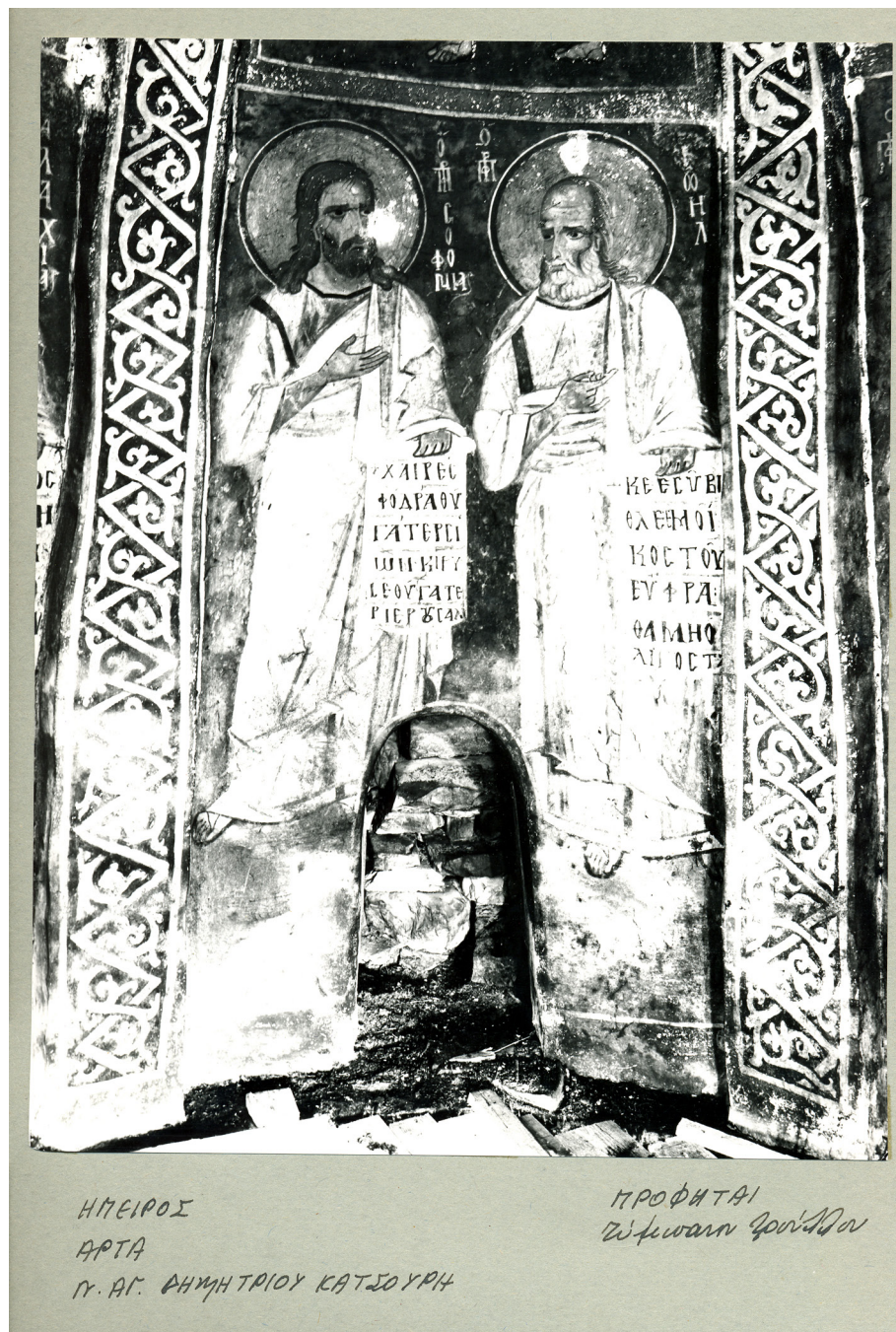
Fig. 4: St Demetrios Katsouris, near Arta. Dome, prophets Sophonias and Joel