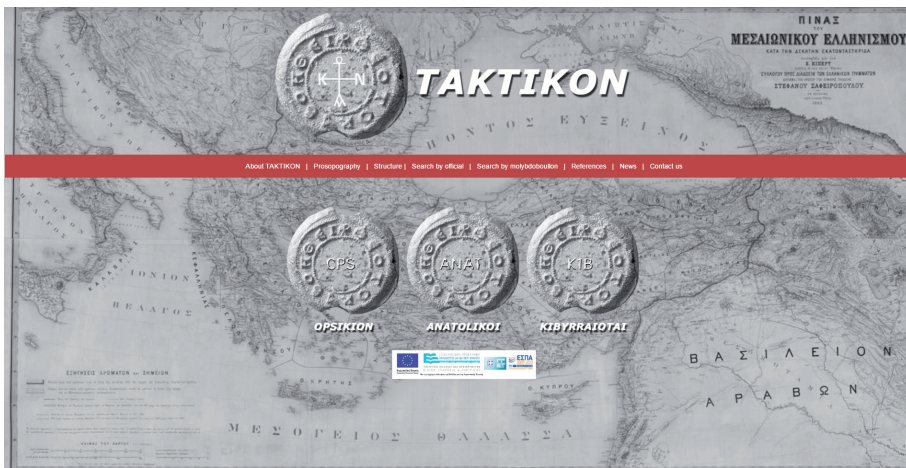
Table II: The front page of the online TAKTIKON