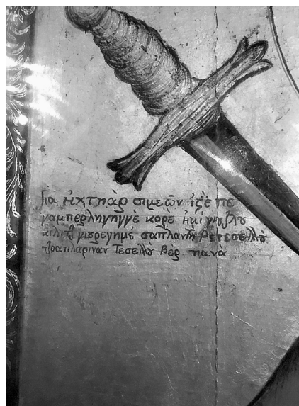
Icon from Sinassos, detail with Karamanli inscription.