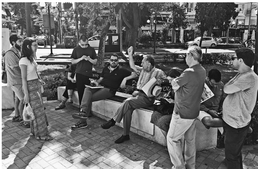
Seminar in front of the Asia Minor monument, Nea Philadelphia.