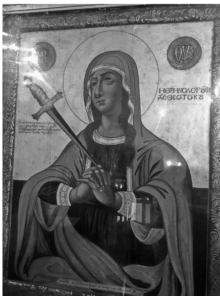
Icon from Sinassos.

The church of Saint Nicholas at the village was a depository of the ecclesiastical relics, vessels, and utensils created in the Ottoman Empire, and used in the Cappadocian village of Sinassos. Many icons and even some ecclesiastical furnishings were brought by refugee settlers from the exchange. The experience of seeing first-hand artifacts that local villagers preserved and carried with them as part of the traumatic migration gave immediate context to many of the files and documents that the students had been reading. The group also was received by the local association of Sinassos, and was offered hospitality in their meeting house. Mostly grandchildren of Sinassos refugees, they offered many accounts of the struggles in those early years of their forbears settling in the region.