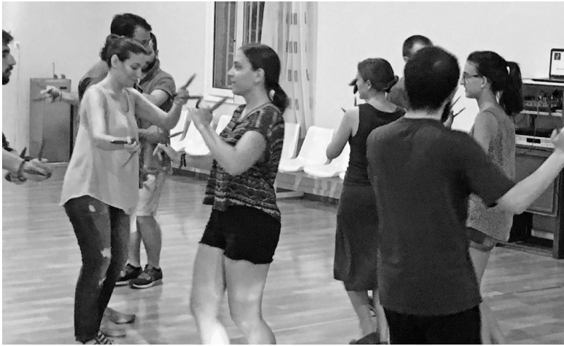
Learning Cappadocian Dances at Dora Stratou Theater Studios.