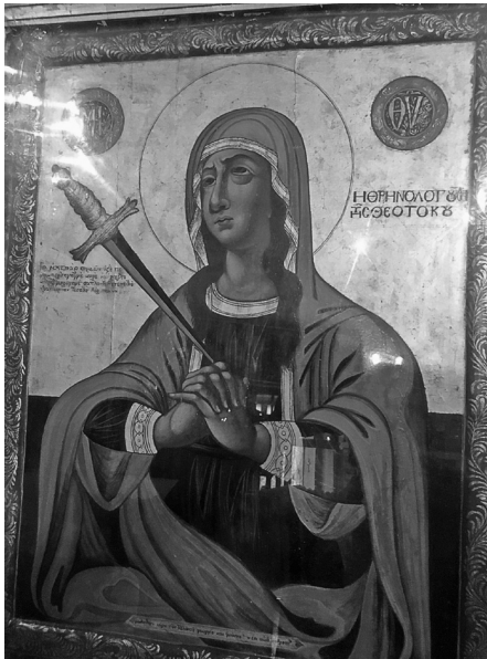
Icon from Sinassos.

The church of Saint Nicholas at the village was a depository of the ecclesiastical relics, vessels, and utensils created in the Ottoman Empire, and used in the Cappadocian village of Sinassos. Many icons and even some ecclesiastical furnishings were brought by refugee settlers from the exchange. The experience of seeing first-hand artifacts that local villagers preserved and carried with them as part of the traumatic migration gave immediate context to many of the files and documents that the students had been reading. The group also was received by the local association of Sinassos, and was offered hospitality in their meeting house. Mostly grandchildren of Sinassos refugees, they offered many accounts of the struggles in those early years of their forbears settling in the region.