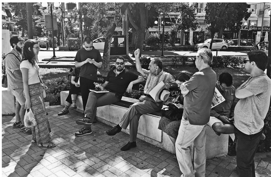
Seminar in front of the Asia Minor monument, Nea Philadelphia.