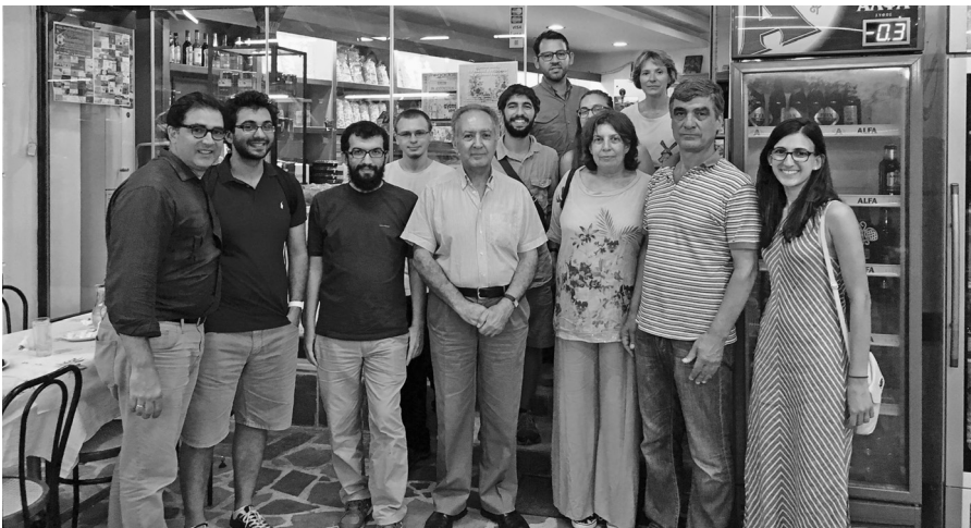
In Prokopi with descendants of refugees from Ürgüp.