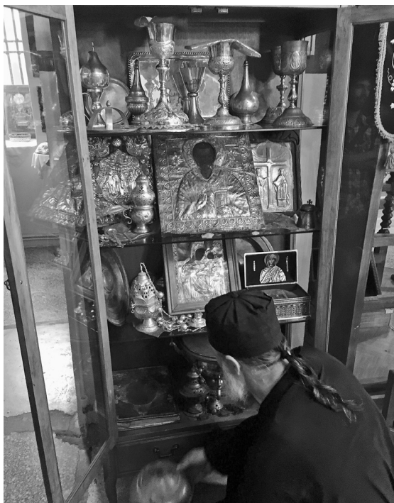
Priest with Church vessels and relics.