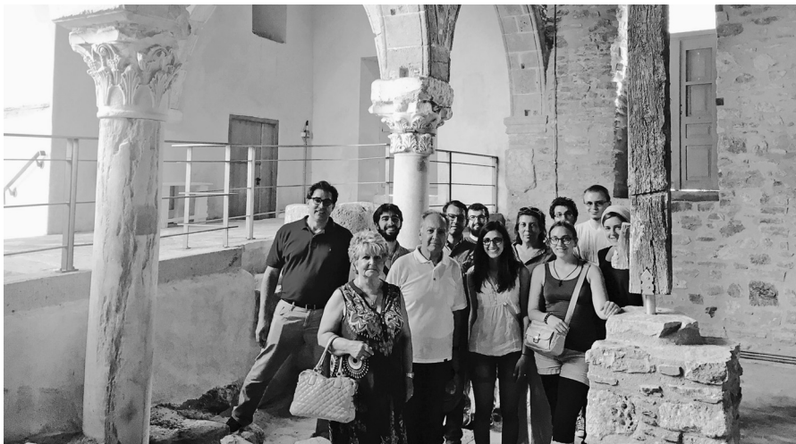
In Chalkida at the House of the Bailo.

the Archaeological Museum of Chalkida offered the Fellows a view of the multiple layers of culture that this region experienced.