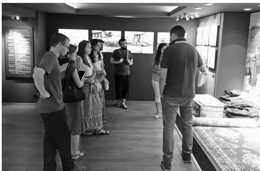
In the Refugee Museum of Nea Philadelphia.