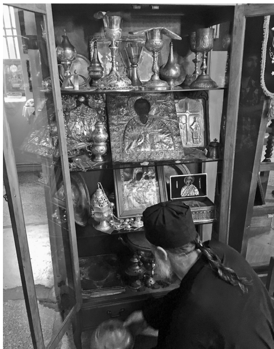
Priest with Church vessels and relics.