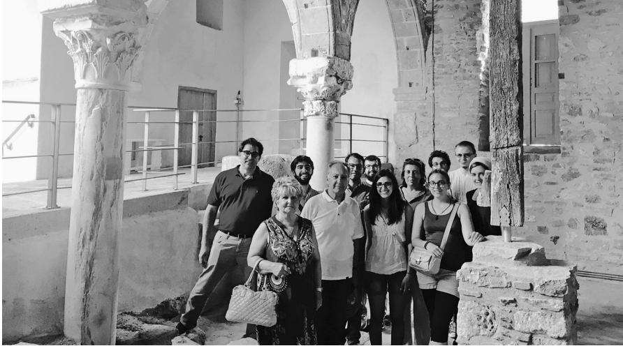
In Chalkida at the House of the Bailo.

the Archaeological Museum of Chalkida offered the Fellows a view of the multiple layers of culture that this region experienced.