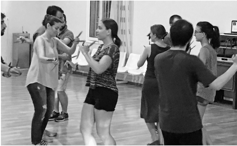
Learning Cappadocian Dances at Dora Stratou Theater Studios.