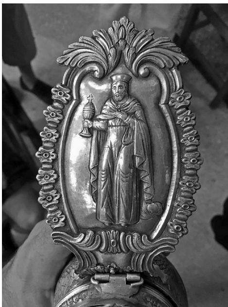
Church Vessel from Sinassos.