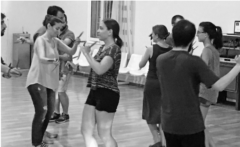
Learning Cappadocian Dances at Dora Stratou Theater Studios.