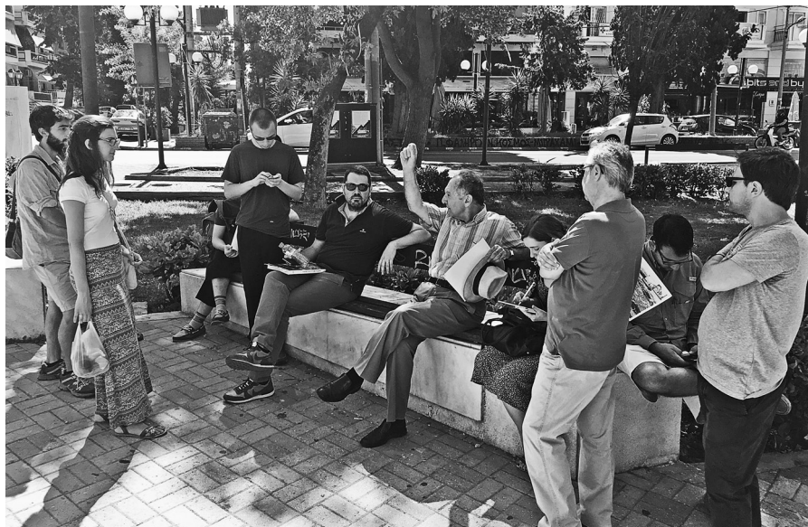
Seminar in front of the Asia Minor monument, Nea Philadelphia.