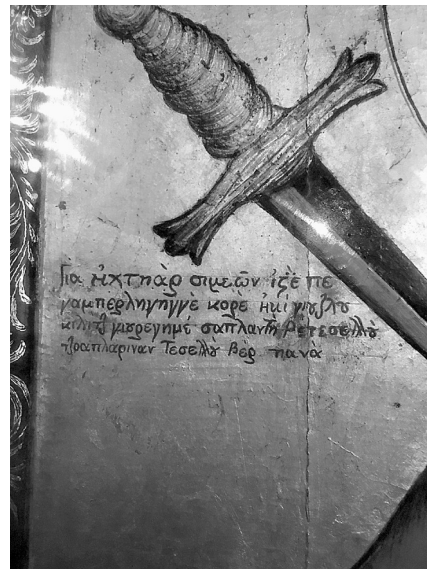
Icon from Sinassos, detail with Karamanli inscription.