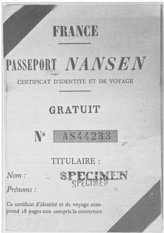
Fig. 2. A proofprint of the «Nansen Passeport» published in France. The passport was issued to Russians, and later to other refugees who were unable to get ordinary passports. The “Nansen Passeport” was issued on the initiative of F. Nansen in 1922, and was honored by the governments in 52 countries.