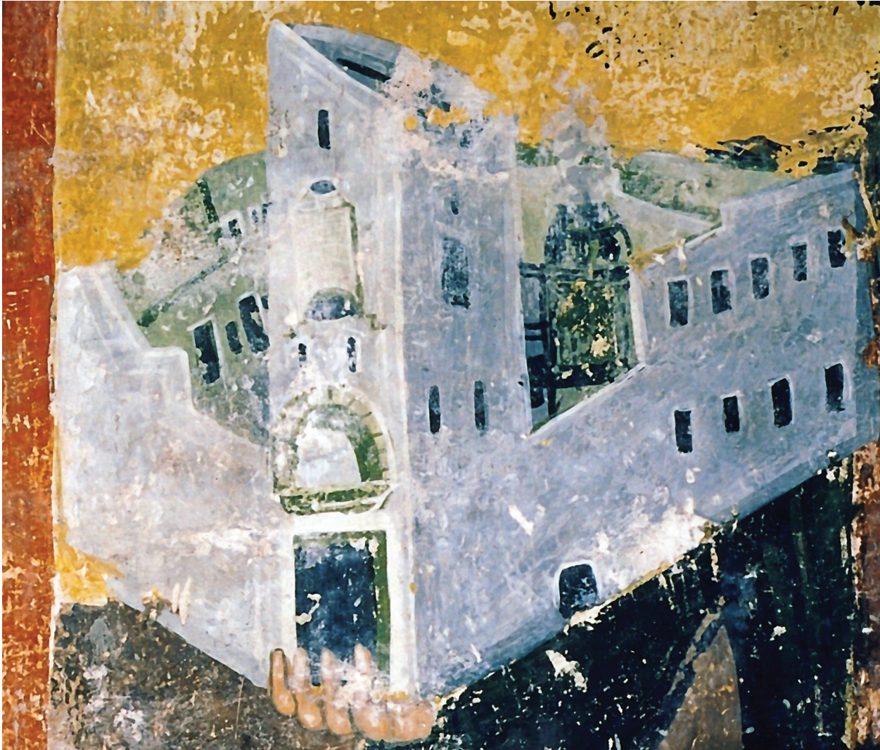
Fig. 12. Telos, katholikon of Hagios Panteleemon. Detail of the model of the katholikon offered by the donor Ionas (detail of Fig. 1).

with a masterful perspective view has provided every single feature of it. With an emphasis on the diagonal axis for depth and notion of the third dimension to the viewer, one can see the rectangular shape of the enclosure walls, the defensive tower which draws attention by being in the foreground and its peculiar diagonal roofing, the detailed rendering of the entrance's door jambs with the relieving arch over it, the circumference of the ramparts of the walls, the two-storey buildings with different-sized windows, and last but not least even a small auxiliary entrance on the south wall. Equally interesting is the monochromatic rendering of a tubular form