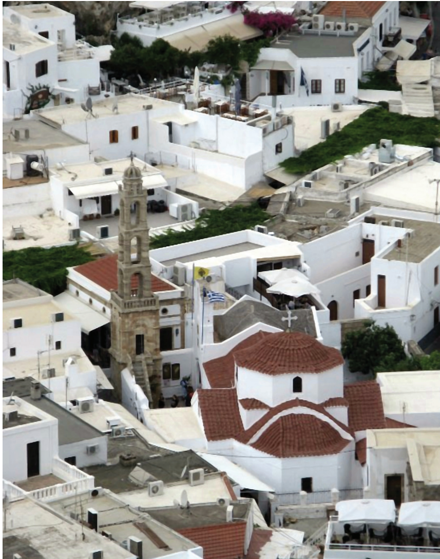
Fig. 11. Rhodes, Lindos. Panoramic view of the village looking West. At the centre the church of the Dormition of the Virgin.

that strongly suggests contemporaneity is evident in the central church of the village of Lindos, that of the Dormition of the Virgin (Fig. 11). Although its plan is different, a cruciform one, this does not affect the conception of