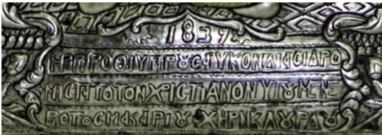
Fig. 3. Telos , katholikon of Hagios Panteleemon. The revetment's donor inscription (detail of Fig. 2).

When the revetment was removed a much different St. Panteleemon than the one described above was discovered. The painting, gesso layer on cloth and egg tempera, was in fairly good condition with the exception of just a few parts, including the edges of the upper corners and two large holes on the shoulders and lower parts of the torso where only a stripe of the painting has survived the effacement (Fig. 4). The losses were most probably caused by the revetment. The Saint is represented in a frontal half portrait, young, with his usual curly brown hair, and turning his torso slightly to the left. His head is encircled by a halo in ochre. Although the medical tools are repeated the same does not apply for his garments. Interestingly enough he is dressed in a manner which could be seen as resembling the appearance of a martyr, i.e. tunic and himation. The latter covers the torso and its right end is held by his left arm –which is also bearing the medical case– in a way that creates in front of his chest a series of super-positioned folds (Fig. 5). One noteworthy detail is that the salmon-red himation has a triangular cut under the right arm which allows the blue tunic to