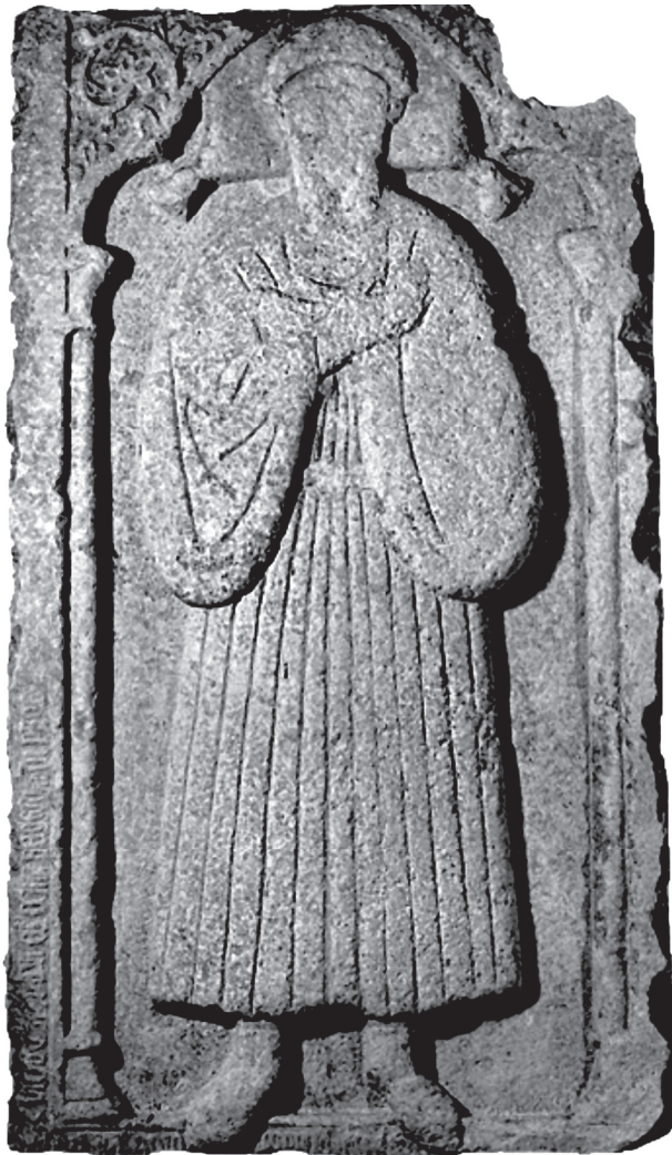
Fig. 8. Rhodes, Archaeological Museum. Sepulchral monument of a layman, ca. 1370-1380, Gray marble of Lardos.

attested on tombstones from the city of Rhodes dated in the last quarter of the 14th century (Fig. 8) 56 . This kinship is instructive about how these elements made their way into religious iconography and shows in the most meaningful way that they were appropriated within the cross-cultural artistic climate of the mixed society of the island.