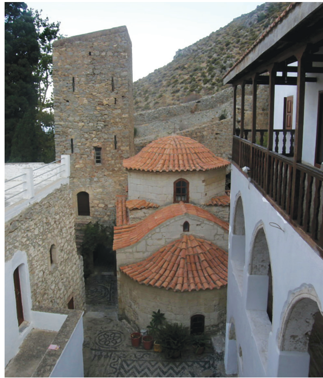
Fig. 10. Telos, monastery of Hagios Panteleemon. The east side of the katholikon; view looking West.

The architectural type used is one with which the countryside of Rhodes is littered in its eastern part, the greater Lindos area 72 . Analogous architectural vocabulary