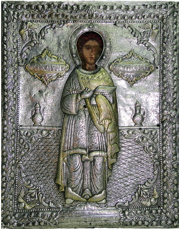
Fig. 2. Telos, katholikon of Hagios Panteleemon. The processional icon of Saint Panteleemon with the silver revetment.

senting the patron Saint in a full length portrait adorns the wooden carrier (Fig. 2). The Saint is set in front of an abstract scene with two pitchers to each side to denote the ground line. The upper half of the revetment is covered in tendril motifs and has on both sides of the figure's head two ornate frames with the tituli of the Saint, Ο ΑΓΙΟΣ ΠΑΝΤΕΛΕΥΜΟΝΑΣ. The lower half represents a tiled floor rendered diagonally. Heart-shaped flowers with acanthus leaves frame the floor sides. In all four corners putti complete the pictorial decoration. The border of the revetment is filled with the same type of tendrils as those described above, emerging from each of the four corners and covering half of each side until they meet. The Saint is represented as a young man holding medical tools, the long cruciform