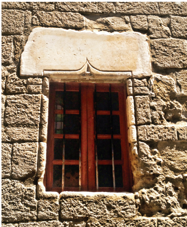
Fig. 13. Telos, katholikon of Hagios Panteleemon, South façade. The marble lintel of the window.

apart from a masterful realia view of rarely-depicted equipment, the decoupling of Ionas as the donor of the church comes naturally and the attribution of the rest of the monastic buildings to him backs up and particularizes the oral tradition 83 .