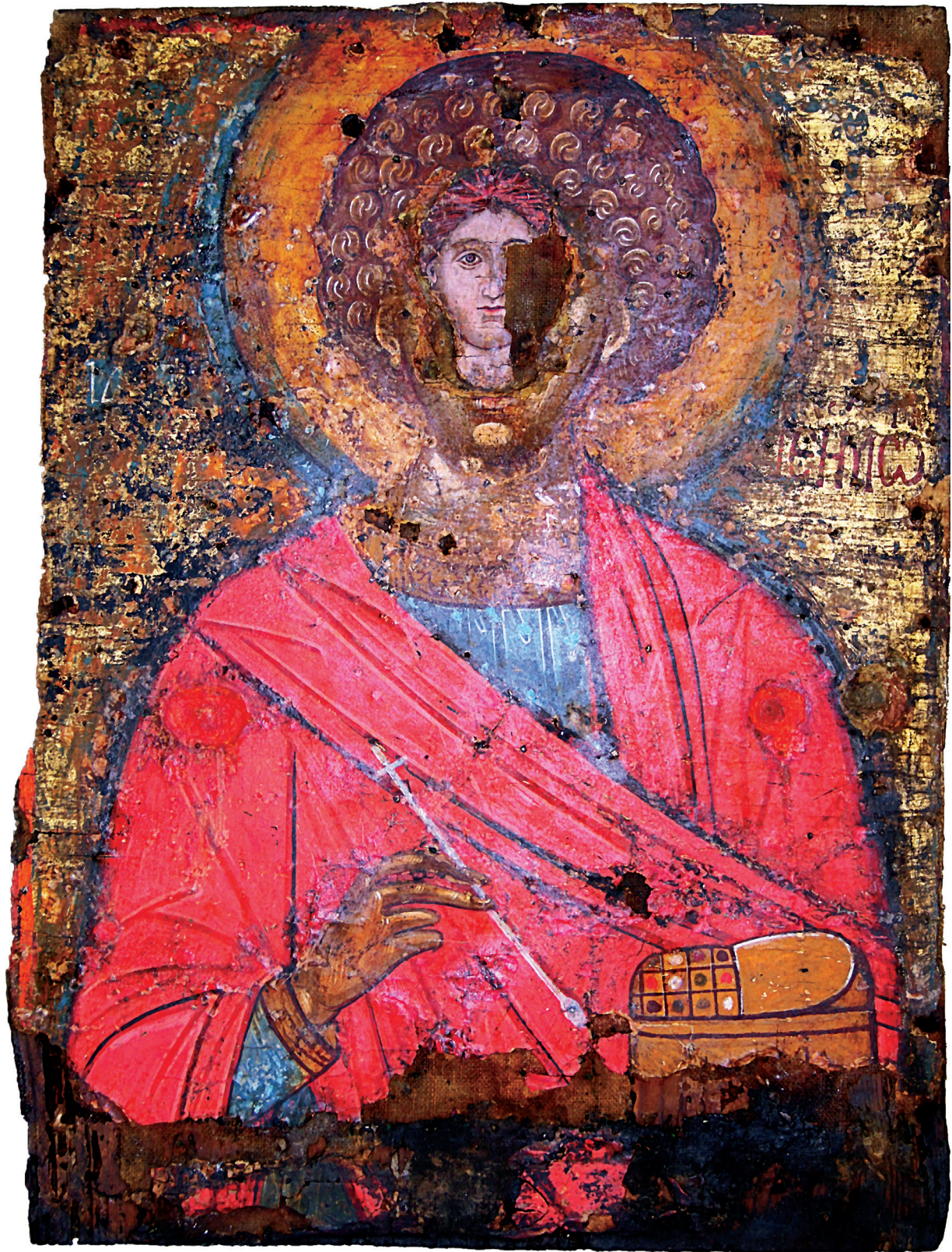
Fig. 5. Telos, katholikon of Hagios Panteleemon. The icon of Saint Panteleemon after the conservation treatment.