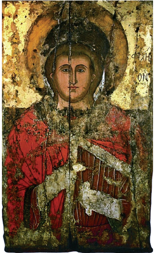
Fig. 7. Rhodes, Arnitha, monastery of Hagios Philemon. Icon of Saint Philemon.

help noticing that the type of dress –the way the tunic is presented with vertical tubular folds, the belt at his waist, the cloak over it and its articulation with rounded edges on the right side– has visual affinities with the fashion of secular attires worn by Western laymen, as