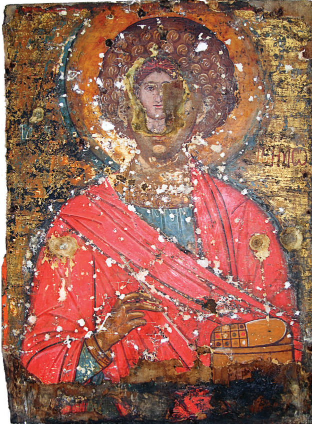
Fig. 4. Telos , katholikon of Hagios Panteleemon. The icon of Saint Panteleemon after the removal of the revetment.

be perceived? Is it the culmination of a series of changes which, in combination with the originality and creativity of the painter 13 , were setting a new trend in the Saint's iconography? Or is there another prism under which this change could be assessed? Before we proceed to answer these questions, it is important that we survey the basic points in the iconography of the Saint according to the pictorial evidence of Byzantine painting.