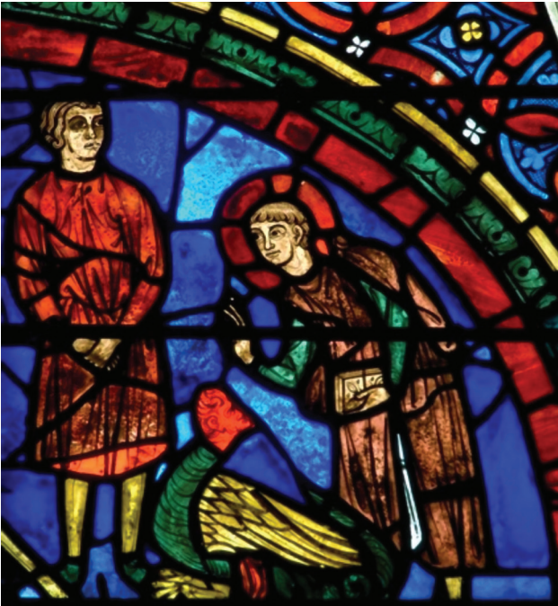
Fig. 9. France, cathedral of Chartres, northeast absidiole, glass panel of the lower window with the life of Saint Pantaleon. Saint Pantaleon with the bird, ca. 1206.

“simple” format of the garments does provide a hint about the nucleus of the inspiration for the Telos and Monolithos icons, which could be thought to draw from a side representation of a vita cycle instead of a frontal portrait. Yet one minor detail that could, nevertheless, pinpoint some kind of alien dependence is the triangular cut the himation of Panteleemon has at its lower part. The garment of St. Pantaleon in the glass panel with the bird from the Cathedral of Chartres (Fig. 9) has an analogous rendering with triangular openings for the sleeves, a detail that, if nothing else, raises questions about the origin of the above detail in the Telos icon. Taking all the previous into account we could assert that the painter of the Telos icon intended to recall a specific model with the garments of Panteleemon, if not drawing inspiration from an unknown vita cycle of his which could have been latent on the island 61 .