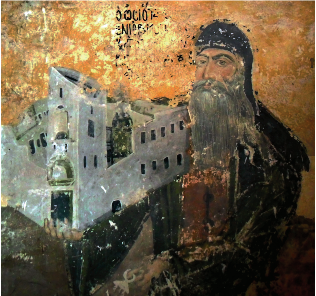
Fig. 1. Telos, katholikon of Hagios Panteleemon, south wall. Donor portrait of Ionas offering the monastery.

is also explored offering insights which concern the possible benefactor of the church of the monastery. This overall evaluation helps us to contextualise the religious configurations of such a development within the frame of the late 15th century.