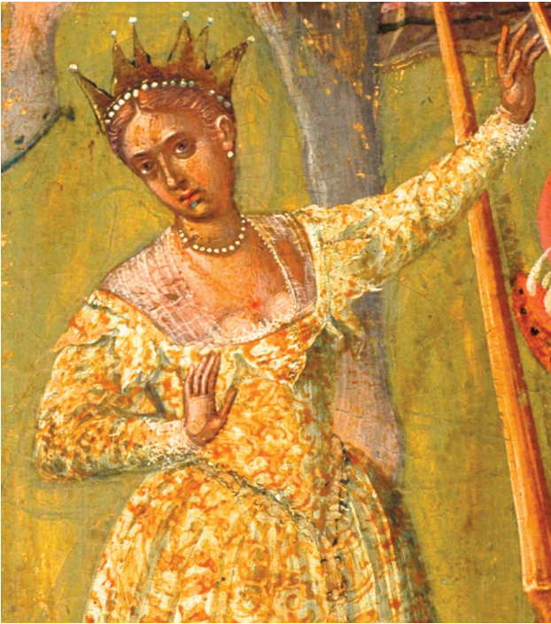
Fig. 5. The Princess (detail of Fig. 1).