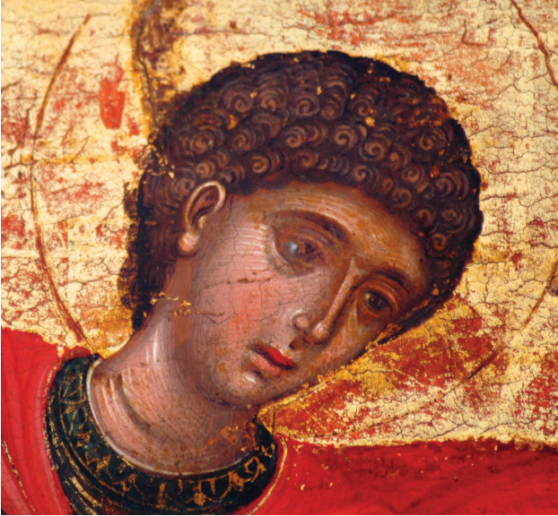
Fig. 4. St. George (detail of Fig. 1).

In conclusion, then, this particular combination of episodes from the Life of St. George, and therefore the iconographic schema as a whole, is not foreign to the Byzantine tradition. With the exception of the theme of the young slave, the icon is directly connected with the portable icon on the same subject in the Byzantine Museum in Athens, which is attributed to George Klontzas 27 (Fig. 3). In the latter, the central theme is further developed through the addition of individual episodes, though this does not detract from the creative similarity of these two works. Also, another connection may be observed with an iconographically similar icon in the Benaki Museum which bears the signature of George Klontzas 28 . As for the stylistic features of the icon under discussion, in the rendering of the bodies an attempt to achieve a symmetrical representation may be observed, although this is confined to the depiction of each individual figure and its relation to space, and does not extend to