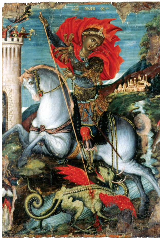
Fig. 2. Athens, Benaki Museum. George Klontzas, icon of St. George.

dragon occur in the portable icon on the same subject in the icon at the Benaki Museum 19 (Fig. 2), and in the Byzantine Museum in Athens (though the posture is different) (Fig. 3), also both works by George Klontzas.