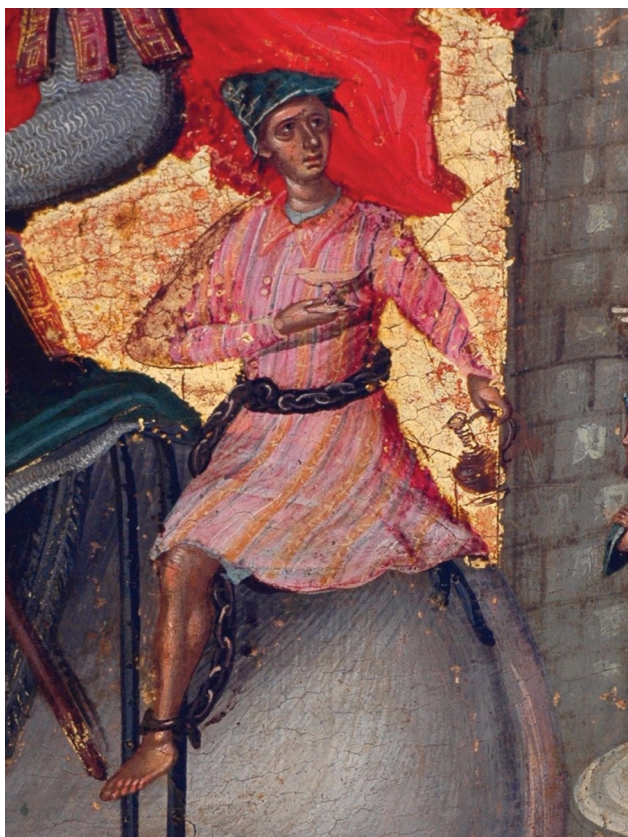
Fig. 8. The young liberated slave (detail of Fig. 1).

the style of dress, recalls contemporary works by Dirck Barendsz 50 (1584) and Hendrick Goltzius 51 (1584), where similar details may be observed in the style and design.