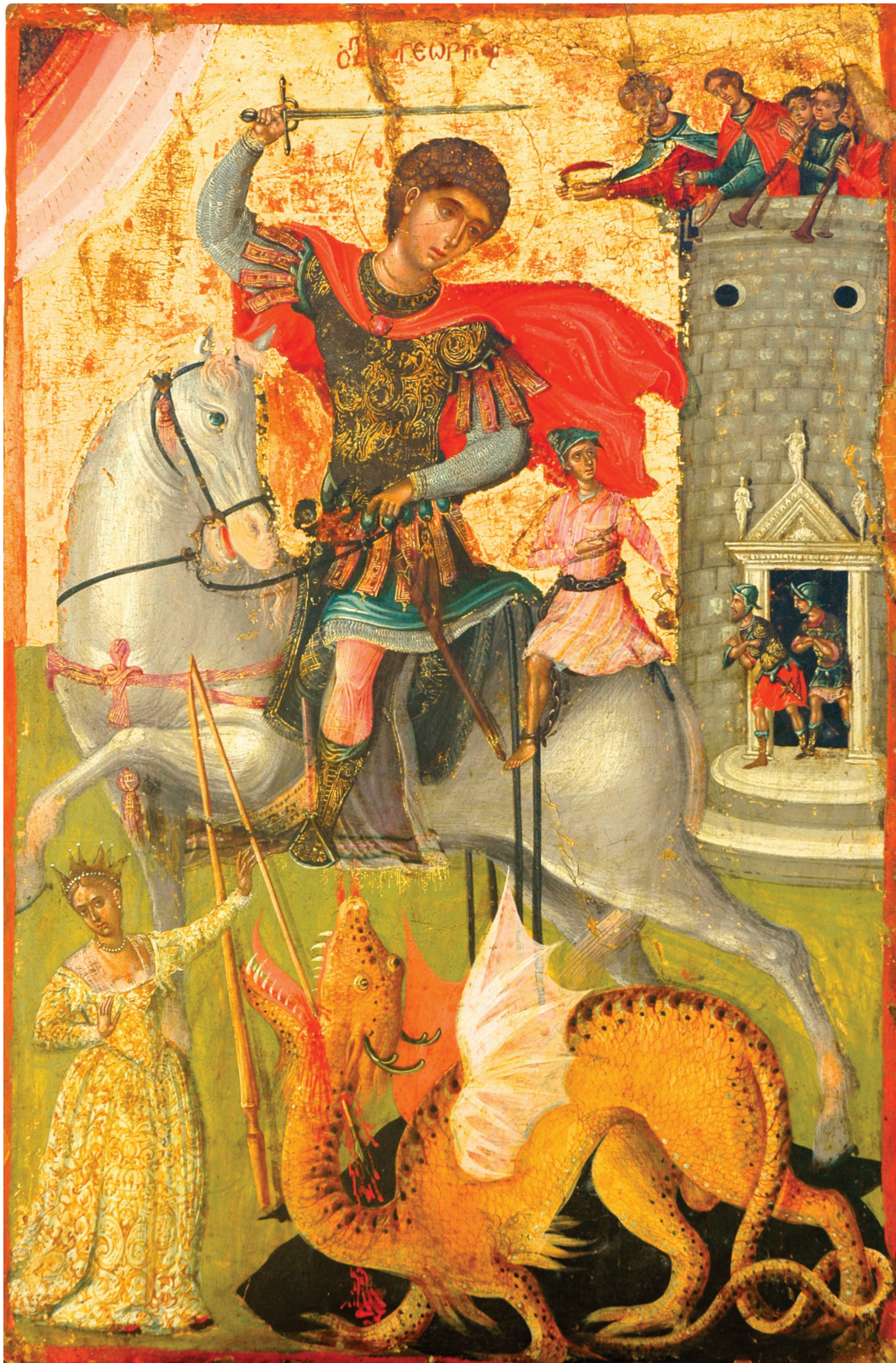
Fig. 1. Corfu, church of Aghioi Pateres. Icon of St. George.