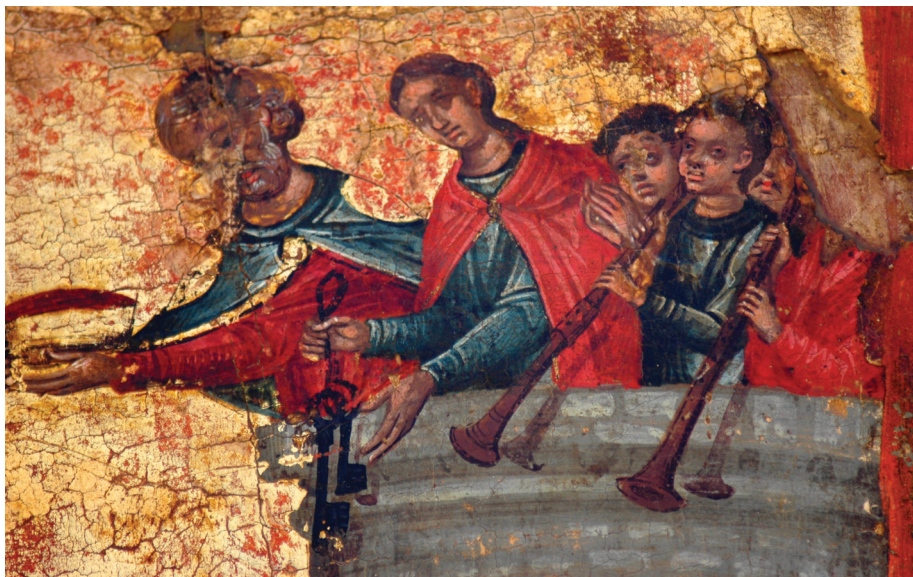
Fig. 7. The offer of the crown and of the city keys to St. George (detail of Fig. 1).

The painter has also taken special care in the rendering of the figures' garments. On the whole, the drapery is rich and lends emphasis to the body. The folds create an impression of liveliness with their undulating curves and the occasional roundness and naturalness of the design.