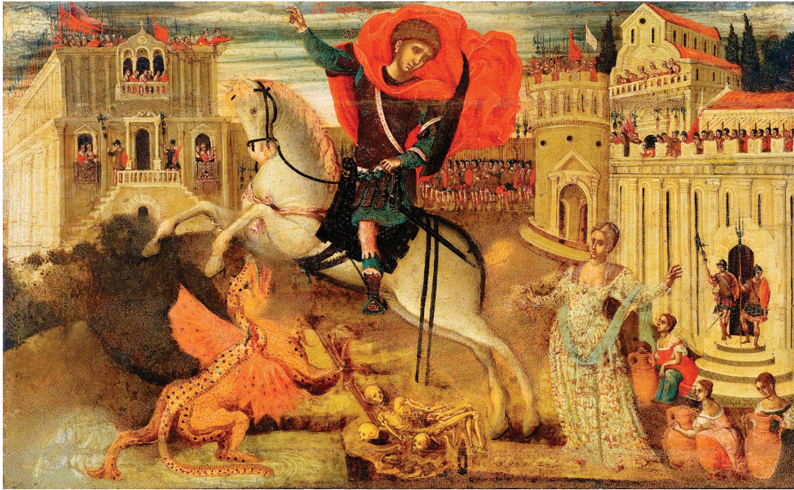
Fig. 3. Athens, Byzantine and Christian Museum. George Klontzas (attr.), icon of St. George.

century 21 , this particular iconographical type of the slave, particularly in respect to his attire, does not appear to have become widely established.