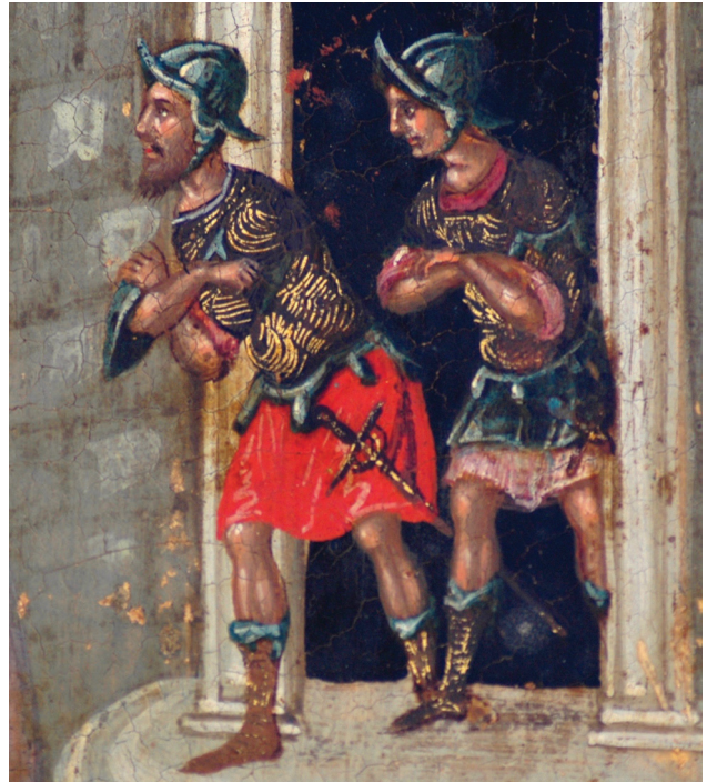
Fig. 6. Soldiers (detail of Fig. 1).

way, and these too recall works by George Klontzas 35 . Of the figures portrayed on the battlements, the most remarkable is that of the young musician in the middle of the group, of whom only the head is visible (Fig. 7). The different design and facial features of this figure, together with the plasticity of the modelling, produce a depiction which it is tempting to assume shares a common starting-point or common model and artistic preoccupations with similar figures of children in the works of painters like Jacopo Bassano 36 , Jacopo Robusti (Tintoretto) 37 and Domenikos Theotokopoulos 38 .