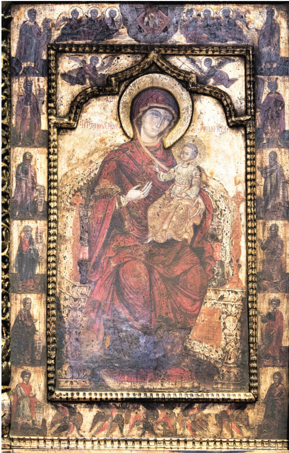
Fig. 8. Filipeștii de Pădure, Three Hierarchs church. Mother of God, 1691-1692.