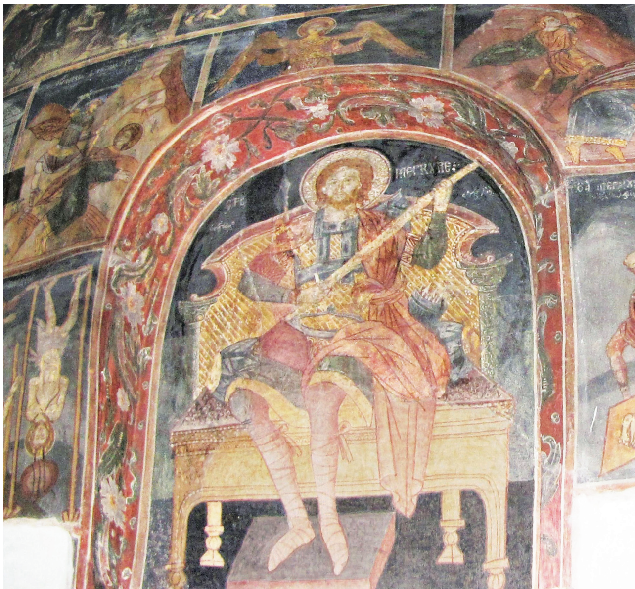
Fig. 5. Plătărești, Monastery of St Mercurius, narthex. The patron saint Mercurius, 1649.

“Gheorghe the Greek” 26 , was also a Macedonian, probably a northern one, since the term “Vlach” mentioned in the inscription was never used by Romanians with respect