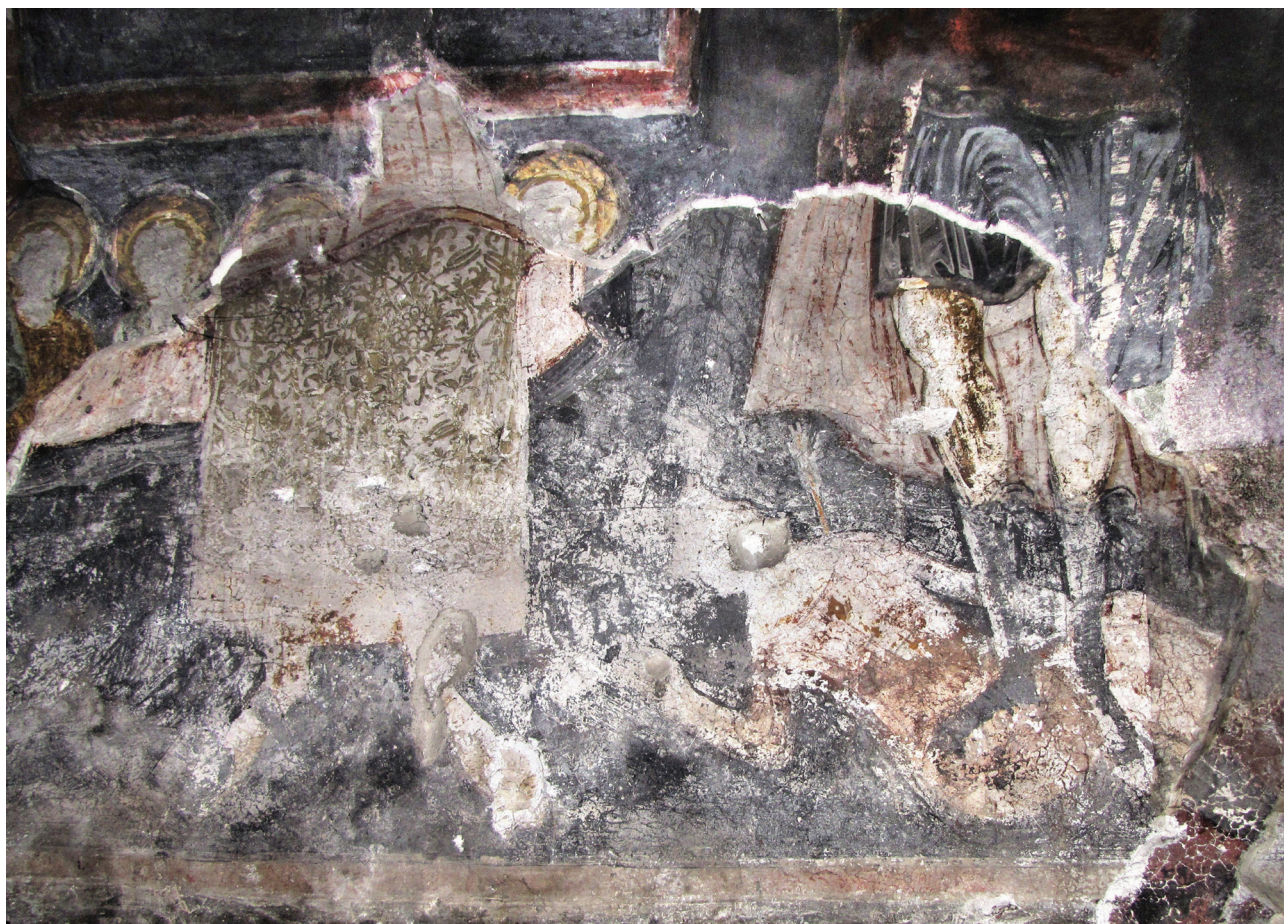
Fig. 11. Strehia Monastery, nave. Military saints (detail).

stylistic similarities with the ones at Plătărești and Berestovo (Figs 14-16). Ioannis and Georgios seem to have a robust style and their design, although sometimes clumsy, preserves classical reminiscences. The votive portraits in the narthex at Clocociov appear stylistically very close to those at Plătărești, and the inscriptions of the votive portraits were written apparently by the same hand, in Romanian, in both monuments. It is likely that the church of the Clocociov Monastery was also painted by a team led by the brothers Ioannis and Georgios. Both at Clocociov and Plătărești they must have worked with local apprentices, who wrote the inscriptions in Romanian. The church of St Michael the Archangel of the Clocociov Monastery, dated to 1645, is a foundation of agha Diicu Buicescu, a cousin of Voivode Matthew Basarab. His kinship and close relationship with the ruler may have given him the access to the two painters. Clocociov is not