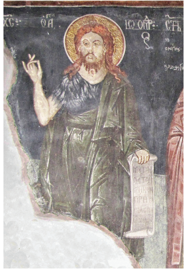
Fig. 9. Plătărești Monastery, narthex. St John the Baptist, St Anthony the Great, St Euthymius the Great, St Sabbas the Sanctified.

Monastery, a similar representation was painted by two North-western Greek artists, Mattheos and Ioannis, in 1660 31 (Fig. 13). This military iconography flourished in the seventeenth century with the hands of the Greek painters who decorated the Wallachian and Moldavian princely foundations 32 . The anti-Ottoman politics of the Wallachian voivode Matthew Basarab seems to be reflected symptomatically in the choice of predominantly