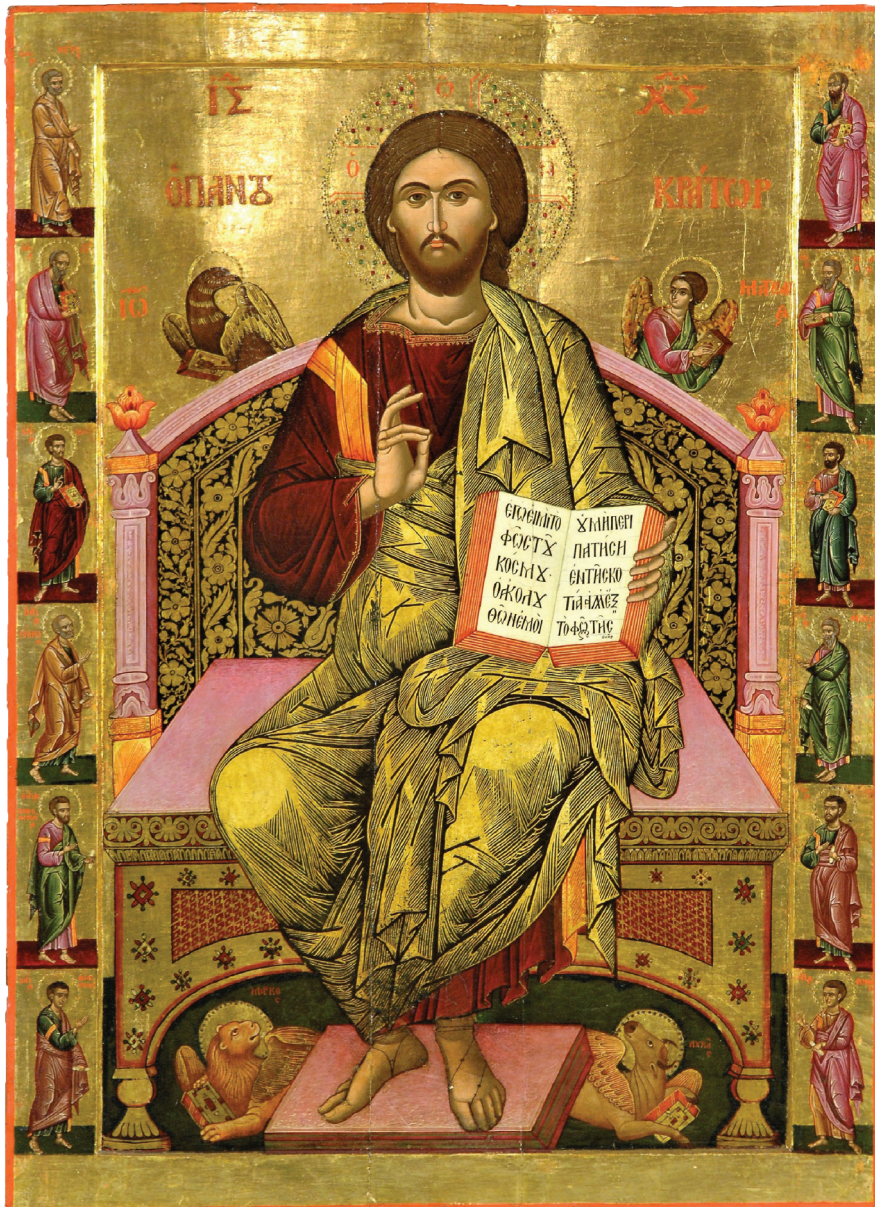
Fig. 20. National Museum of Art, Bucharest. Christ icon from Cotroceni Monastery, 1683.