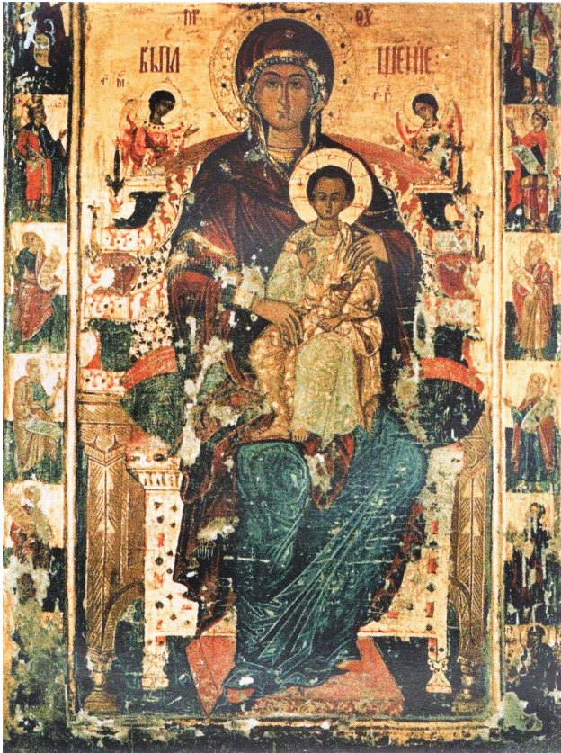
Fig. 6. Băjești. Church of Dormition of Mother of God. Mother of God icon, 1669.