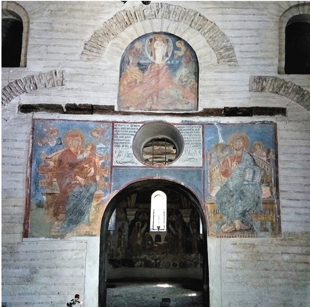
Fig. 1. Berestovo, Church of the Saviour, the entrance to the nave. Mother of God and Christ on throne.

Pârvu Mutu or/and his associates 17 (Fig. 8). This type of the Virgin of the Passion seated on the throne, differing from the much more widespread bust variants, was seemingly common among painters of Western Macedonia 18 and subsequently entered Wallachia as well.