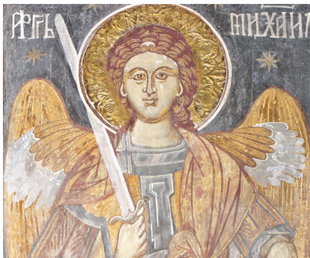
Fig. 14. Slatina, Clocociov Monastery, nave. Archangel Michael (detail), post 1645.

and Cetățuia (1671-1672) 42 , painted by two teams of North-western Greeks, and later at Hurezi (1694), the work of a team led by Konstantinos 43 .