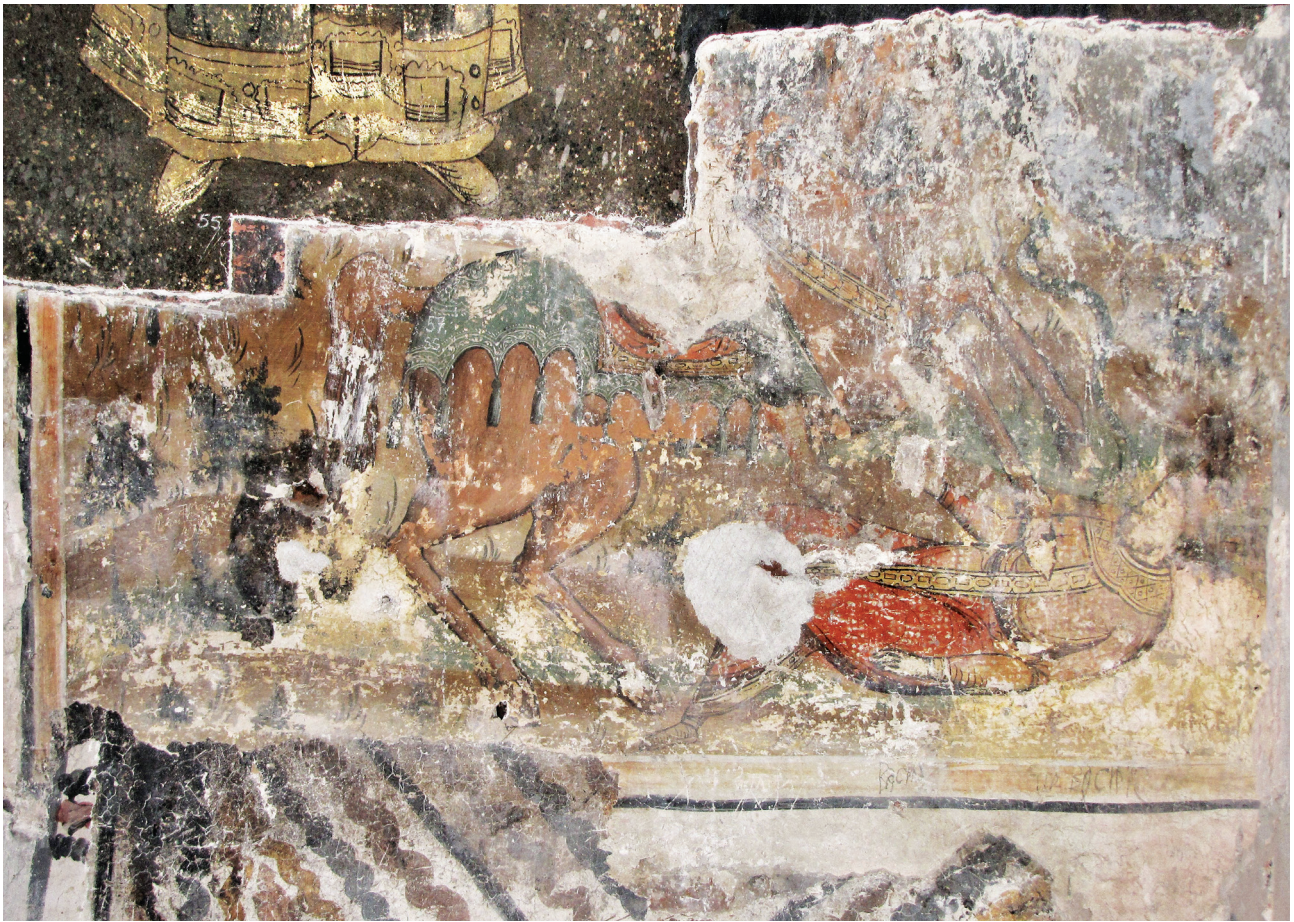
Fig. 12. Cerneți, Monastery of Holy Trinity, nave. Military saint (Demetrios? detail), post 1663.

Basarab at the Brebu monastery church, erected in 1650. But it is likely that the two brothers had close links with the Linotopi workshops.