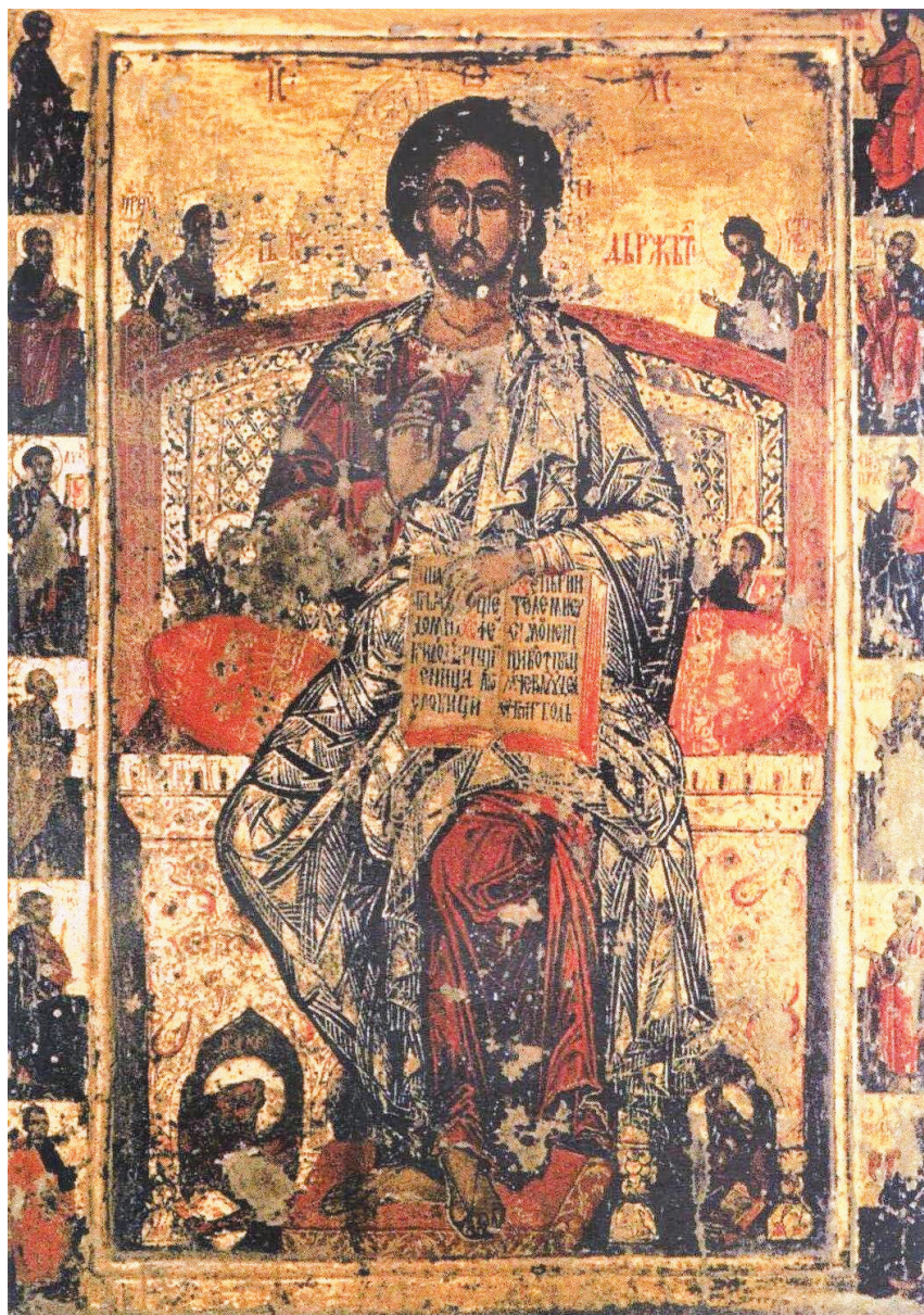
Fig. 19. Băjești church. Christ on throne, 1669.

contributed to their introduction to Patriarch Nikon, at a time when the Russian Patriarch also promoted a “re-Byzantinization” of the Russian Church.