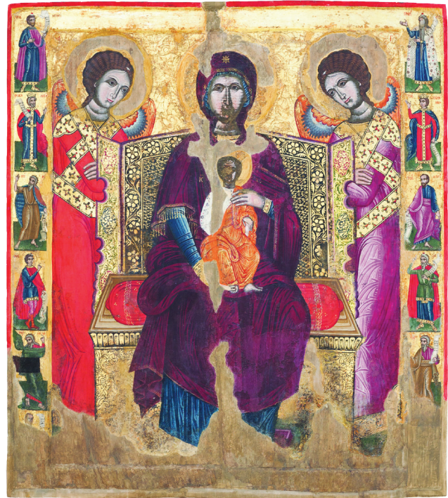
Fig. 18. Museum of Antim Monastery, Mother of God, mid-17th century.

Simeon Movilă, came to the Orthodox Metropolitan Seat of Kiev in 1633 58 . Metropolitan Peter Moghila supported several cultural reforms including the adoption of forms of expression borrowed from Central European Catholic art and their adaptation to the underlying principles of post-Byzantine iconography. Soon, in 1637, Matthew Basarab would set up a printing house at the Monastery of Câmpulung in Wallachia, with the support of Peter Moghila, who contributed by sending a printing press and Ruthenian printers who reproduced German engravings 59 .