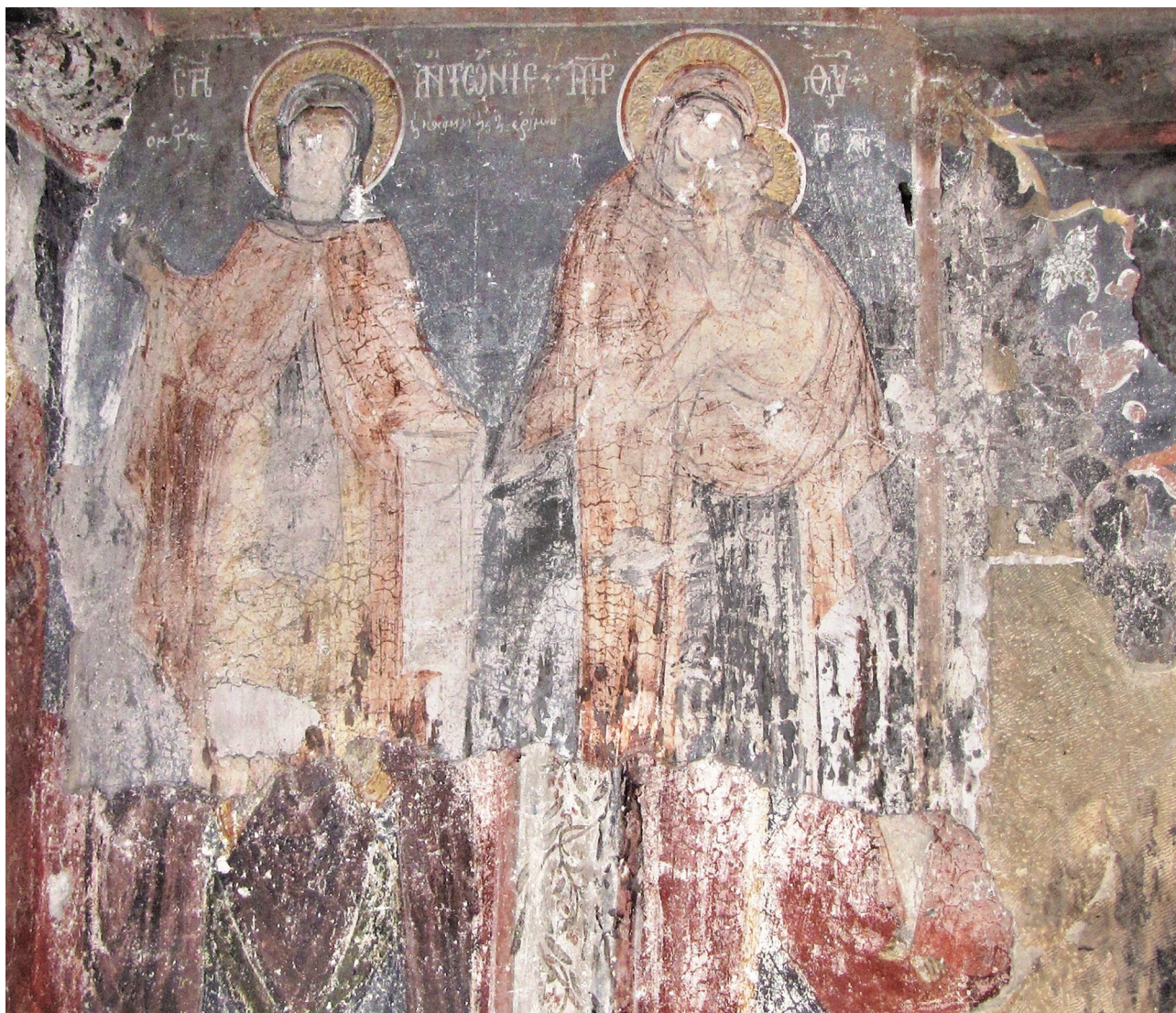
Fig. 10. Strehăia, Monastery of Holy Trinity, narthex. St Anthony the Great, Mother of God and Infant Christ, post 1645.

and Clocociov 34 . Saint Gregory Palamas depicted in the sanctuary at Clocociov –an absolute rarity in Wallachia