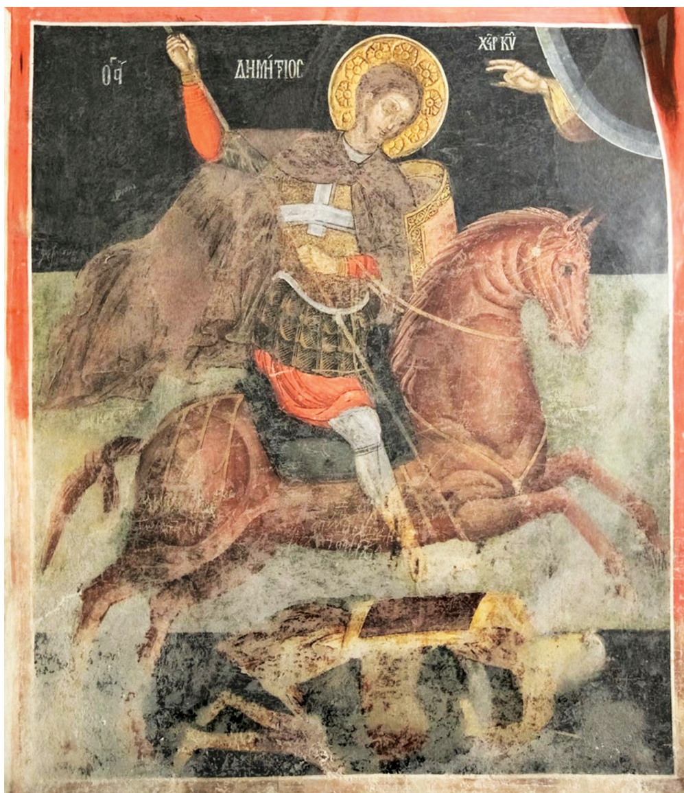
Fig. 13. Iași, Golia Monastery, exonarthex. St Demetrios, 1660.

ornamented with stucco of many of the mid-seventeenth-century Wallachian icons were generally considered an import from the Moldavian or Ukrainian (Ruthenian) milieus 39 , in mural painting they seem to be the result of the North-western Greek influence, such stucco decorations being frequently found in the frescoes and the icons of the Linotopi workshops, heavily influenced by