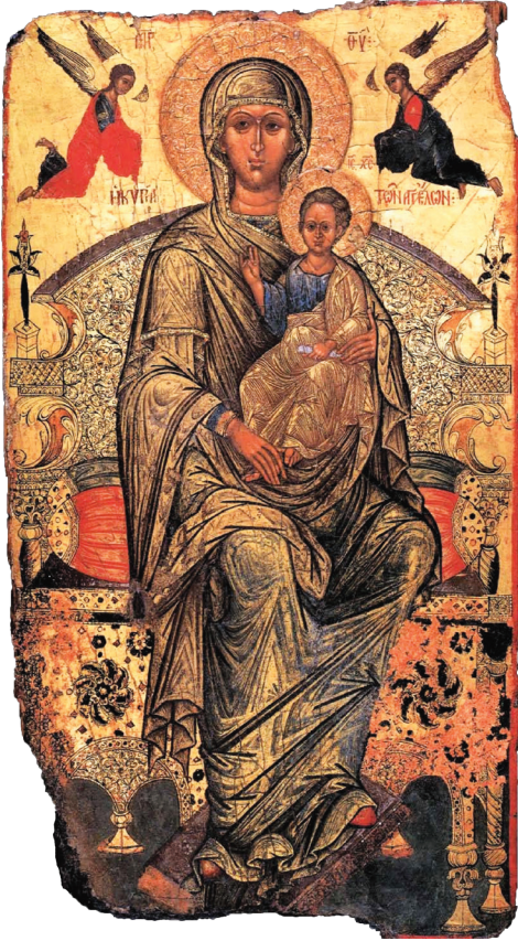
Fig. 3. Korçë National Museum of Medieval Art. Mother of God, 1651.