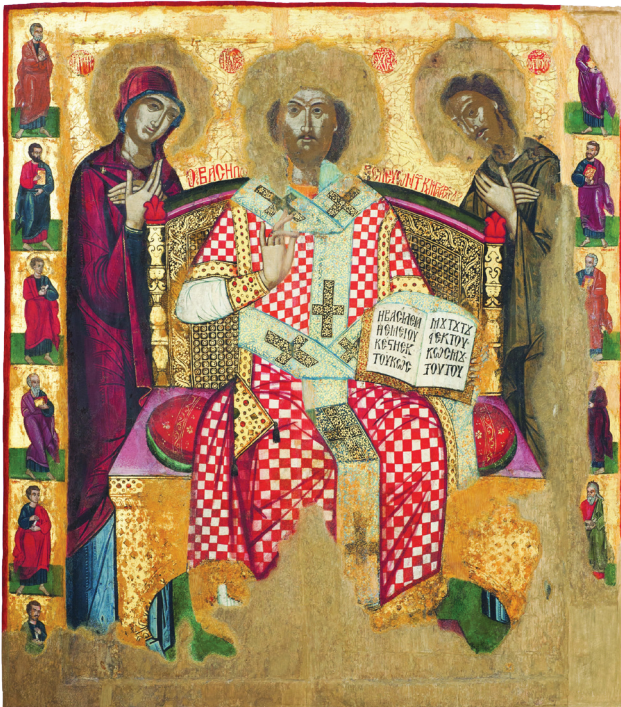
Fig. 17. Bucharest, Museum of Antim Monastery, Bucharest. Christ on throne, mid-17th century.