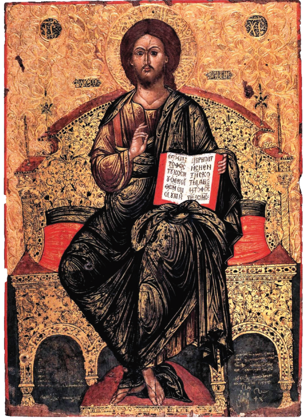
Fig. 4. Korçë National Museum of Medieval Art. Christ on throne, 1651.

motifs, the gilded stucco nimbi and the full-scale depiction of the Virgin Mary Eleousa display characteristics commonly found during this period in the western Greek Macedonian region 23 .