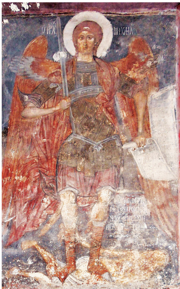
Fig. 16. Berestovo Church, nave, the northern pillar of the triumphal arch. Archangel Michael.