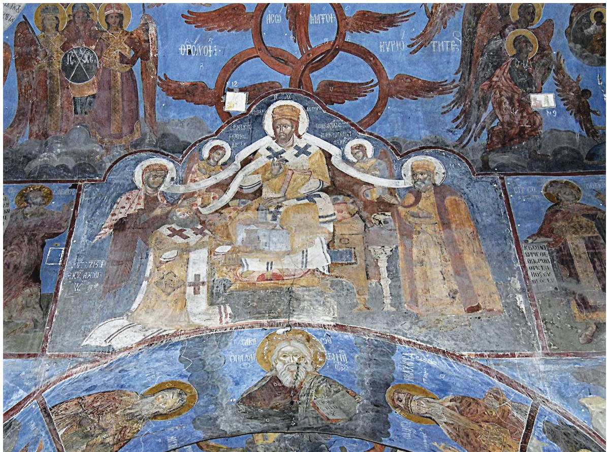
Fig. 2. Berestovo Church, nave, above the triumphal arch. Votive Deesis, 1643.

by Konstantinos at Cotroceni and Hurezi and by the Wallachian painters Tudoran and Pârvu Mutu at Băjești and Filipești de Pădure 19 .