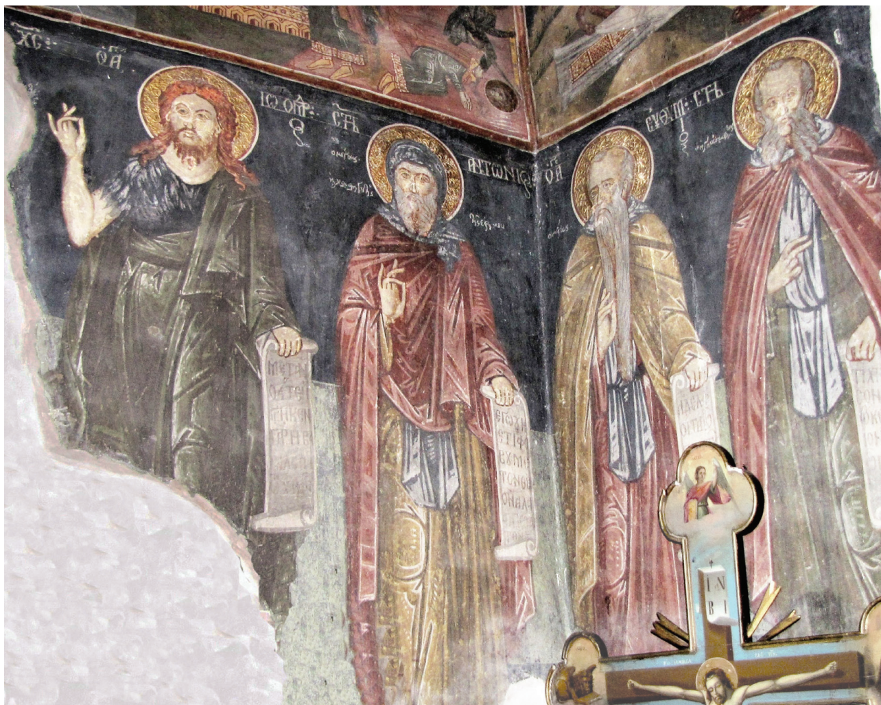
Fig. 15. Plătărești Monastery, narthex. St John the Baptist, St Anthony the Great, St Euthymius the Great, St Sabbas the Sanctified.

a third one that we may consider a synthesis 50 . The so-called “traditionalist trend” 51 , more conservative, was very strong in Wallachia at the beginning of the seventeenth century. The paintings of the Radu Vodă Monastery in Bucharest, financed by Voivode Alexandru Cocon in 1624-1625, were described by Paul de Aleppo as “luxurious”, a work of superior quality, and it is not improbable that the paintings of this Iveron metochion were the work of Greek painters. The mural paintings of the Metropolitan Church in Bucharest, completed in 1668 under Radu Leon, a voivode of Greek origin from