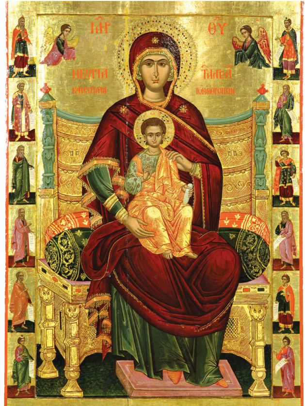
Fig. 7. National Museum of Art, Bucharest. Mother of God icon from Cotroceni Monastery, 1683.

and stylistic features 28 , it is likely that both Dima the Vlach and George the Greek had been trained in the Macedonian area.