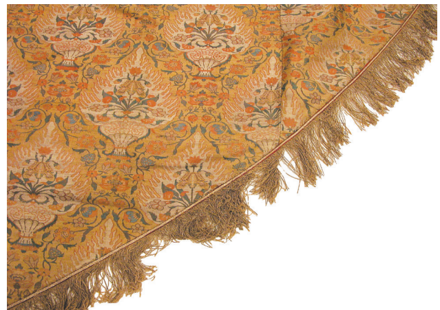
Fig. 3. Catholic cope of early 17th-century Safavid silk adorned with metal threads, flame-haloed bouquet coming out of a vase (detail of Fig. 2).

To continue, while the use of Safavid textiles within an ecclesiastical context during the Renaissance comes as no surprise, the Benaki chasuble presents certain peculiarities. A first observation on the vestment would