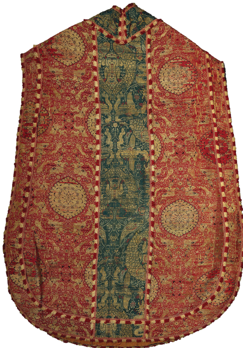
Fig. 12. Bragança, Museu do Abade de Baçal. Chasuble made of 16th-century Safavid silk lampas, and 15th-century European (?) silk lampas (106×63-77 cm).

Finally, the Benaki chasuble's peculiarity could be compared to the Portuguese chasuble previously mentioned (Fig. 12). The latter's Safavid silk features a hunting scene that is quite typical of the Iranian figural tradition, yet is easily recognizable to European eyes 39 .