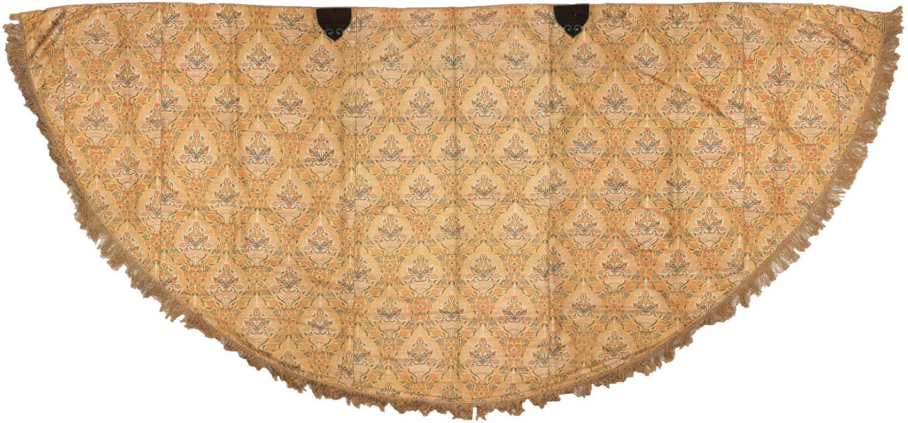
Fig. 2. New York, Metropolitan Museum of Art. Catholic cope of early 17th-century Safavid silk adorned with metal threads (L. 152.4 cm, W 321.3 cm).

Italian provenance. Safavid floral twill-weave silks provided inspiration for these Italian designs, which can be seen more as a creative response and engagement with the foreign (Fig. 5) 19 .