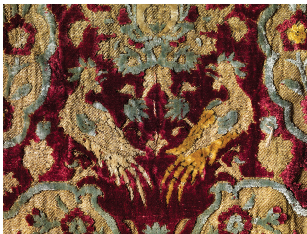
Fig. 10. Chasuble, cruciform orphrey, paired pheasants (detail of Fig. 6).

remains unanswered is whether the velvet of the Benaki chasuble's orphrey was among the designs the Venetians called "à figure". From the remaining evidence no safe conclusions can be drawn. However, there is room for speculation regarding how the Safavid velvet was interpreted in this composition.