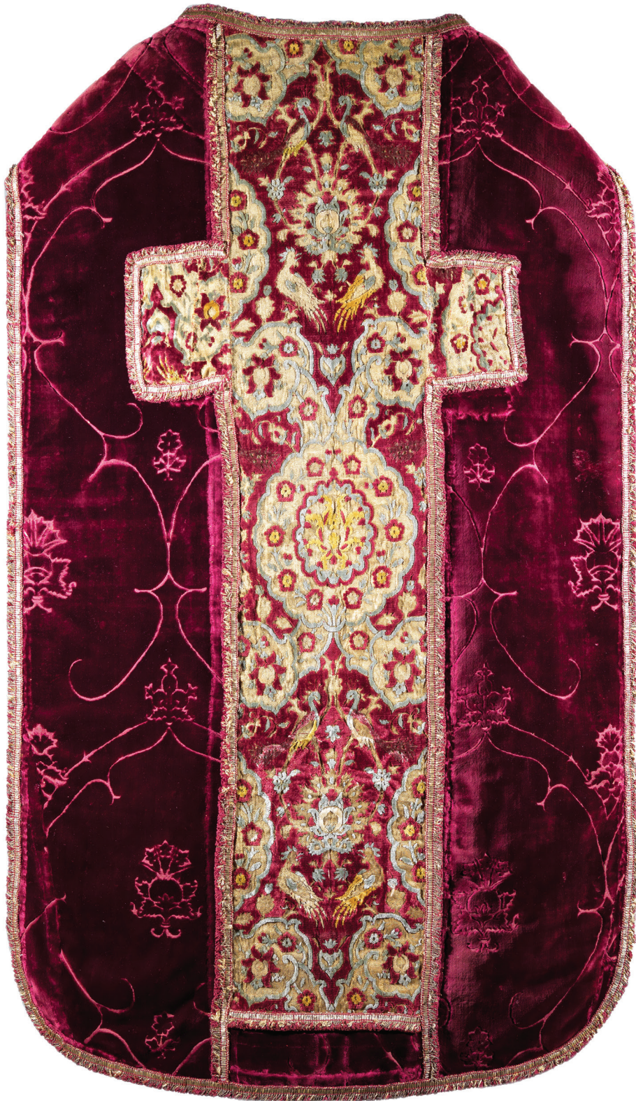
Fig. 6. Athens, Benaki Museum. Chasuble, 15th-century Italian crimson satin velvet, voided; late 16th – early 17th-century Safavid polychrome velvet with gilded silver-thread ground, voided and brocaded (114×68 cm).