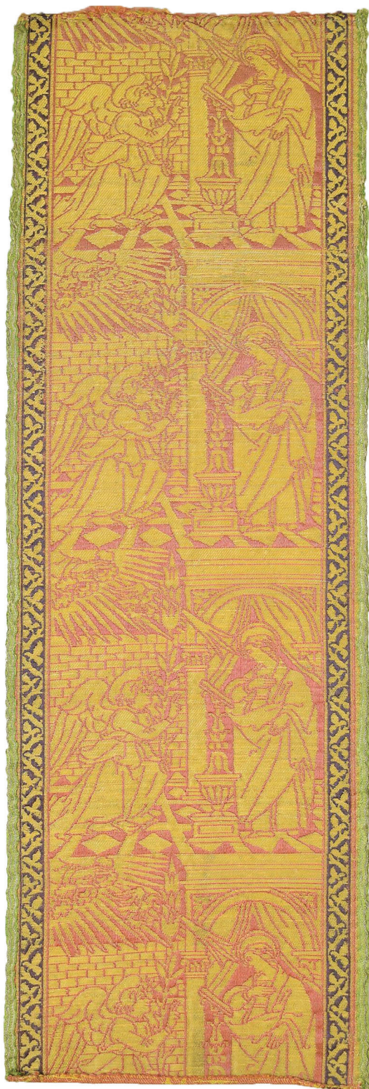
Fig. 7. London, Victoria and Albert Museum. The Annunciation in a figured silk ( bordo figurato ), second half of the 15th century, Florentine (?) lampas weave with gilt thread.

Fine Arts De Young Museum 23 . However, no matter how typical the composition may be, I would argue that its use on the chasuble was no mere coincidence, but probably was meant to convey a very specific meaning.