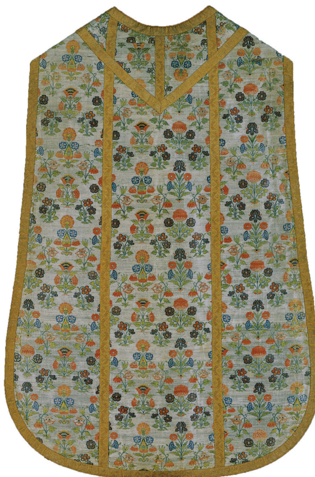
Fig. 5. Copenhagen, The David Collection. Chasuble, first half of the 17th century, Safavid silk, twill weave with metal thread (110×74.5 cm).

However, cruciform orphreys were not unusual at that time in Italy, especially in the north 21 . Then, the choice of the Safavid velvet seems atypical, since decorated orphreys usually featured religious iconography, either embroidered or woven (e.g. a bordo figurato ) (Fig. 7) 22 .