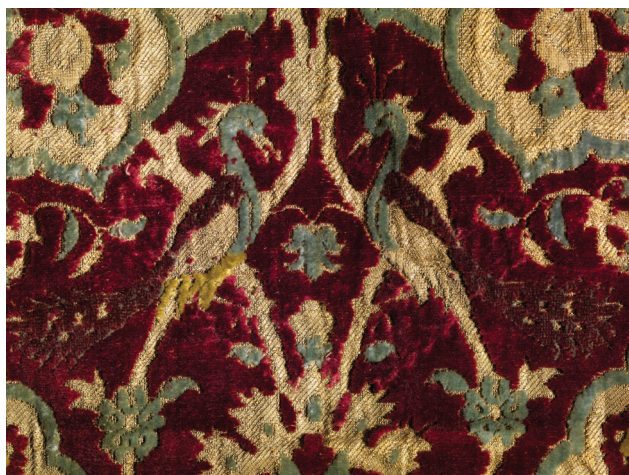
Fig. 9. Chasuble, cruciform orphrey, paired peacocks (detail of Fig. 6).