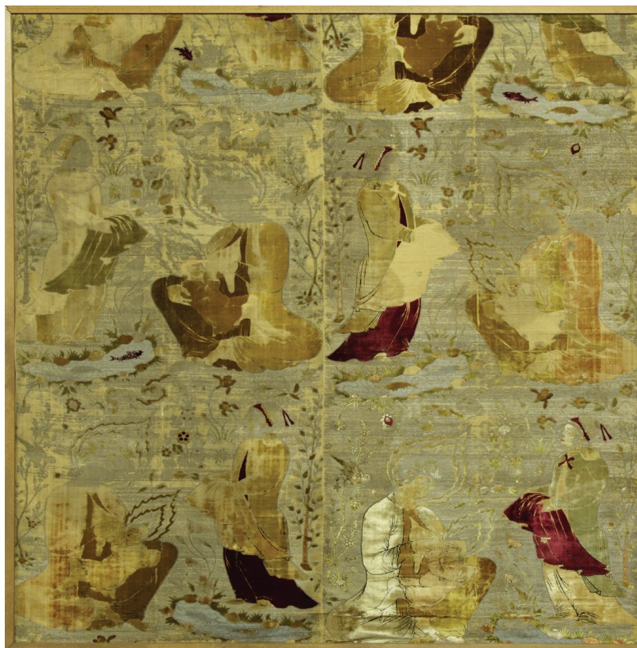
Fig. 1. Venice, Museo Civico Correr. Safavid cut velvet, brocaded and weft-patterned (136×136 cm), late 16th – early 17th century.

as a quasi-institutionalized intermediary, effectively penetrating the textiles trade 10 . The success of this de facto partnership can be traced, thanks to the many Iranian textiles used by Christian Churches in Europe. These have been brought into the art historical spotlight during the last decades. A very interesting ecclesiastical piece is the piviale (cope) of the Museo Nazionale d'Arte Orientale –