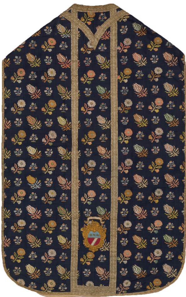
Fig. 4. New York, Metropolitan Museum of Art. Chasuble ( pi-aneta ), mid-17th century Italian silk, brocaded plain weave, probably Venice (119.4×77.5 cm).