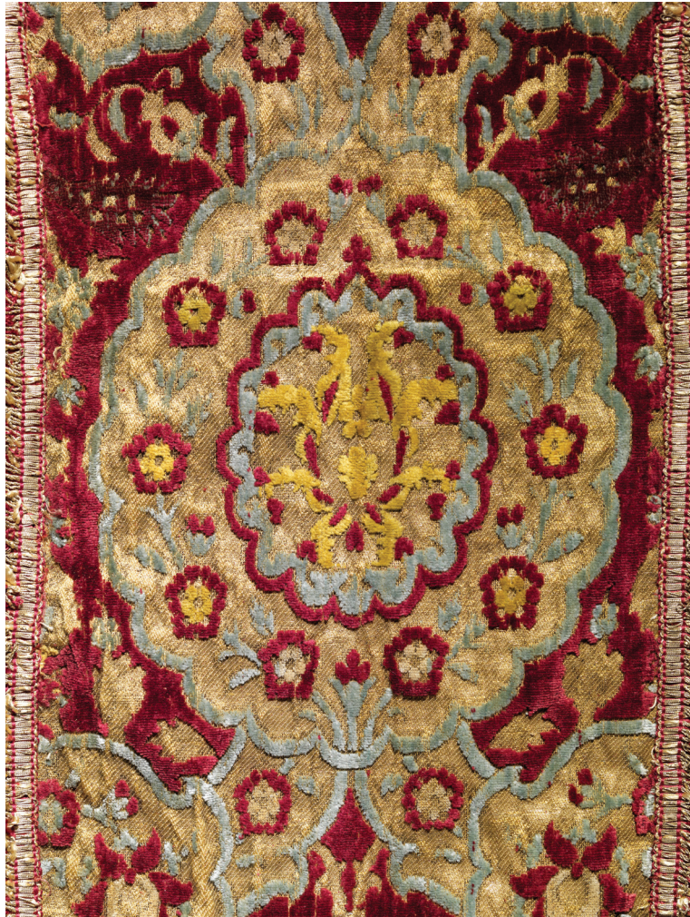
Fig. 8. Chasuble, cruciform orphey, central medallion (detail of Fig. 6).

It is not known if this was the second use of any of the textiles, although the Italian most probably predates the Safavid velvet 27 .