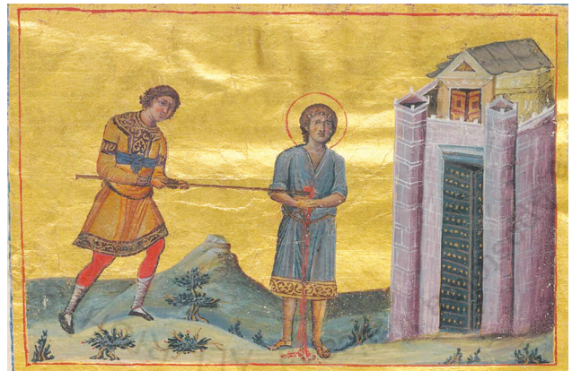
Fig. 1. Menologium of Basil II (Vaticanus gr. 1613), p. 5. St Mamas's martyrdom, ca. 1000.

In Byzantine iconography St Mamas is most frequently depicted as beardless, a young boy, standing next to or riding on the back of a tamed lion while, at times, he may be flanked by other animals such as stags, a hind, or some sheep. He is also portrayed as holding a sheep in one arm and a shepherd's crook or a cross in the other. A depiction of him as a young shepherd milking a hind is less common 21 . All these iconographic themes are meant