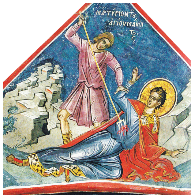
Fig. 6. Mount Athos, Monastery of Dionysiou, Lite of the katholikon . St Mamas's martyrdom, 1546/47.

In Cyprus in the same period the scene of St Mamas's martyrdom is depicted in a vita-icon from the church of