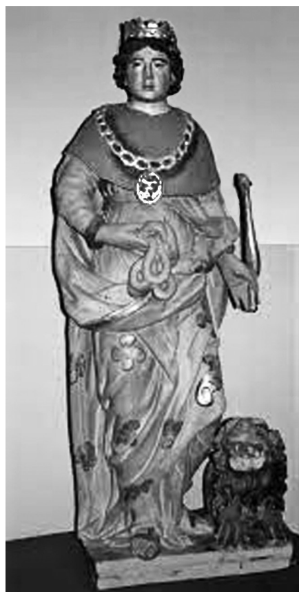
Fig. 8. France, Rivière-les-Fosses, Haute-Marne. Saint Mamas holding his entrails and standing next to a lion, 17th century.