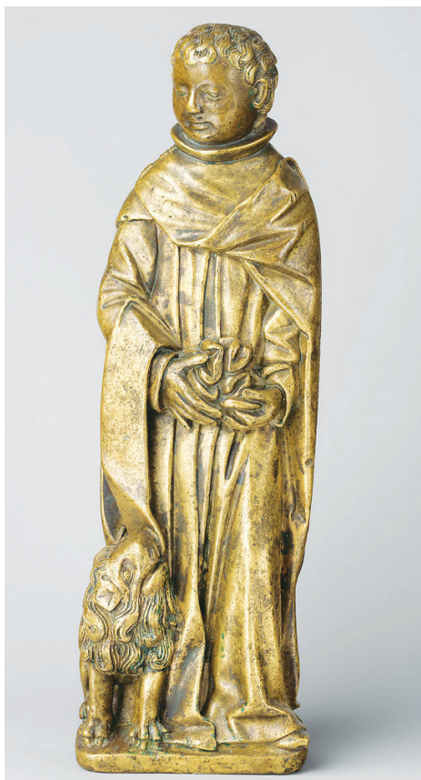
Fig. 7. New York, The Metropolitan Museum. Saint Mamas holding his entrails and standing next to a lion, copper, French, 15th century.