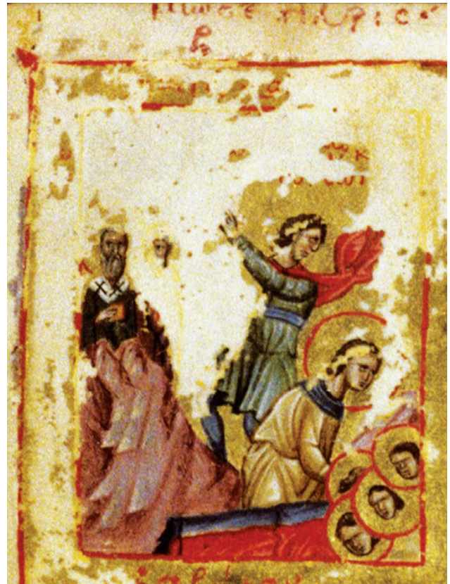
Fig. 2. Oxford Bodleian Library. Bodleianus theol. gr. f. 1 , f. 7v, detail. St Mamas's martyrdom, 1322-1340.