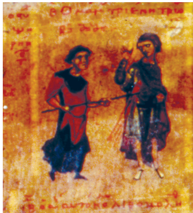
Fig. 3. Monastery of Sinai. Leaf from a six-panelled icon (hexaptych). St Mamas's martyrdom , detail, 11th century.