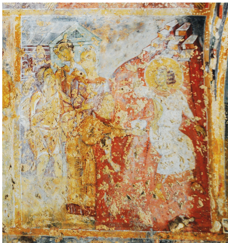
Fig. 5. Crete, Chania province, Palaiochora - Kountoura, Church of Saint Mamas, naos. St Mamas's martyrdom, 1355/56.

As regards icons and frescoes, we find perhaps the earliest extant depiction of St Mamas's martyrdom in a six-panelled icon (hexptych) from Sinai dated to the eleventh century. The hexptych, usually categorised as one of the calendar icons found in the monastery of Saint Catherine, includes four "calendar panels", each one with nine rows of saints, represented by their portraits or by scenes of their martyrdoms. St Mamas's martyrdom is found in the second compartment in the top row; the martyr is depicted as being stabbed by his executioner in a standing position (Fig. 3), i.e. in a similar way to that seen in the first two Menologia mentioned above 28 . Another example is located in the narthex of