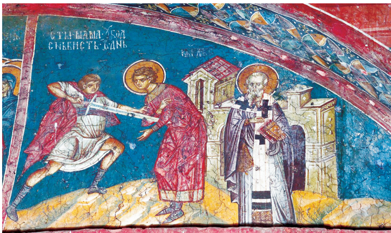
Fig. 4. Dečani monastery, katholikon, narthex. St Mamas's martyrdom , 1346/47.