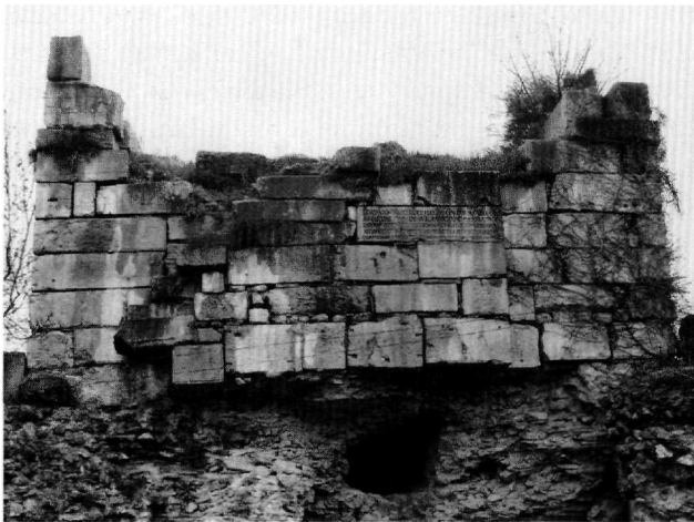
Fig. 2. Nicaea, city side of Tower 71 with Artabasdos inscription (as in 1996).

the glorious patrician and curopalates 22 , completed by his toil.” The inscription marks, therefore, the very spot where the Arabs were “put to shame”. Not only tower 71, but the whole stretch of wall between towers 70 and 72 23 was reconstructed at this time out of re-used marble blocks and column shafts taken from ancient buildings. That was probably the stretch that was partially destroyed, as Theophanes puts it.