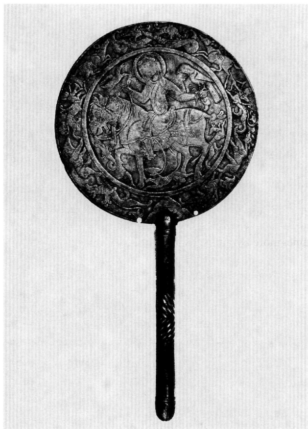
Fig. 3. Steel mirror, back with figures. Topkapi Sarayi Museum, Istanbul.

When classified by its construction, it is seen that the object has four sides formed by the wider gauge of wire, while its interior is divided vertically by thinner wires into several divisions. When classified by the placement of the hands, it is seen that the figure's fingers in front of the object are rendered with extreme precision, both stretched out and turned under, as they reach across the vertical wires. These positions do not correspond to the way hands would be holding an object, but rather the way fingers would be represented