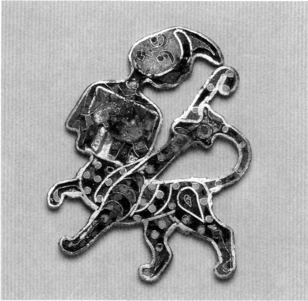
Fig. 1. Cloisonné enamel silhouette figure. Dumbarton Oaks, Washington, D.C.

genus in ancient and medieval art, the tripartite figure, what I shall also call a trimorph. Part human, part winged feline, and part serpent, it is, taxonomically speaking, unequivocally monstrous. The figure's bestial character, however, is mitigated by its self-contained, benign pose and somewhat wistful gaze. The enamel figure projects a sense of delicacy and charm, reflecting its docile movement, its diminutive size and its assured handling of the coloristic enamel work.