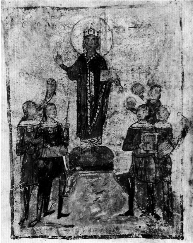
Fig. 4. King David with musicians, Frontispiece to Spencer Collection, Ms. 1, psalterium gr. New York Public Library.

nizable. Examples appear hanging from trees in illustrations of Psalm 136 (137): 2, “In the willows there we hung up our lyres” 26 , e.g., in Vatopedi 760 27 , and in a Psalter in Jerusalem, written at the Monastery of Ephoros in Constantinople 28 . The five-string psaltery is also placed in David’s own hands, once where he is represented as a shepherd and once as a king, although in both cases he is shown holding rather than playing the instrument 29 .