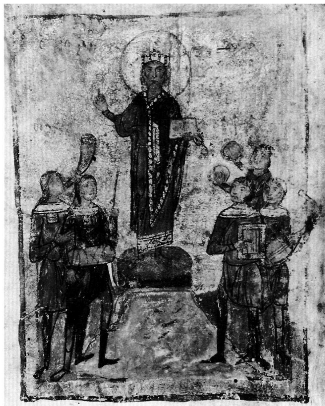
Fig. 4. King David with musicians, Frontispiece to Spencer Collection, Ms. 1, psalterium gr. New York Public Library.

nizable. Examples appear hanging from trees in illustrations of Psalm 136 (137): 2, "In the willows there we hung up our lyres" 26 , e.g., in Vatopedi 760 27 , and in a Psalter in Jerusalem, written at the Monastery of Ephoros in Constantinople 28 . The five-string psaltery is also placed in David's own hands, once where he is represented as a shepherd and once as a king, although in both cases he is shown holding rather than playing the instrument 29 .