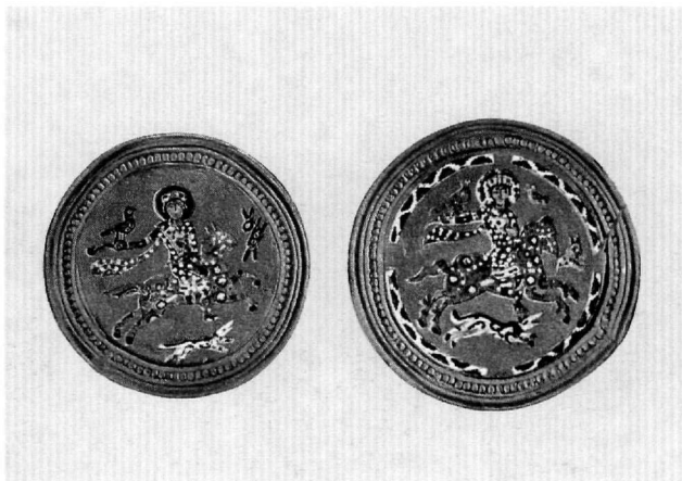
Fig. 5. Equestrian falconers, cloisonné enamel roundels on the Pala d'Oro. San Marco, Venice.

with which facial features, fingers and details of clothing are rendered indicate that the Dumbarton Oaks figure and "Queen Dagmar's" cross were produced within the same artistic culture.