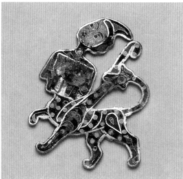
Fig. 1. Cloisonné enamel silhouette figure. Dumbarton Oaks, Washington, D.C.

genus in ancient and medieval art, the tripartite figure, what I shall also call a trimorph. Part human, part winged feline, and part serpent, it is, taxonomically speaking, unequivocally monstrous. The figure's bestial character, however, is mitigated by its self-contained, benign pose and somewhat wistful gaze. The enamel figure projects a sense of delicacy and charm, reflecting its docile movement, its diminutive size and its assured handling of the coloristic enamel work.